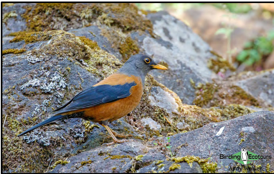
Though a stunning bird, this Chestnut Thrush was actually a bit of a bully, keeping most of the other birds away from 'his' food.

Also present in the beautiful gardens were Grey-backed Shrike , White-rumped Shama , Olive-backed Pipit , Chestnut Bunting , Slaty-backed Flycatcher , Rufous-gorgeted Flycatcher , Lesser Coucal , and Blue-fronted Redstart . An excellent way to end our mountain birding of the tour!