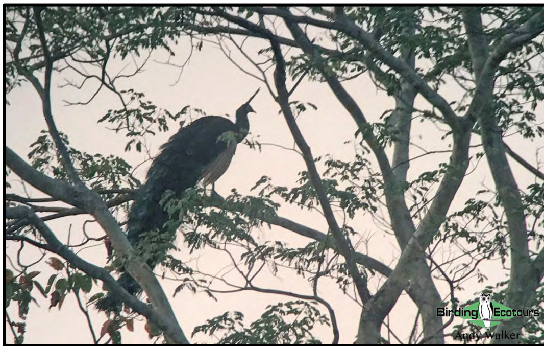
A phone-scoped record shot of a male Green Peafowl , one of several birds we found at a roost site.

We started the morning waiting for Blossom-headed Parakeets to leave their roost site and drop in and give us a view, and that they did, stunning birds! However, before that one of the surprises of the whole tour occurred when we noticed a small flock of the Endangered (BirdLife International) Green Peafowl roosting in some nearby trees while it was still dark. As it got a bit lighter we could make out a bit more of the birds and grabbed a couple of record shots of this rare bird. One other spectacular sight involved a flock of around 150 Green Bee-eaters that left their nearby roost site and sat in a bare tree, giving some nice views as they huddled together for warmth as the sun rose. Still more birds came into view, such as Burmese Shrike , Golden-fronted Leafbird , Purple Sunbird , Red-whiskered Bulbul , Chestnut-tailed Starling , and Pied Bush Chat .