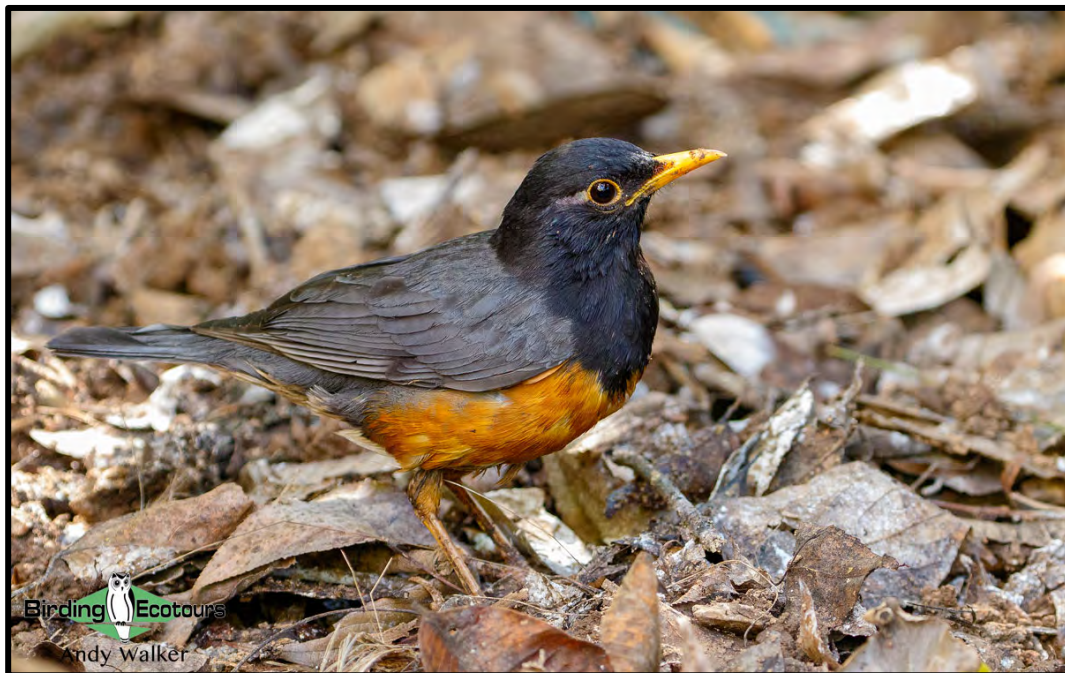
This gorgeous Black-breasted Thrush showed to a matter of feet, giving amazing views.

From late-morning until mid-afternoon we moved locations around the mountain and found a host of new birds as well as more of the above; some of the top picks included White-tailed Robin , Dark-sided Thrush , numerous Black-breasted Thrushes (some giving extremely good, close views), Daurian Redstart , Blue-throated Barbet , Mrs. Gould's Sunbird , Olive-backed Pipit , and Orange-breasted Leafbird , to name a few (along with numerous Phylloscopus warblers and several white-eyes).