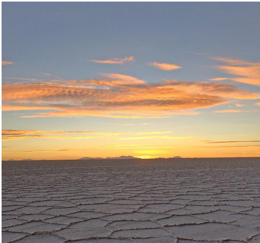
Uyuni Salt Plains (Jacques Smuts)

The next day we flew to Uyuni in the Altiplano for 2 days extension to visit the Great Salar de Uyuni, the largest extension of salt on the planet. This place is probably one of the highlights of South America. The photography opportunities for natural scenery were outstanding; and even though life is extremely scarce in this desert of salt, we managed to see James's and Chilean Flamingo and Black-hooded and Mourning Sierra Finch .