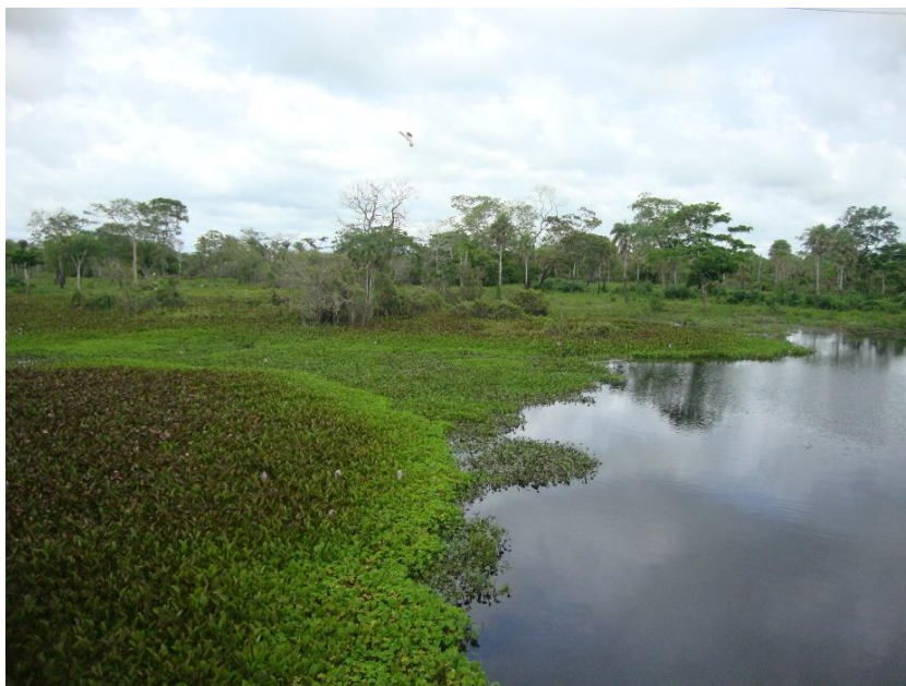
Wetlands in the Beni province

Here we saw Jabiru, Wood Stork, Roseate Spoonbill, Snail Kite, Black-collared Hawk, Great Black Hawk, Savanna Hawk, Greater and Lesser Yellowlegs, White-headed and Black-backed Marsh Tyrants, Yellow-chevroned Parakeet, Peach-fronted Parakeet, Blue-and-yellow Macaw, Buff-necked Ibis, Cattle Tyrant, Black-capped Donacobius, Toco Toucan, Scarlet-headed and Unicolored Blackbirds, and Rufous-tailed Jacamar