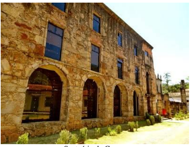
Santuário do Caraça

Since 1982 the monks leave food to attract wolves to come to the entrance of the monastery. But, even though the sightings are almost guaranteed, the animals are still shy and unpredictable, as we have heard about people who actually missed the wolves in Caraça. One can wait for the animals to come just after dinner, which ends by 7.00 p.m., until 12.00 a.m., when the monks close the door of the monastery and turn off the lights.