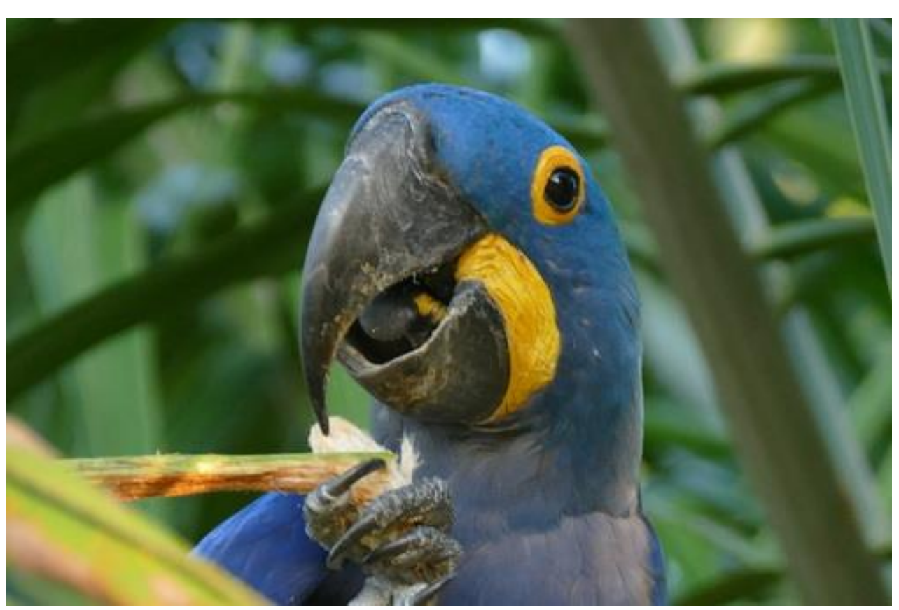
Hyacinth Macaw