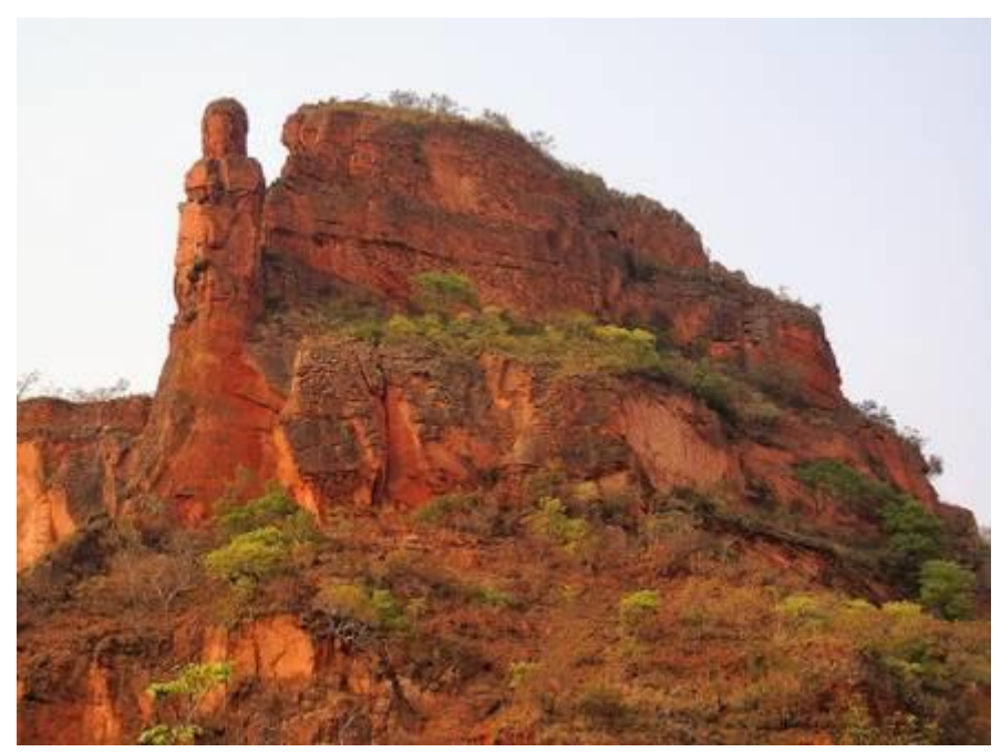
Chapada dos Guimarães scenery

Around noon we arrived at the little town of Chapada, where we had our first lunch in a local restaurant. Then we went to our next destination, Pousada do Parque within the Chapada dos Guimarães National Park. It was very hot when we arrived, so we decided to have a short break and leave by 3:30 p.m. toward the Vale da Benção area outside the lodge property. This great spot holds a nice forest and provides some interesting species, such as Rufous-tailed Jacamar , Plain Antvireo , Swallow Tanager , Blue Dacnis , Sayaca Tanager , Palm Tanager , Saffron-billed Sparrow , Moustached Wren , Thrush-like Wren , Short-crested Flycatcher , Blue-crowned Trogon , Amazonian Motmot , and Channel-billed Toucan . We came back to the lodge in time to tick several Chopi Blackbirds and Saffron Finches . After dinner we tried for some night birds around the property and did well, finding Tropical Screech Owl , Little Nightjar , and Pauraque . This was our first day birding in Brazil.