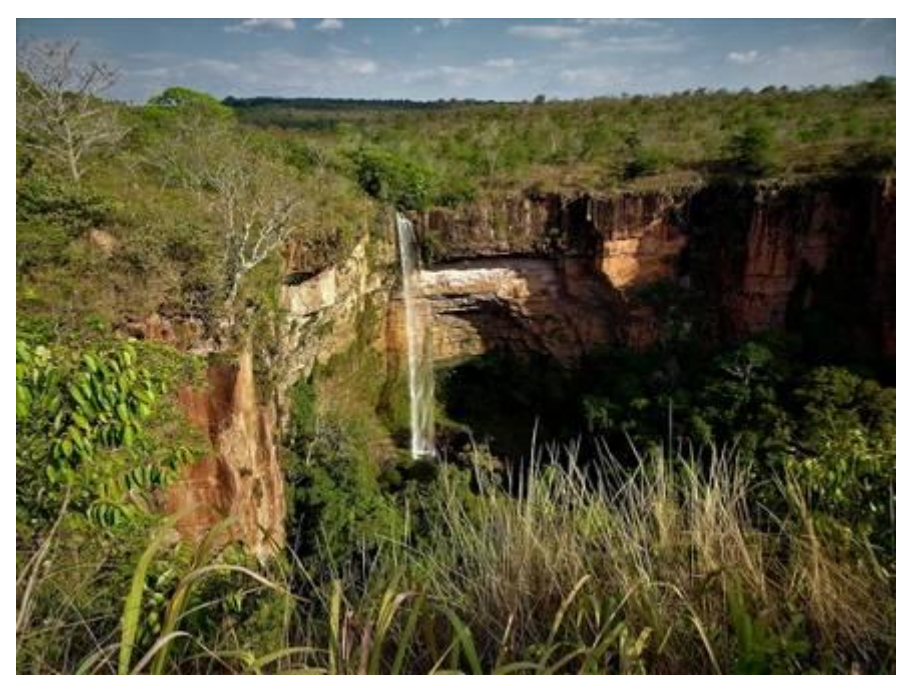
Bridal Veil Waterfall

After a midday break we drove to the famous Bridal Veil Waterfall, looking for the sought-after Blue Finch, but there was no trace of it. In fact it was rather quiet, with only Swallow Tanager , White-eyed Parakeet , Cliff Flycatcher , Tropical Kingbird , and Blue Dacnis making an appearance.