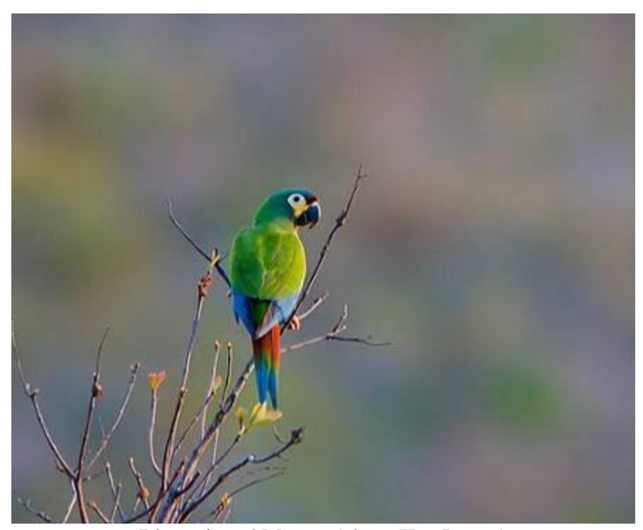
Blue-winged Macaw

Having arrived safely in Cuiabá in central Brazil we started our tour immediately, heading for the Chapada dos Guimarães National Park, situated not only in central Brazil but even including the geographical center of South America. Chapada dos Guimarães is part of Brazil's vast tropical savanna ecoregion, the Cerrado, which is one of the richest of all tropical savanna regions and has high levels of endemism, characterized by enormous ranges of plant and animal biodiversity. Our fabulous birding soon started along the way, as we approached Chapada dos Guimarães, with Toco Toucan, Peach-fronted Parakeet, Chalkbrowed Mockingbird, Rufous Hornero, Rusty-margined Flycatcher, Cliff Flycatcher, Black and Turkey Vultures, Guira Cuckoo, and Picazuro Pigeon all showing well. Further along the road, near the scenic Hell's Gate, we scored with our main target here, the localized Blue-winged Macaw, and with a nice pair of Red-and-green Macaws. We explored a road that leads deep into the Cerrado, and soon we found the endemic Chapada Flycatcher and were reward with splendid views of two birds displaying. Other birds in the area included Southern Lapwing, Groove-billed Ani, White-eyed Parakeet, Tropical Kingbird, Rufous-bellied Thrush, and Purple-throated Euphonia.