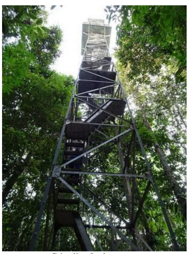
Cristalino Lodge tower

It started to get very hot, and the mist did not vanish. In addition we were constantly bothered by sweat bees and wasps, so we decided to descend and explore the forest trails, hoping to find understory species. We actually did well, because the first bird we found was Banded Antbird . This lovely terrestrial bird must be one of the most attractive species in the family. It keeps maintaining a territory near the bottom of the tower. We also saw Ruddy-tailed Flycatcher and Amazonian Royal Flycatcher . Later we added Plain Xenops , Spix's Woodcreeper , Grey Antwren , Pygmy Antwren , Sclater's Antwren , Rufous-rumped Foliage-gleaner , Squirrel Cuckoo , Long-tailed Woodcreeper , Olivaceous Flatbill , and White-crested Spadebill .