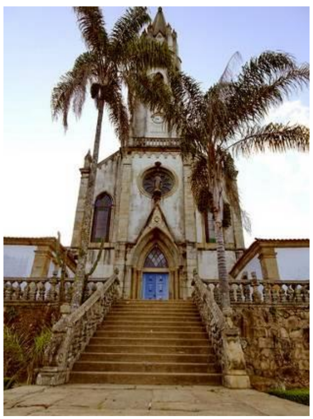
Santuário do Caraça