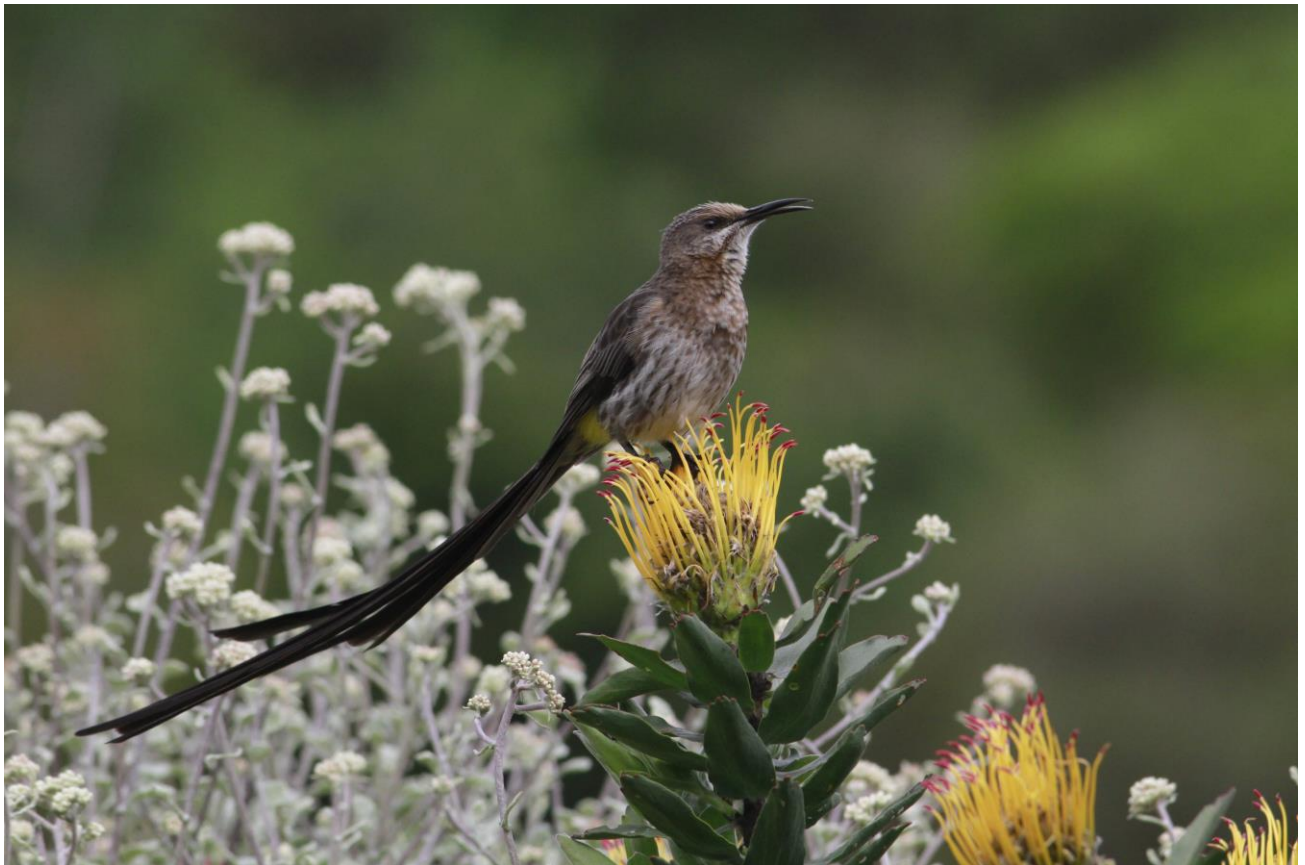
Cape Sugarbird (Dominic Rollinson)