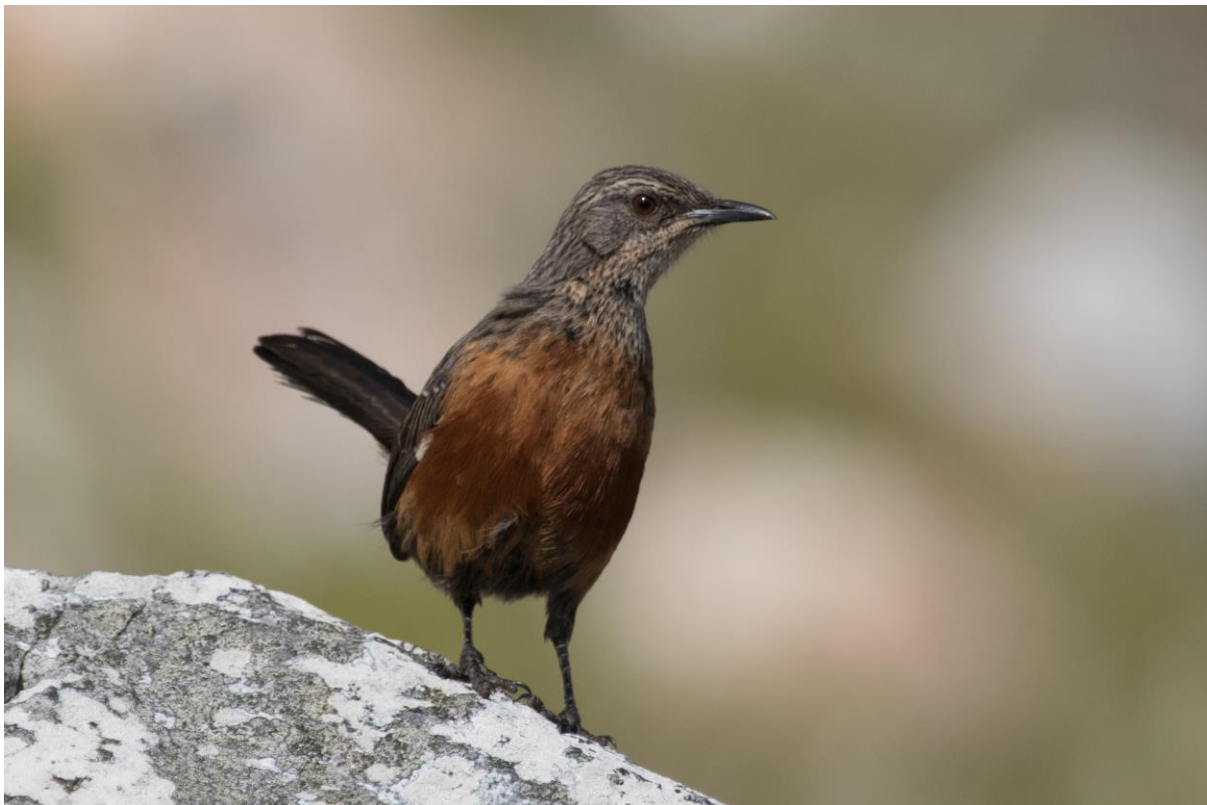
Cape Rockjumper (Dominic Rollinson)

After fetching Rosalie from Seepoint we made our way to the small town of Rooi Els which was our first birding destination of the day. The main target here was Cape Rockjumper which was surprisingly easy to find today and we eventually managed to find two or three groups, with the birds calling nonstop during our time here. On the rocky slopes we also came across White-necked Raven , Familiar Chat , Cape and Sentinel Rock Thrush , Cape Bunting and Cape Siskin , while both Rock Kestrel and Peregrine Falcon were seen hunting overhead. We heard a number of Ground Woodpeckers high up on the slopes but unfortunately could not get any visuals. In the fynbos around the village we came across Orange-breasted Sunbird , Cape Bulbul and many Cape Sugarbirds . A single Cape Gannet was scoped just offshore as well as a Bryde's Whale .