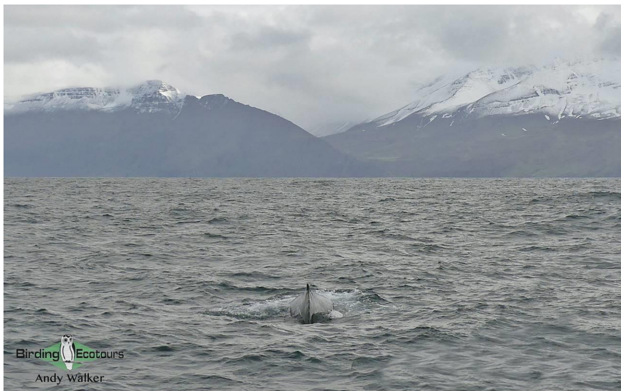
Humpback Whale disappearing into the horizon after swimming around near our boat.