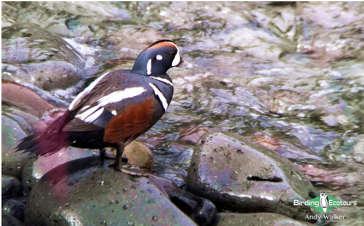
Harlequin Duck must surely rate as one of the best-looking ducks in the world.

flocks of the exquisite Harlequin Duck . Good, close views were had of one of the best-looking ducks on the planet, and we soaked the views in. As the day's birding came to a close we headed back to town for another great meal.