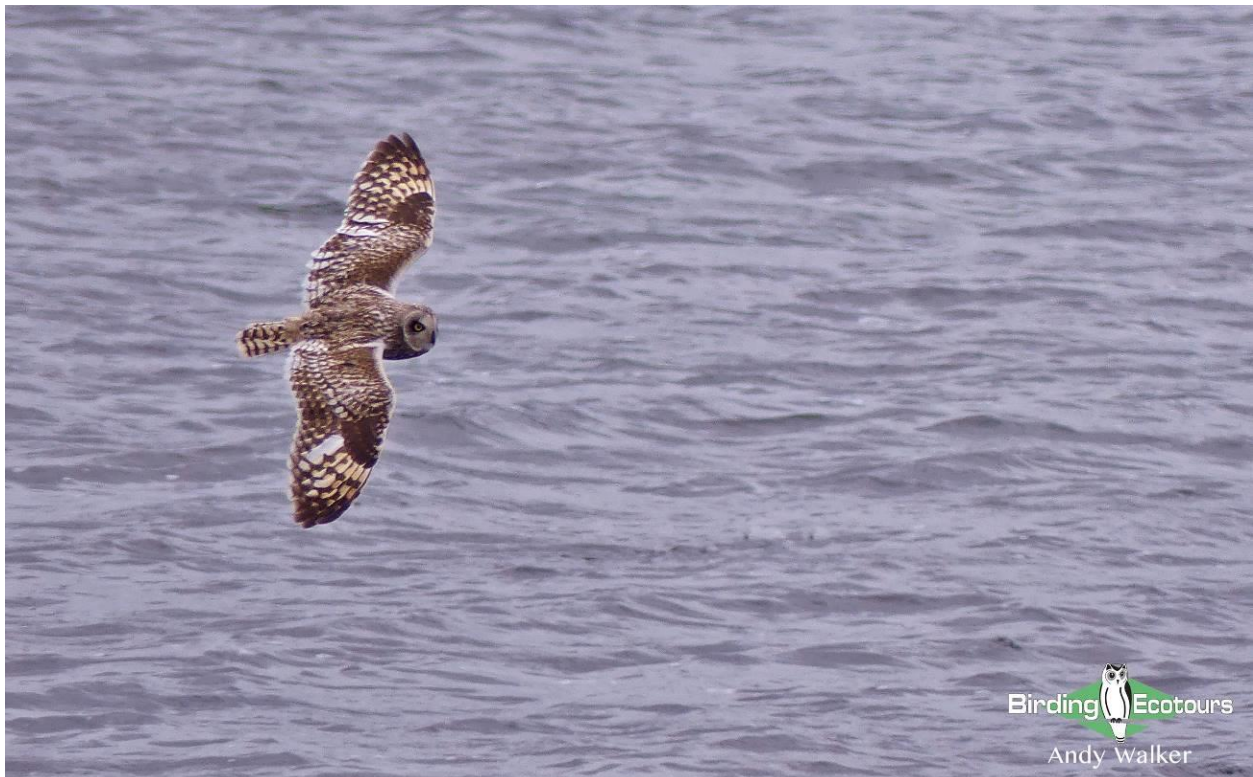
Short-eared Owl gave some great views!

As late afternoon arrived the temperature really dropped, and the rain increased, but unperturbed we persisted, and a very productive stop at the lake gave us our first Barrow's Goldeneye , Common Scoter , Gadwall , and Northern Pintail of the trip. We also got improved views of Eurasian Wigeon , Eurasian Teal , Red-breasted Merganser , Tufted Duck , Mallard , Greater Scaup , and Horned Grebe . While looking for wildfowl here we also had our best looks at a perched, pale-phased Parasitic Jaeger , but best of all was the highly-sought, and anticipated, Short-eared Owl . One flew right toward us, being heavily mobbed by numerous Redwings and assorted shorebirds before giving a great series of views.