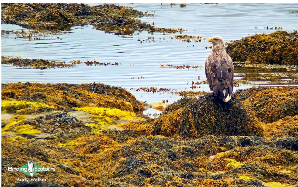
This White-tailed Eagle was sitting near its nest, getting occasional flack from a Great Black-backed Gull!