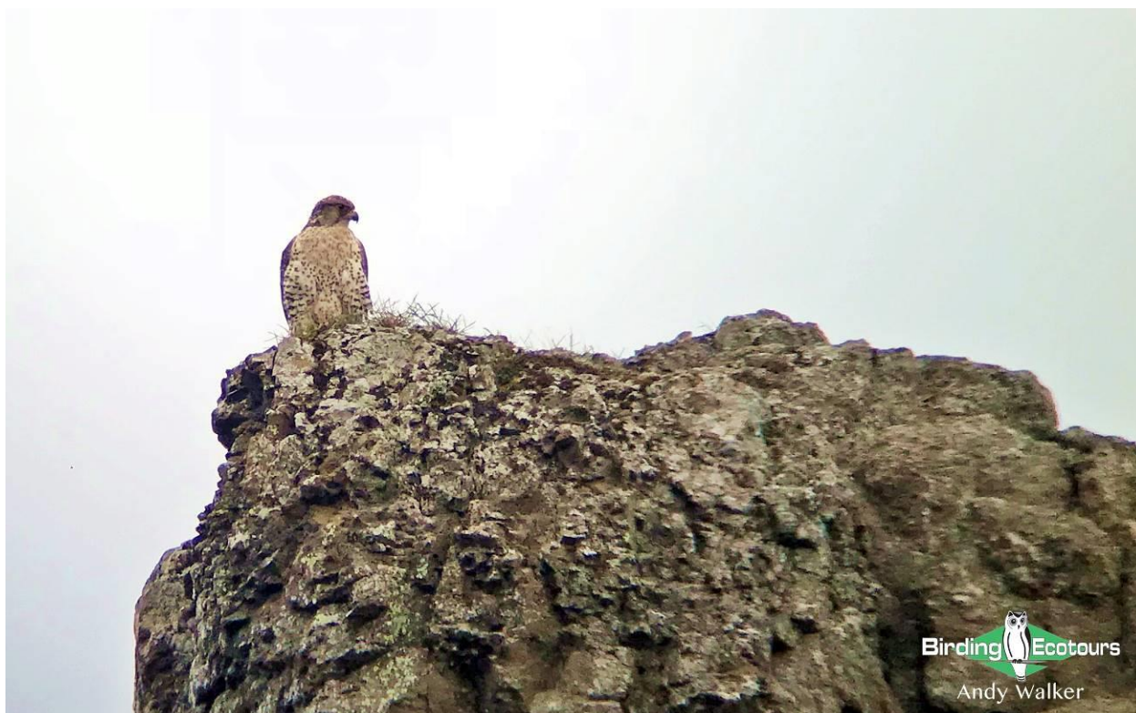
Watching a pair of Gyrfalcons near their nest will not be forgotten for a long time!