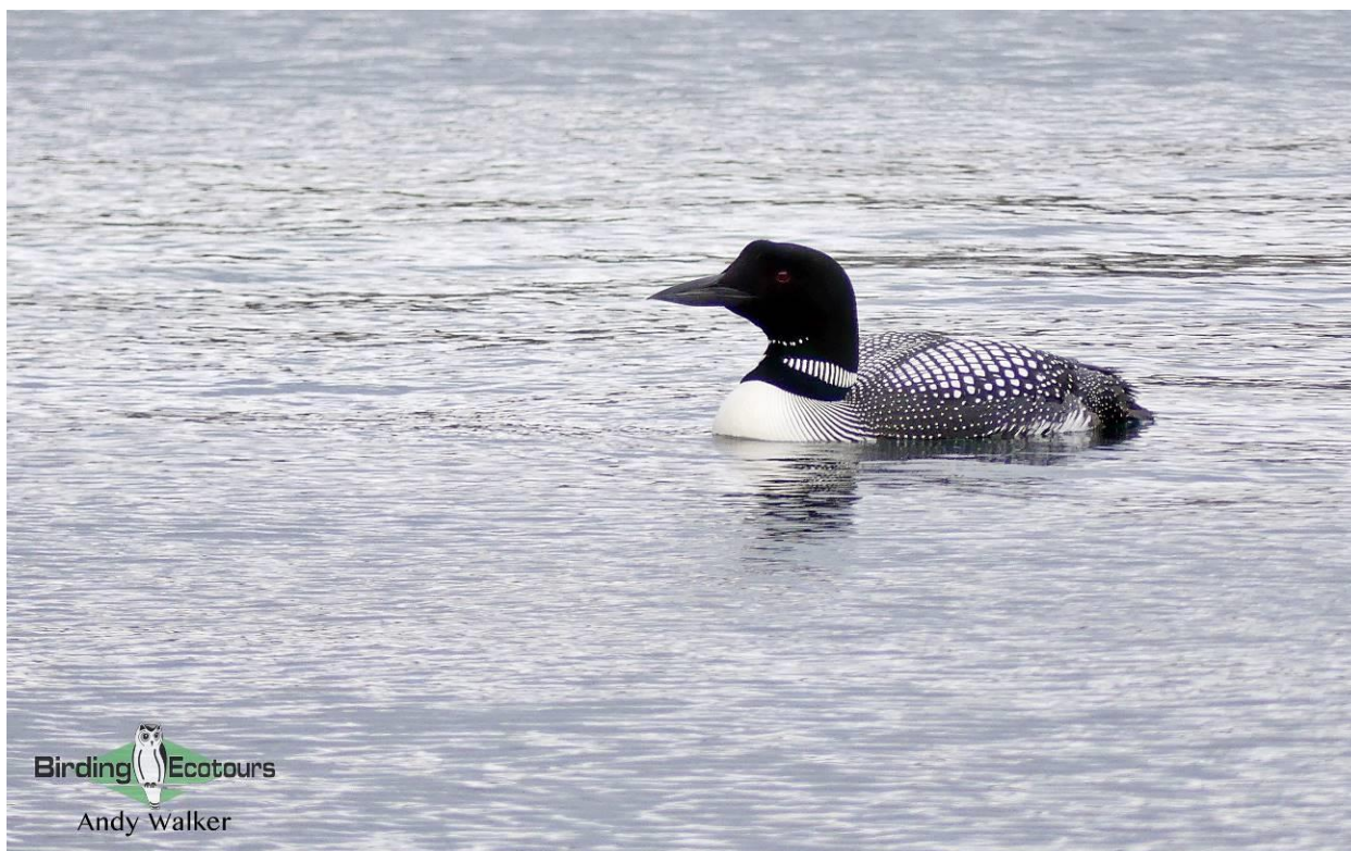
The immaculate Common Loon

During the afternoon we drove to the pretty coastal town of Húsavík, stopping along the way for a roadside Short-eared Owl , followed by Rock Ptarmigan , Common Loon (with babies), and Horned Grebe (also with babies) at a small pond. We then took a whale-watching trip into the Skjálfandi Bay, where we enjoyed very good looks at White-beaked Dolphin , Humpback Whale (picture at end of report), Atlantic Puffin , Black Guillemot , European Herring Gull , and Great Skua . It was a little cold and rough at times due to the three-meter swell but still an enjoyable afternoon, which we finished with a pair of Harlequin Ducks in a small river near our hotel.