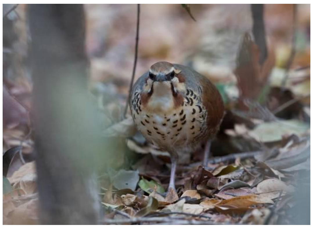
White-breasted Mesite - Mesitornis variegatus

A brief night walk added grey-brown and golden-brown mouse lemurs, western fat-tailed dwarf lemur, a handful of Oustalet's chameleons, and a nocturnal snake. After dinner rhinoceros chameleon, mongoose lemur, and Milne-Edwards's sportive lemurs put in appearances.