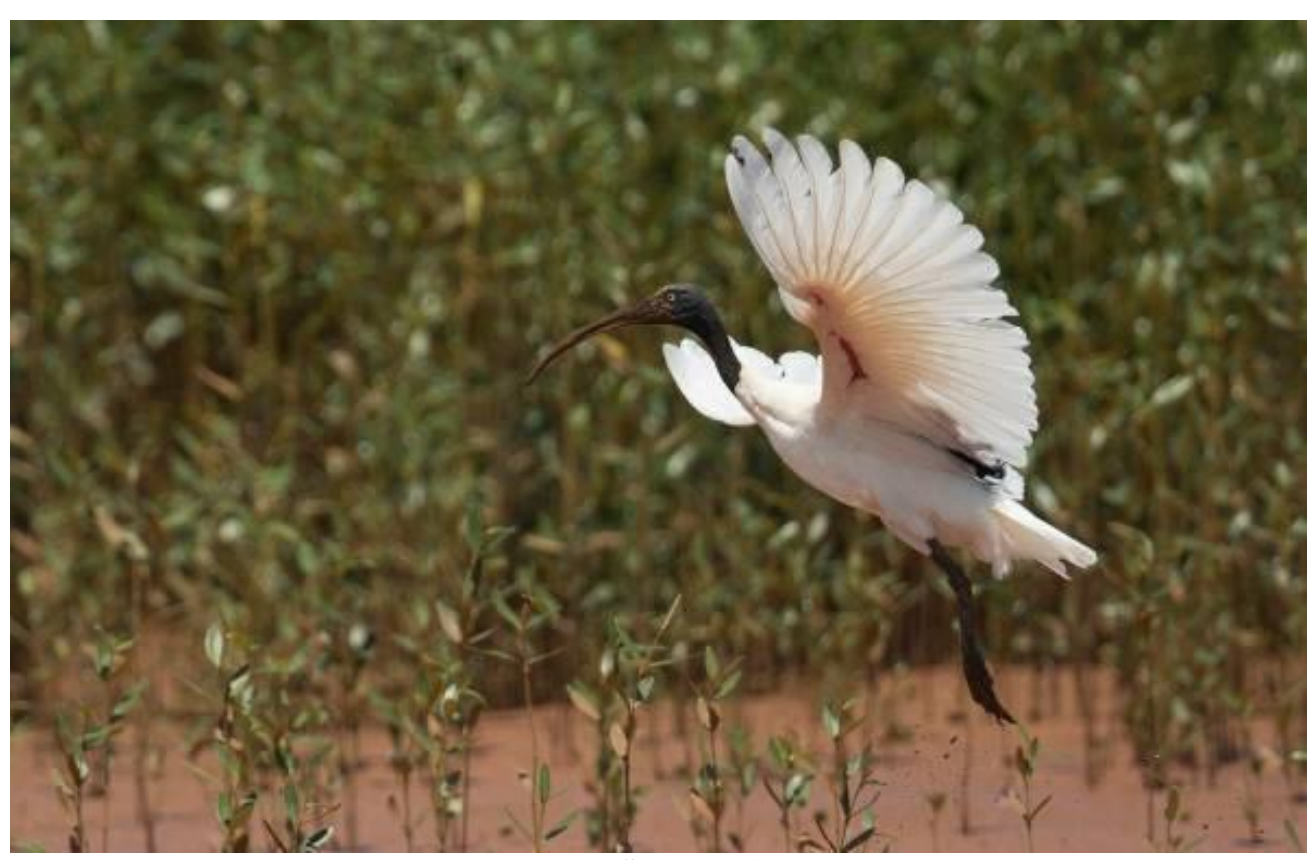
The Endangered (IUCN) Malagasy Sacred Ibis - Threskiornis bernieri

6 October - 5 November 2016 By Justin Nicolau