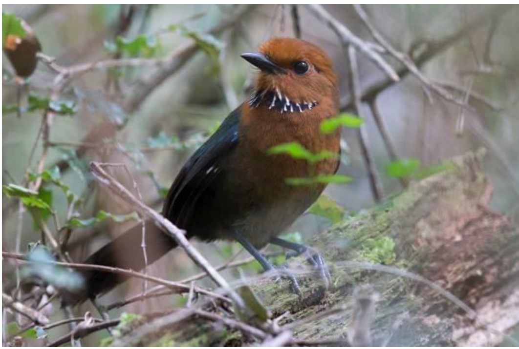
Rufous-headed Ground Roller - Atelornis crossleyi