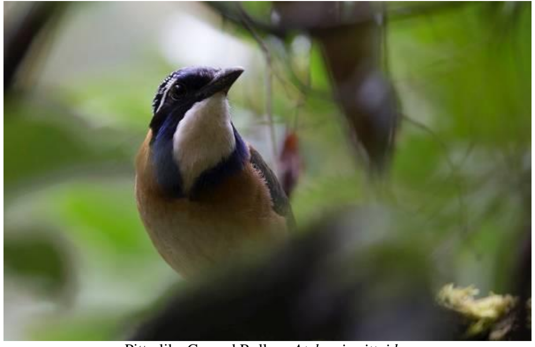
Pitta-like Ground Roller - Atelornis pittoides