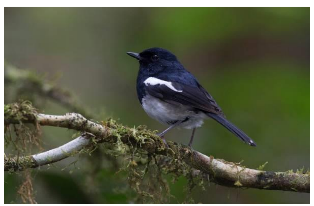
Madagascan Magpie-Robin - Copsychus albospecularis

After finally having arrived at Berenty Reserve, situated among the sisal plantations of the southwest, we picked up ring-tailed lemur and the famous dancing Verreaux's sifaka, which put on a wonderful cameo for us in late golden light. The walk itself added a beautiful jeweled chameleon, Giant Coua, Helmeted Guineafowl, White-browed Hawk-Owl, Malagasy Paradise Flycatcher, Crested Drongo, Madagascan Magpie-Robin, Crested Coua, Malagasy White-eye, Malagasy Turtle Dove, Malagasy Coucal, Frances's Sparrowhawk, and a really obscured view of Madagascan Cuckoo-Hawk sitting up high on top of its nest. White-footed sportive lemur eventually put in an appearance on the trip, and a night walk later in the evening yielded a few treats in the form of warty chameleon, more white-footed sportive lemur, grey-brown mouse lemur, and Madagascan Nightjar.