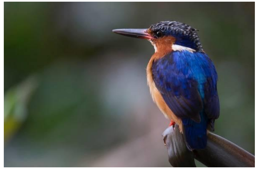
Malagasy Kingfisher - Corythornis vintsioides

After lunch back in the center of town we had a brief break before making our way to the local zoo. Here we had repeat views of many of the herons and egrets as well as Malagasy Kingfisher and an addition in the form of Malagasy Turtle Dove , while a variety of unique lemurs and birds were on show in the zoo grounds, including a small number of the interesting fossa.