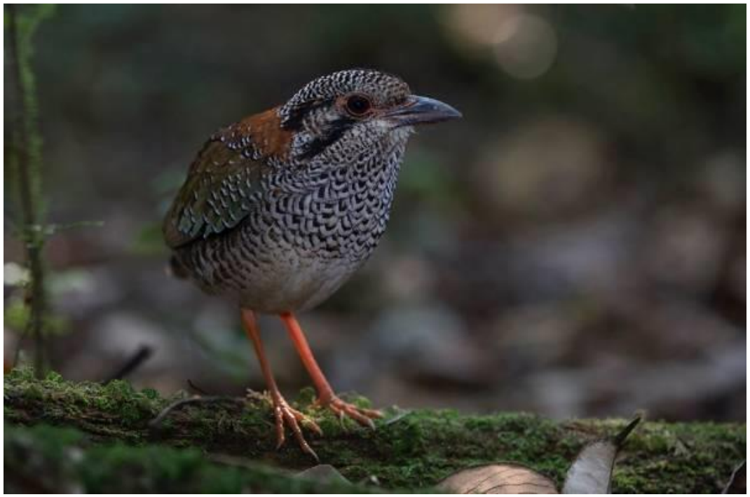
Scaly-ground Roller - Geobiastes squamiger

down near the canopy floor, their yellow eyes piercing through the forest as well as into our camera lenses. Dodging the humidity failed, and drenched to the bone we returned to camp to clean up and prepare for dinner.