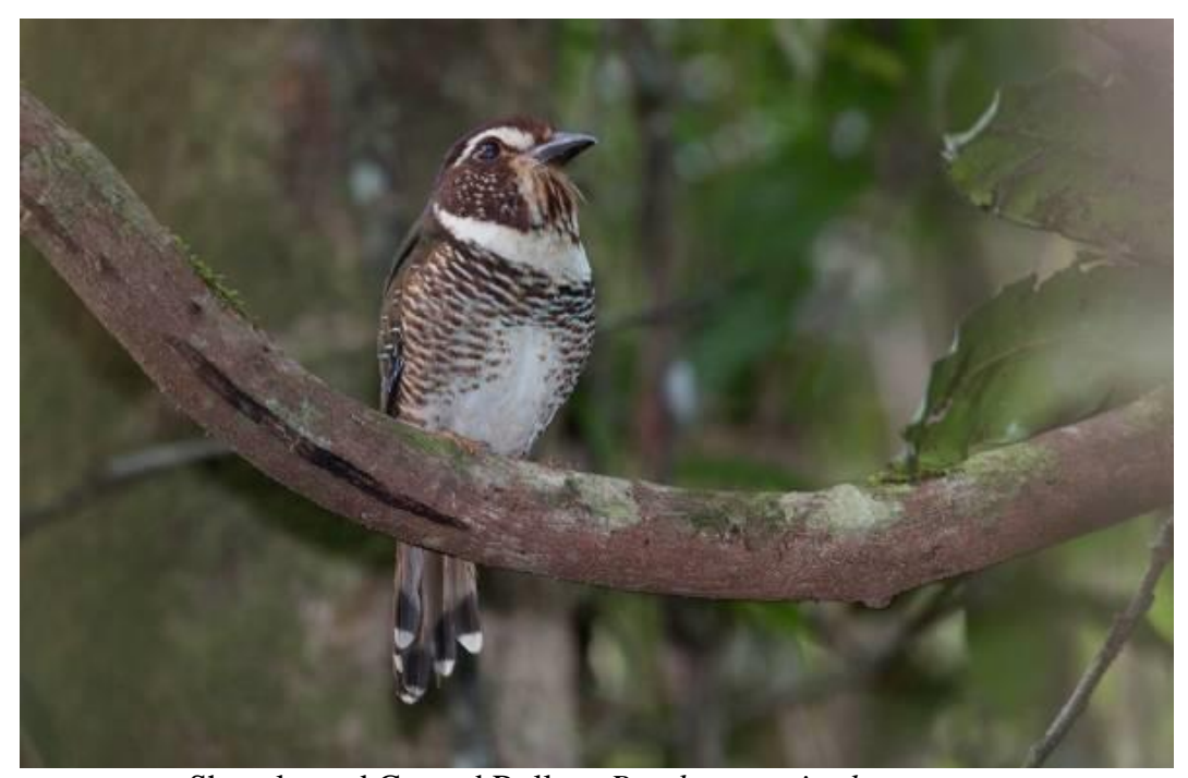
Short-legged Ground Roller - Brachypteracias leptosomus

A rescheduling of our flight, commonplace in Madagascar, meant a very early start to pick up our morning flight. Madagascan Nightjars bid us farewell in the car park as we headed to the airport. Mascarene Martins hawked over the airstrip before we commenced our flight to the northeast of the island. Madagascar's largest national park, Masoala, comprising 240 000 hectares of pristine rainforest, was our destination. Crossing to the peninsula proved a little tricky with large swells and occasional rain, but we made it to shore safely, with Common Tern, Grey Plover, and Whimbrel on the list. Malagasy Green Sunbird greeted us for lunch, while a brief afternoon walk to get the lay of the land rewarded us with Malagasy Paradise Flycatcher, Spectacled Tetraka on the nest, a trio of Madagascan Wood Rails feeding on the forest floor, Hook-billed Vanga collecting caterpillars, Lesser Vasa Parrot, African Palm Swift, a most-obliging Red-breasted Coua, and a pair of their Blue Coua cousins. Making our way back to watch the sunset on the beach we struck gold as a Shortlegged Ground Roller alerted us to its presence with an alarm call. It then proceeded to give us a lengthy view from all angles, while calling to a responsive second bird just down the stream. Dinner was had to the sound of crashing waves, with lined day geckos and fish-scale geckos adding to the ambiance.