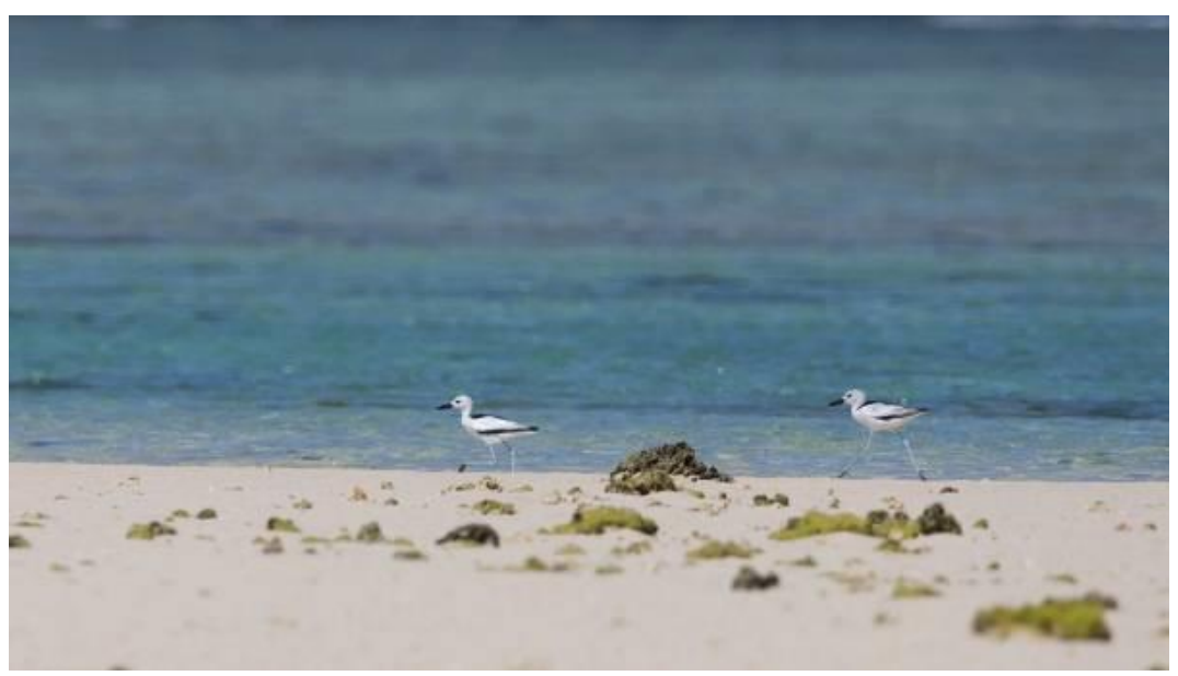
Crab-plover - Dromas ardeola

We then started the motor and headed back to the harbor, where we enjoyed an afternoon off due to both the heat and the success of the morning's birding.