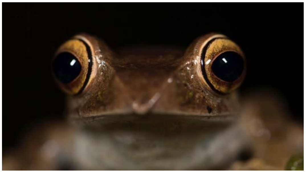
Madagascar bright-eyed frog - Boophis madagascariensis