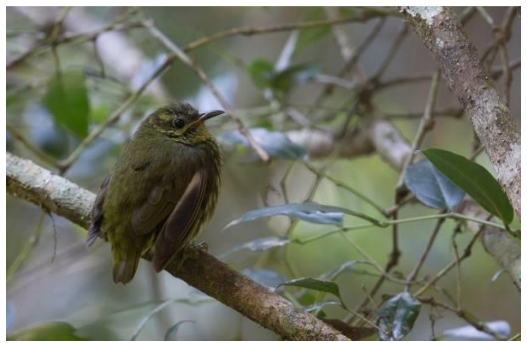
Velvet Asity - Philepitta castanea

We then settled down for lunch at a small lake, which produced great views of Stripe-throated Jery, Madagascan Buzzard, Malagasy Starling, Madagascan Blue Pigeon, Madagascan Spinetail, Madagascan Stonechat, Madagascan Wagtail, Common Moorhen, a pair of Meller's Ducks, Madagascan Swamp Warbler, and a flock of the tiny Madagascan Mannikins, among others. Returning to our hotel we added Olive Bee-eater and heard a number of Madagascan Flufftails, with some of us getting brief views of the little skulkers.