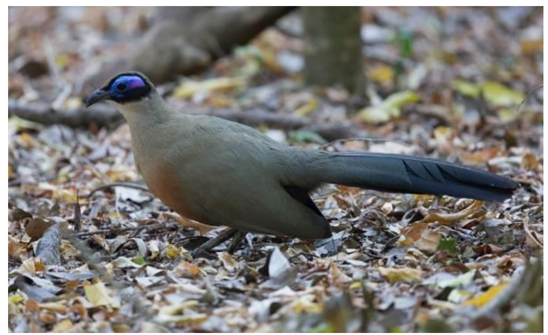
Giant Coua - Coua gigas

Bernieria, Souimanga Sunbird, Red-tailed Vanga, Coquerel's Coua, and many others put in an appearance, a highlight being a pair of the localized Appert's Tetraka, which performed well for us. Lunch produced a nosy trio of Giant Coua and a roosting White-browed Hawk-Owl, while the following drive to Ifaty added Black-winged Stilt and one powerful hailstorm.