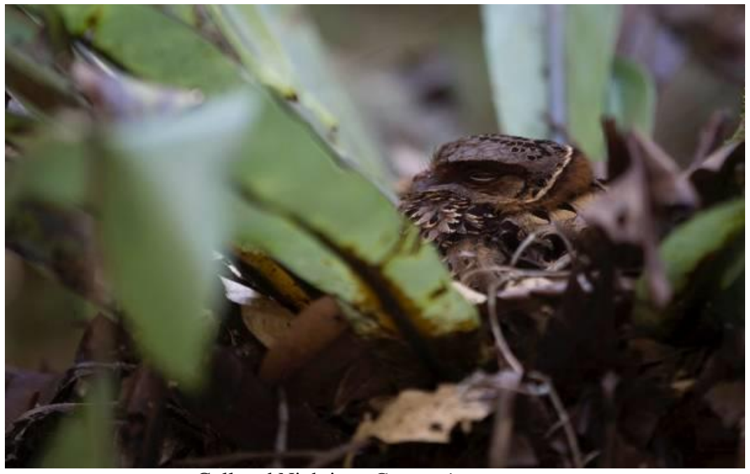
Collared Nightjar - Gactornis enarratus

A brief night walk turned up the diminutive nose-horned chameleon, Glaw's short-nosed chameleon, green bright-eyed frog, Geoffroy's dwarf lemur, and Goodman's mouse lemur, as well as a number of interesting arachnids and insects.