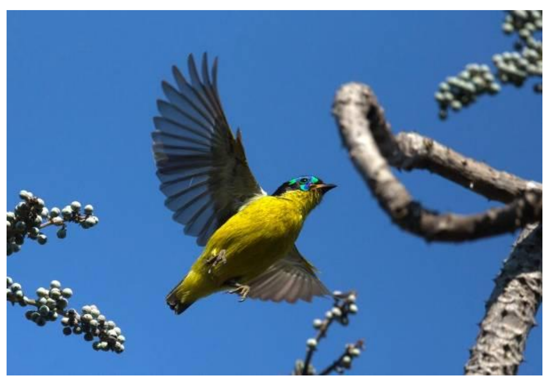
Schlegel's Asity - Philepitta schlegeli

Later in the afternoon a short boat trip around another lake had us enjoying Nile crocodile, Squacco Heron, Black-crowned Night Heron, Striated Heron, Western Cattle Egret, Dimorphic Egret, Three-banded Plover, Purple Heron, countless obliging Malagasy Kingfishers, a couple of Madagascan Green Pigeons, Malagasy Coucal, and a pair of the sought-after Madagascan Fish Eagles, which are resident on this body of water. Back in camp White-headed Vanga and Frances's Sparrowhawk gave us a show as well as Milne-Edwards's sportive lemur, mongoose lemur, and a half dozen Oustalet's chameleons in the evening.