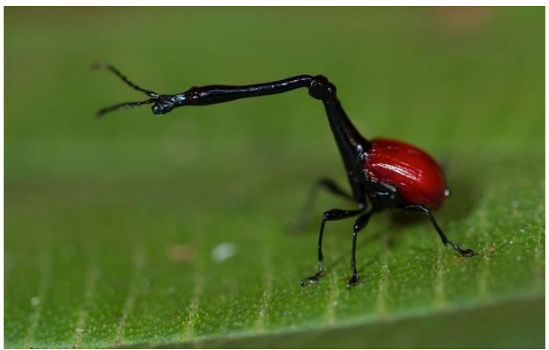
Giraffe weevil - Trachelophorus giraffa