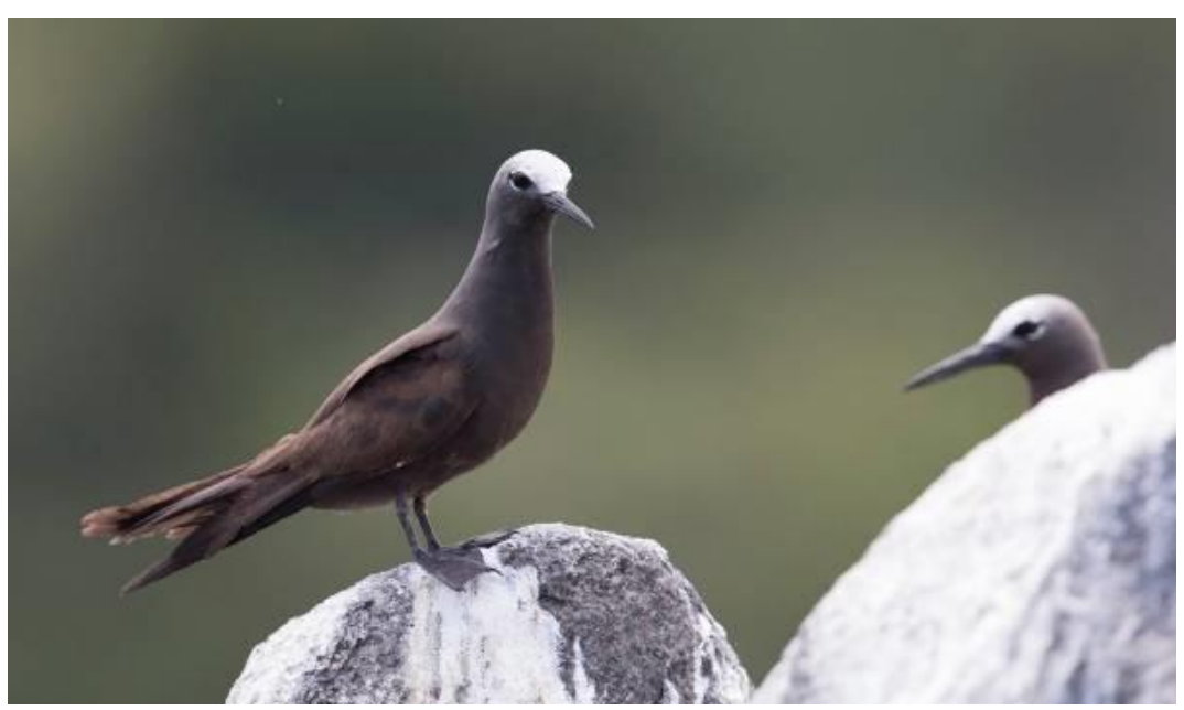
Lesser Noddy - Anous tenuirostris