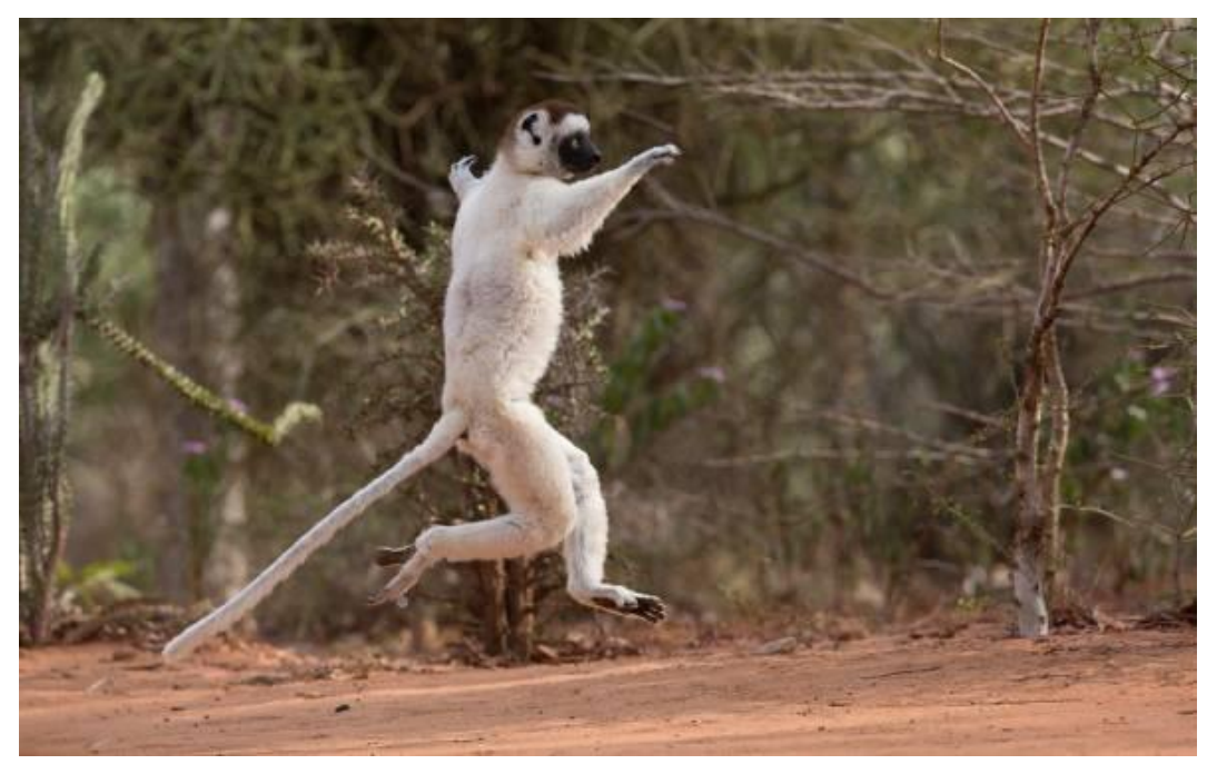
Verreaux's sifaka - Propithecus verreauxi

In the afternoon a sortie into the sisal fields took place, where we after some time connected with a pair of fine-looking Madagascan Sandgrouse as well as a handful of Madagascan Buttonquails , two of our main targets. Running Coua and flocks of Grey-headed Lovebird also entertained. A night walk produced a trio of warty chameleons and a brilliant Madagascan tree boa hunting up in the canopy.