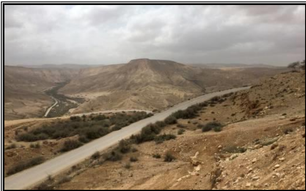
The Sde Boker area showing the incredible landscapes that are temporary homes and feeding grounds for many migrating birds!