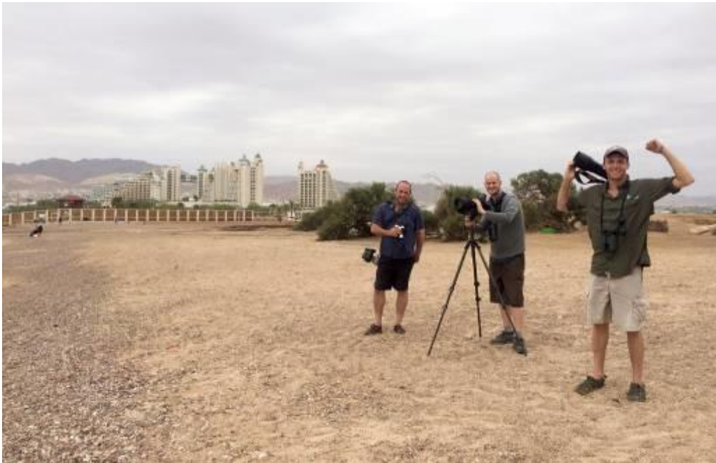
The Bandits doing some sea watching at North Beach with the city of Eilat in the background

Some of the other species that we recorded during the scouting days included the likes of Brown Booby, White-eyed Gull, Sandwich Tern, and Baltic Gull ( L. f. fuscus , nominate Lesser Black-backed Gull, which are all treated as separate species for the COTF) all at North Beach. It was also incredible to see “migration in action” even among passerines, such as a Yellow Wagtail coming in off the Red Sea while we were sea watching!