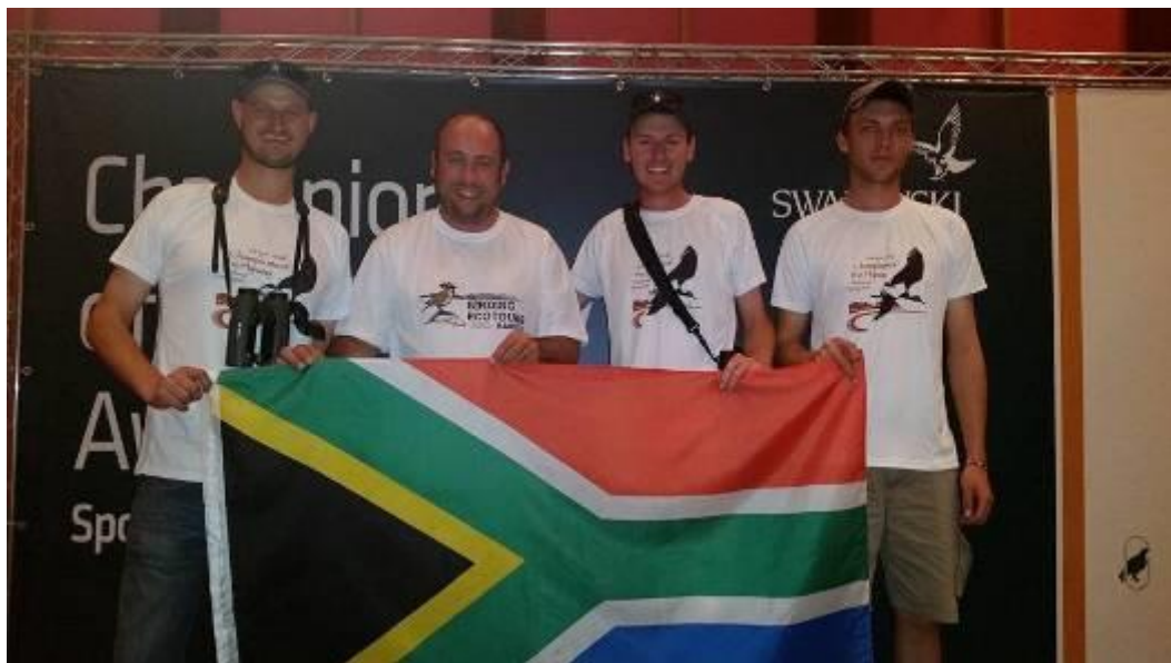
The Birding Ecotours Bandits also represented South Africa during the race! We finished with a total of 163 species for the day – a total that we can be proud of!

To our sponsors: “While we may not have been crowned with the award for the most money raised, you are ALL Guardians of the Flyway in our eyes! Thank you, thank you, thank you!” – Trevor