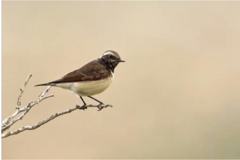
Female Cyprus Wheatear (Oenanthe cypriaca)