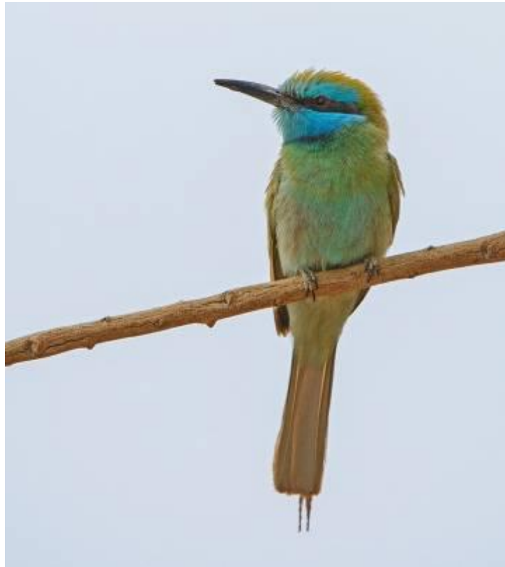
Little Green Bee-eater (Merops orientalis) was a species that we managed to miss in last year's race; this year we were relieved to find a few at the outskirts of Eilat!

Birding was good, and between the salt pans, the date plantations at K20, and some other waterbird spots we added most occurring shorebirds, including Curlew Sandpiper and Dunlin, Water Pipit, various waterfowl, Collared Flycatcher, Tree Pipit, our 4 th Eurasian Wryneck of the Day (!), Eurasian Sparrowhawk, Gull-billed Tern, Western Osprey, and Ferruginous Duck. Jason was in charge of making sure that we ran according to schedule, and, for the most part, we were pretty good at sticking to that plan. “C’m on lads, keep it up!” – these were the chants as we begun the long drive into the Negev!