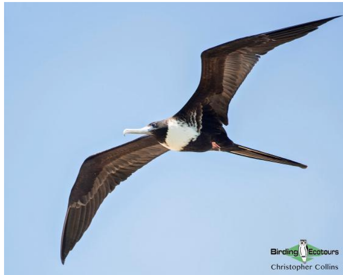
Magnificent Frigatebird female

Magnificent Frigatebird Fregata magnificens – First seen at Fort De Soto Park and then many seen in the Dry Tortugas, which harbors the only breeding colony of this species in the United States. Many hung in the breeze above Fort Jefferson.