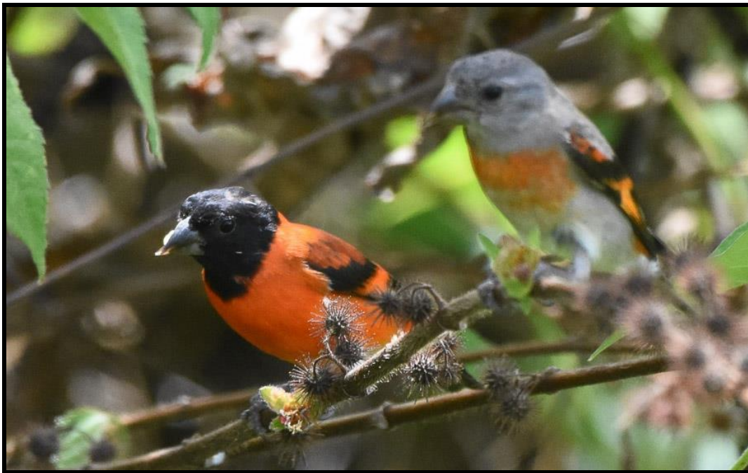
Red Siskin will be our target southeast of Lethem (John Christian).

Today we leave the lodge very early at 3:00 a.m. in our 4x4s to drive roughly 90 kilometers (56 miles) southeast of Lethem. The drive will take us about six hours depending on what we see along the way. The road is actually a traffic-less sand track meandering across the hilly savannas with many opportunities for spontaneous birdwatching stops. We can scan numerous wetland areas for Maguari Stork , Brazilian Teal , White-tailed Hawk , Double-striped Thick-knee , and Bearded Tachuri . Along the way we pass the Amerindian communities of St. Ignatius and Shulinab, where the traditional homes and lifestyles of Amerindian Guyana are on display and remind us just how far we've come. We will meet one of our local guides who has been studying the rare and localized Red Siskin, a bird only discovered in Guyana in 2000 and one of the holy grails of South American ornithology.