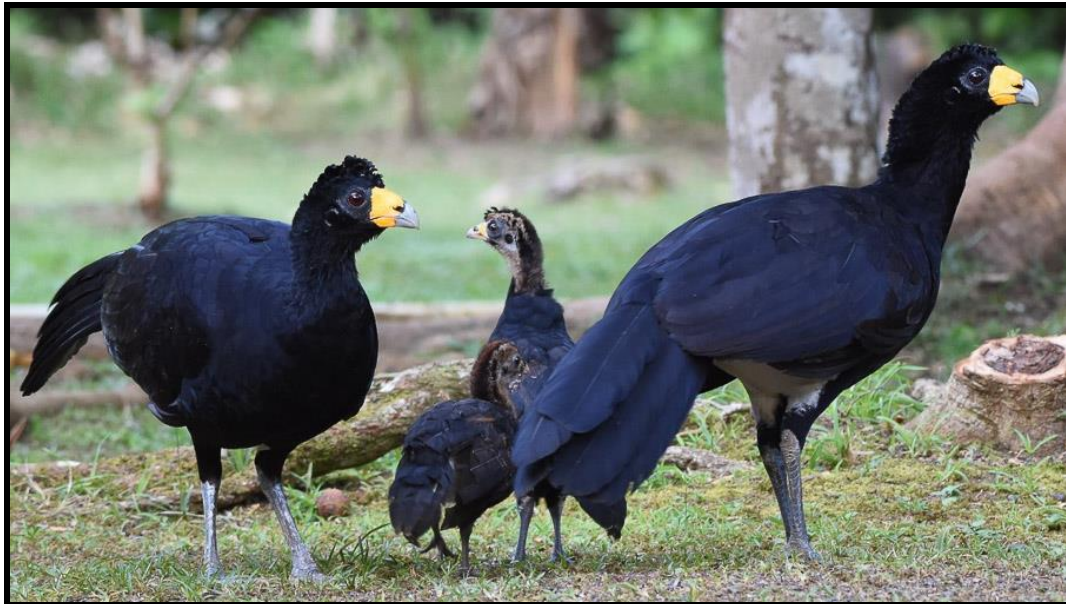
The distinctive Black Curassow will be searched for at Atta Rainforest Lodge (John Christian).

This relatively small country found in northeast South America has become a mandatory destination for adventurous birders as it includes many species that are hard to find in adjacent South American countries, such as Capuchinbird , Black Nunbird , Crimson Fruiterow , Blood-colored Woodpecker , Waved Woodpecker , Black Curassow , Crestless Curassow , Bearded Tachuri , Red-fan Parrot , and Rufous and White-winged Potoos . It also offers great chances for Harpy Eagle if there are active nests in the area; with the help of our Birding Ecotours leaders and local guides we will do the best to find this most-wanted bird. In addition Guyana offers a unique set of species called Guiana Shield specialists, including Guianan Toucanet , Guianan Trogon , Guianan Red Cotinga , Guianan Streaked Antwren , and Guianan Puffbird , and there are good chances for some forest species including White-plumed Antbird , Rufous-throated Antbird , and with luck Rufous-winged Ground Cuckoo .