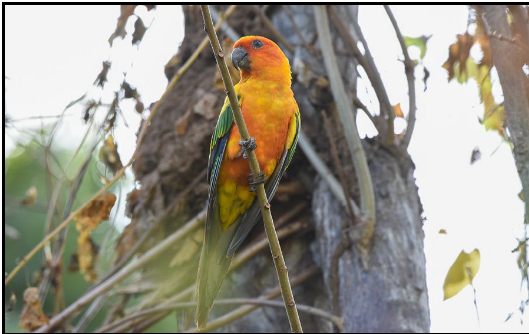
The beautiful and rare Sun Parakeet.