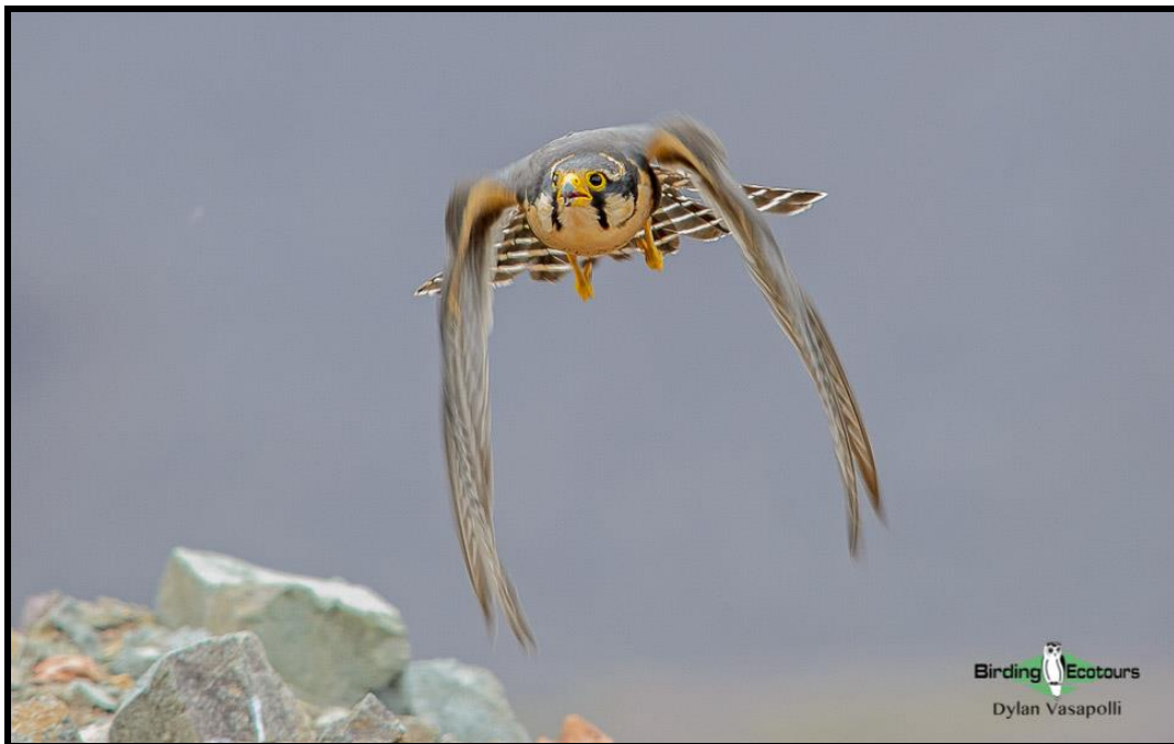
Aplomado Falcon can be seen across the North Rupununi Savannah.