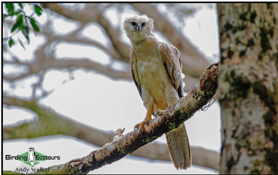
The magnificent Harpy Eagle will hopefully be seen around Surama Eco-Lodge.