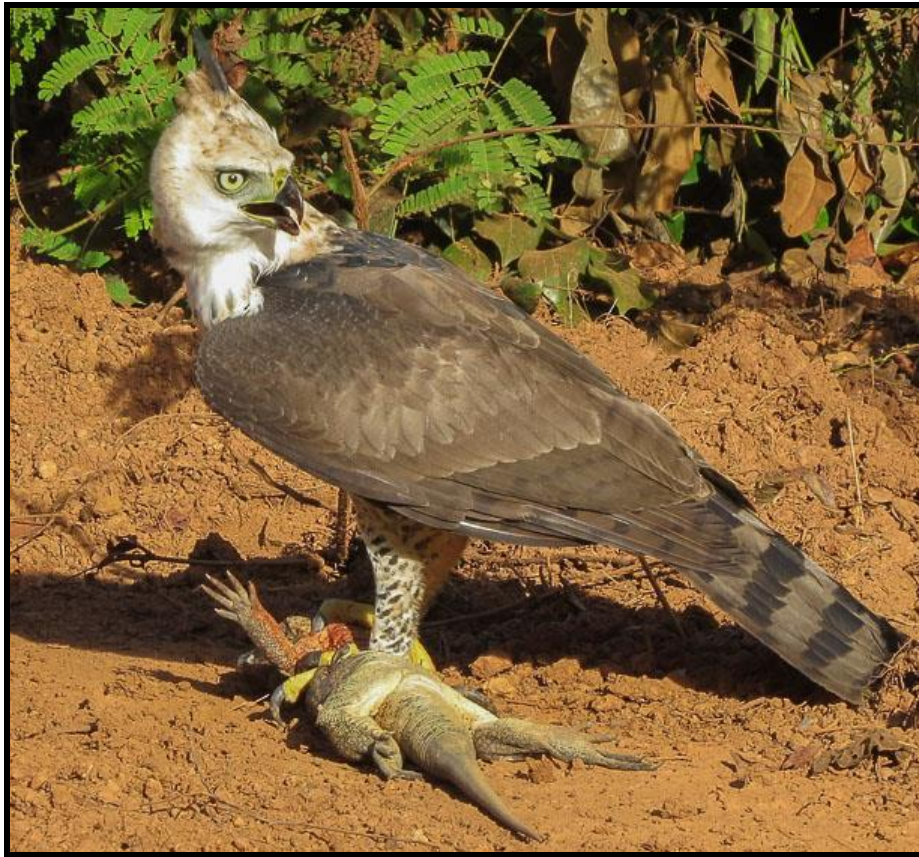
The area around Surama Eco-Lodge can be good for Ornate Hawk-Eagle (John Christian).

We'll have another early start to explore the environs of Atta Rainforest Lodge before breakfast for one last time. Our birding adventure continues with a transfer to Surama Eco-Lodge, birding on the way. We will scan treetops for Marail Guan, Green Aracari, Guianan Puffbird, Dusky Purpletuft, Black-spotted Barbet, Harpy Eagle, Crested Eagle, Ornate Hawk-Eagle, Black Hawk-Eagle, Golden-collared Woodpecker, Black-bellied Cuckoo, Green Oropendola, and Crimson Fruitcrow .