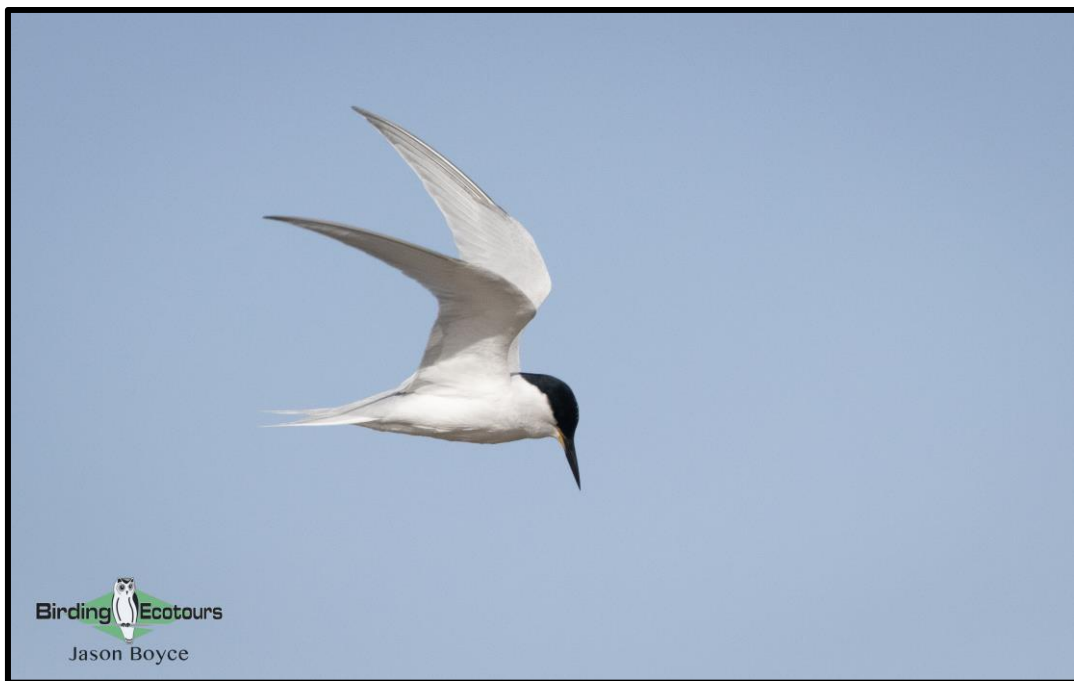
The diminutive west coast Damara Tern

The whole group was booked on a Walvis Bay Lagoon cruise. The trip is really good for Dolphin species such as Bottlenose and Heaviside's Dolphins – unfortunately today we only recorded Common Bottlenose Dolphin and missed the rarer Heaviside's Dolphin. But we did record a few excellent bird species in the form of African Penguin , Cape Gannet , Sooty Shearwater , Parasitic Jaeger , and both Black and Damara Terns . The seal colony on Pelican Point is seriously impressive and holds up to 60 000 Cape Fur Seals during the breeding season. We were also visited by two separate Cape Fur Seals on the boat, which enjoyed being on the Catamaran as much as we did and certainly enjoyed the raw fish they were being fed, as much as we enjoyed a few oysters and sparkling wine! After a successful morning out in the bay we headed south to the salt works lagoon roads for some shorebirds and were certainly rewarded; we saw excellent numbers of Chestnut-banded and White-fronted Plovers , both Whimbrel and Eurasian Curlew , and thousands of Curlew Sandpipers . Common Ringed Plover was found in low numbers, and a few Ruddy Turnstones and Sanderlings were also around.