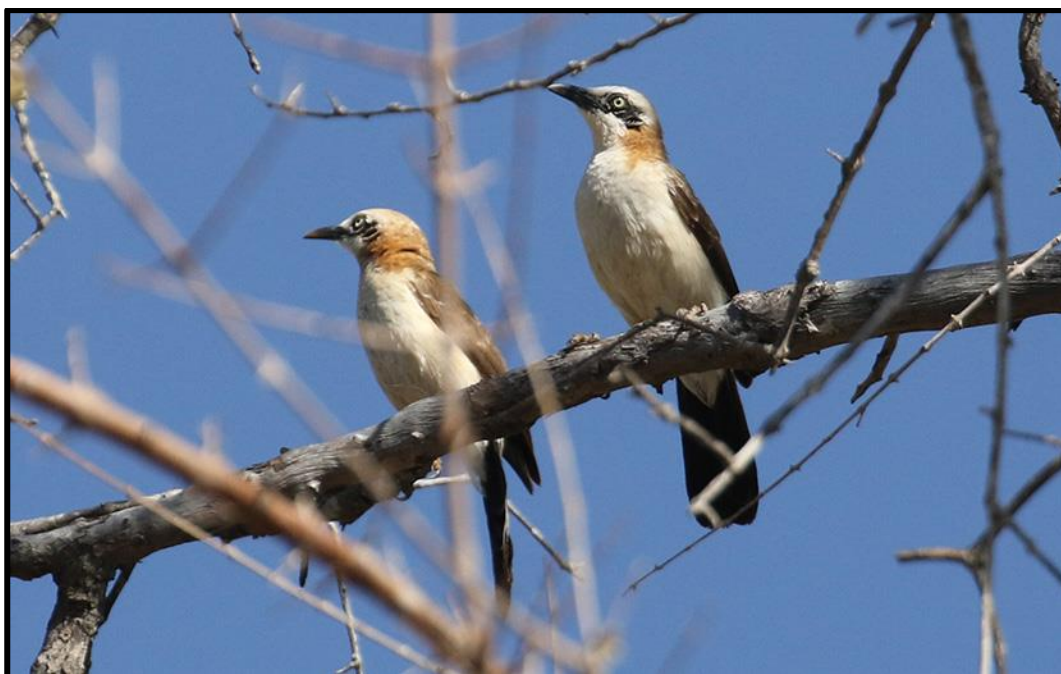
One of the most striking members of the African babbler family, Bare-cheeked Babbler

Once we arrived at the banks of the Kunene River the resident Rufous-tailed Palm Thrush really wanted to be seen and showed incredibly well for an extended period of time. Other birds along the Kunene River were; Meves's Starling , Red-necked Spurfowl , Yellow-bellied Greenbul , and Holub's Golden Weaver . A European Honey Buzzard was also a pretty good sighting, a species that is considered a scarcity in Southern Africa but seems to have become a little more common in recent years.