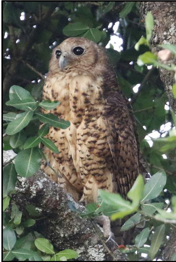
Surely one of the greatest species to connect with in our subregion, the magnificent Pel's Fishing Owl

Martin , and a few Black Herons . We had worked hard the whole day in order to find a roosting Pel's Fishing Owl , and finally, our luck turned. We walked along a patch of woodland alongside the channel, and our brilliant local guide and skipper came back saying that he had spotted one. We spent a good twenty minutes observing this beauty in the setting sunlight.