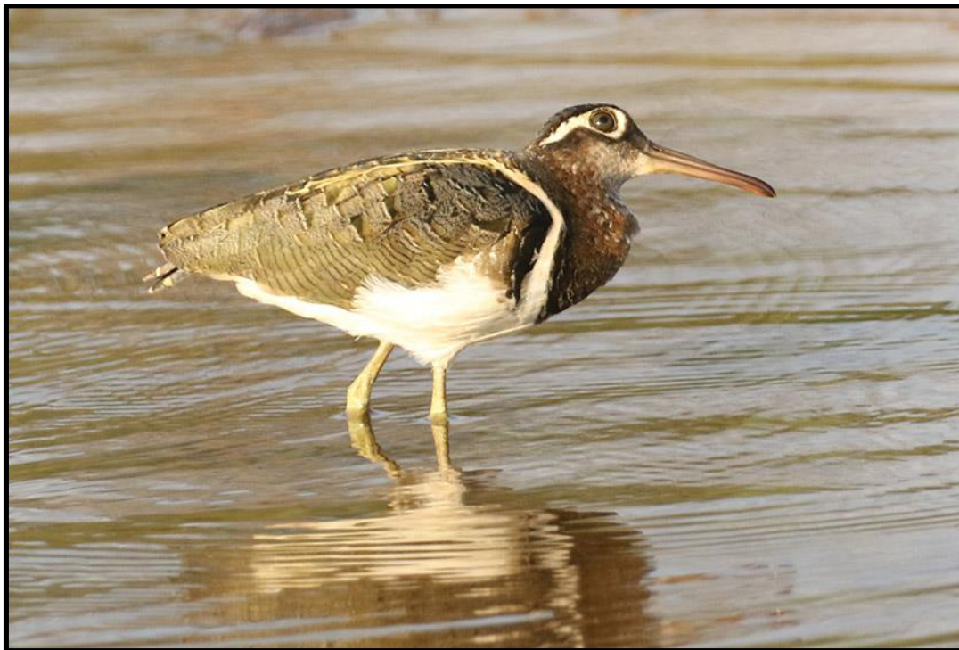
Greater Painted-snipe, one of only three members in its family

We kicked off our day today with a short walk from the grounds of our lodge. The banks of the Kavango River certainly delivered some nice sightings, Great Egret , African Wattled and White-crowned Lapwings , Rock and Collared Pratincoles , and Black Crake . We walked to one of the dry floodplains near the lodge, where we picked up Lilac-breasted Roller , Zitting Cisticola , Magpie Shrike , and White-browed Scrub Robin . Then we started our drive toward Zambia and Victoria Falls. We were staying in Katima Mulilo, Namibia, tonight, which is situated on the border with Zambia on the Zambezi River. We arrived at our lodge and immediately found Swamp Boubou , Schalow's Turaco , and a roosting African Wood Owl . Our lodge had organized an afternoon boat trip for us, which certainly didn't disappoint. Our first incredible sight from the boat was a pair of Greater Painted-snipes , a species in the shorebird group but one that does not usually wade out in the open such as sandpipers and stilts.