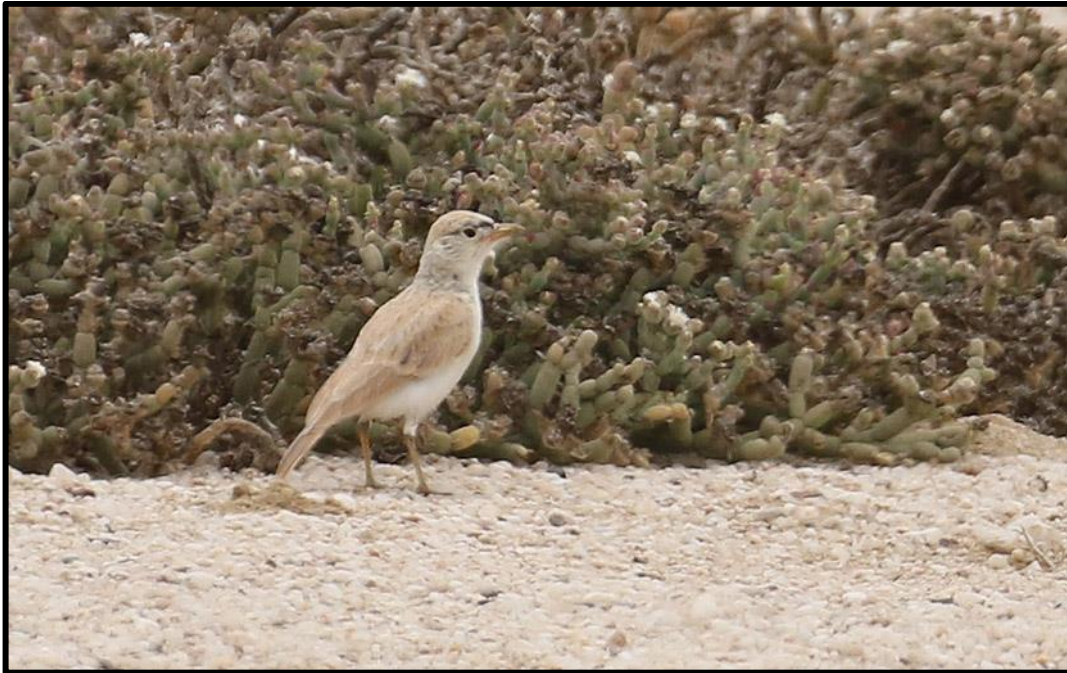
One of the species that gave our group the runaround before we finally managed to find a group of about six birds, Gray's Lark

we added African Oystercatcher and Crowned Cormorant between hundreds of cormorants, pelicans, gulls, and flamingos. This was a very enjoyable and successful day's birding.