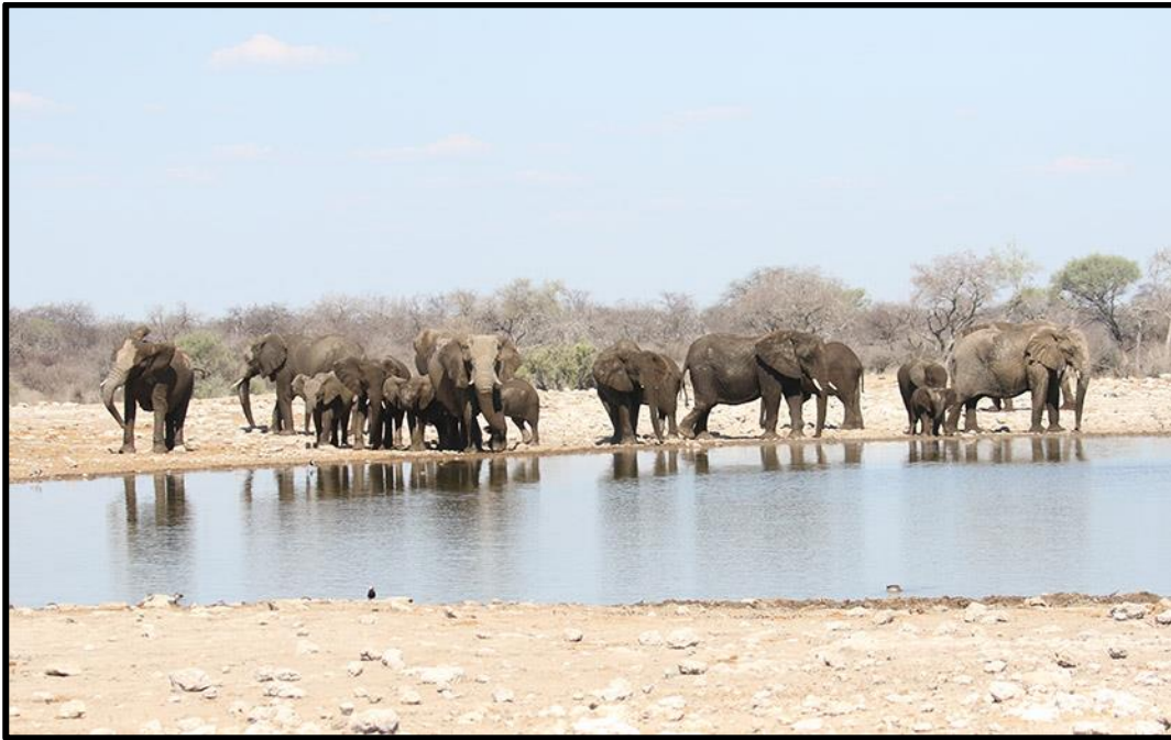
A typical sight at an Etosha waterhole. We had many brilliant sightings of African Elephant during our time in Etosha.

On our final morning in the park we had another open safari vehicle to ourselves. It was a beautiful cool morning in Etosha, which was a welcome change from the last couple of days. One of the main camps in Etosha National Park is Okaukuejo, which has a perfectly-located waterhole to watch animals and birds coming to drink. We spent some time here in the afternoon and had some nice visuals of Sociable Weaver , Acacia Pied Barbet , Black-headed Heron , Namaqua Dove , African Cuckoo , and Greater Striped Swallow . The waterhole obviously boasts a good assortment of mammals too, so we enjoyed watching a large herd of African Elephants , Springbok , Black-faced Impala , Plains Zebra , Giraffe , Gemsbok , and Black-backed Jackal . Seeing a Bushveld Elephant Shrew at close range was a real novel sight too!