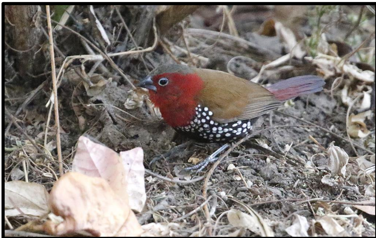
An unusual species to record on this tour: Red-throated Twinspot seen in Zambia near Livingstone