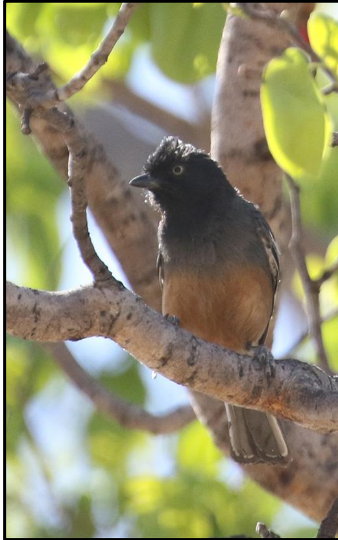
A true northern-Namibian special: Rufous-bellied Tit

Unanimously, today was one of the best days of our whole tour; personally I am still quite amazed at the sightings that we enjoyed today! We started things in the morning before breakfast with some birding around the lodge, and here we found White-fronted and Little Bee-eaters , Orange-breasted Bushshrike , Rufous-bellied Heron (a flyby), Chirping Cisticola , Little Bittern , Tawny-flanked Prinia , and African Stonechat . We found a few really productive spots with some flooded grassland, at which we picked up various waterfowl and shorebirds, including African Wattled and Long-toed Lapwings , Kittlitz's Plover , Ruff , African Snipe , and Common and Marsh Sandpipers , as well as Western Yellow Wagtail . An adult African Marsh Harrier drifted over our boat as we were traveling past large pods of Hippopotamuses and the occasional three-to-four-meter-long Nile Crocodile sunning itself on the bank.