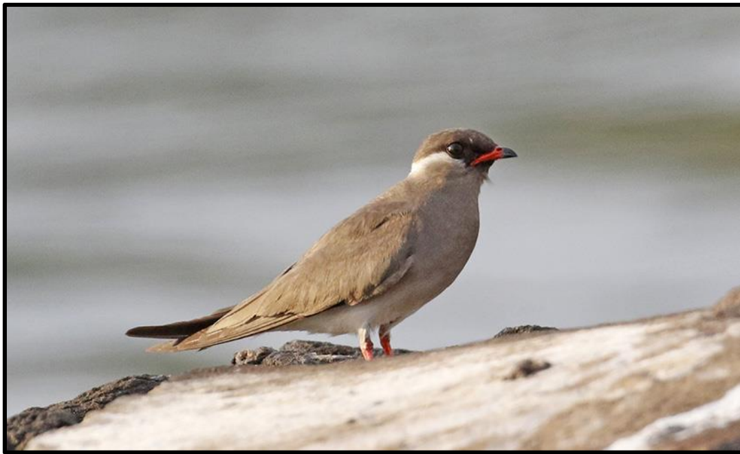
A really great sighting of Rock Pratincole – a few birds were sitting on the rocks in the middle of the Zambezi River.

This tour is one in which we really try to fit in as many boat cruises as possible; there is something very special about spending time on the water. We had reached that time of the trip where, sadly enough, we went on our last boat cruise. We once again had cracking, close-up visuals of Rock Pratincole and also encountered White-browed Coucal , Trumpeter Hornbill , Brown-hooded Kingfisher , a single Sand Martin , and later in the afternoon a Common Cuckoo .