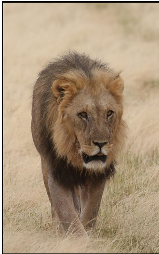
This large male Lion gave great views in Etosha National Park.

We headed back north for the Andoni Plains, where we had an awesome, close encounter with a male Lion ! We almost drove past this amazing animal, but luckily some of the group spotted it out the right side of the vehicle, only about fifteen meters from us. The highlights in the Andoni grasslands and surrounding thorny woodlands were Kori Bustard , Red-crested Korhaan , Northern Black Korhaan , Tawny Eagle , Pale Chanting Goshawk , Red-necked Falcon , European Bee-eater , Eastern Clapper Lark , Pink-billed Lark , Ant-eating Chat , Marabou Stork . and another great sighting of Blue Cranes .