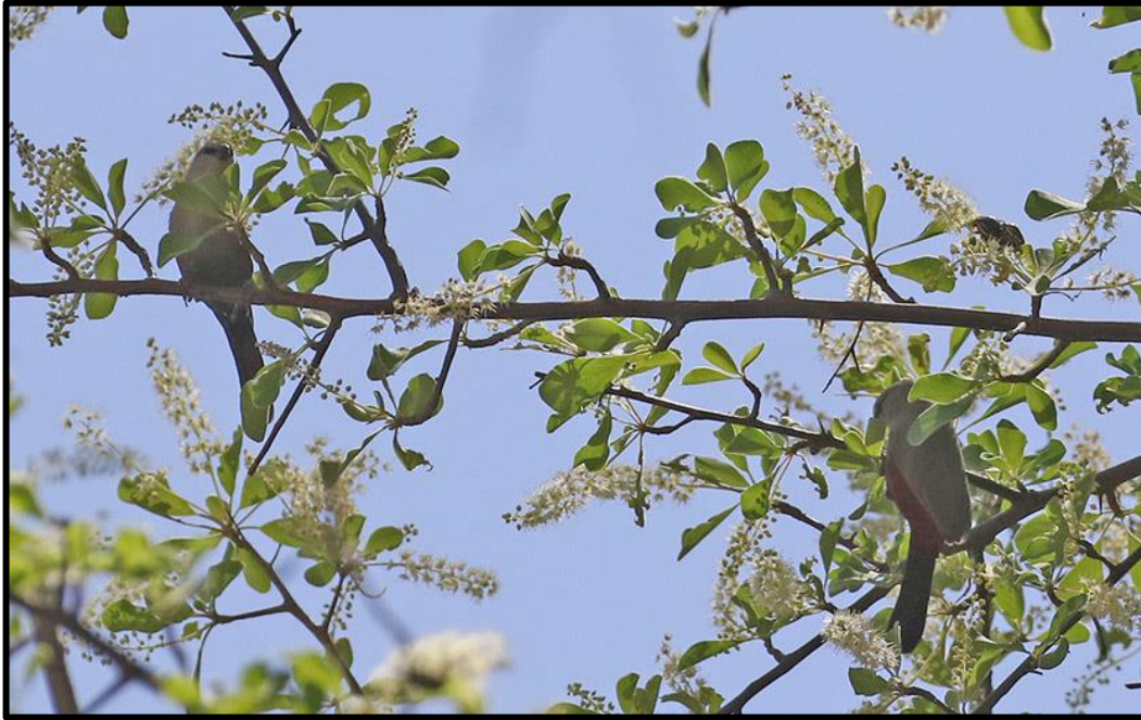
Our “princesses”, the Cinderella Waxbills, finally showed after waiting a good couple of hours at the site.

a good while. We had great looks at a brilliant and range-restricted species. The afternoon was really hot, and most birds were finding some shade; we did, however, find Cardinal Woodpecker , calls of Grey-headed Kingfisher echoed across the river from Angola, Rosy-faced Lovebird showed nicely, and Olive Bee-eaters were surprisingly active. A brilliant sundowner boat cruise along the river was enjoyable with Golden-tailed Woodpecker , Common Greenshank , Little Egret , and Water Thick-knee all in attendance. After the boat ride we also decided to find some shade and eventually headed back to the lodge for another hearty meal overlooking Angola. Then we started our preparations for the magnificent Etosha National Park.