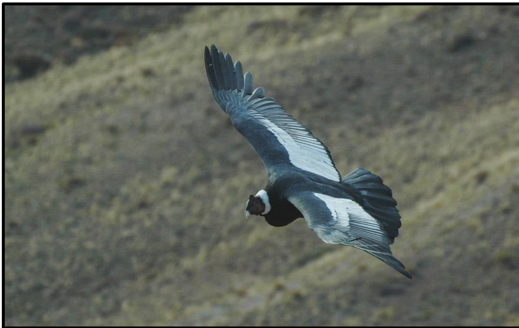
Andean Condor is an iconic bird of the high Andes.