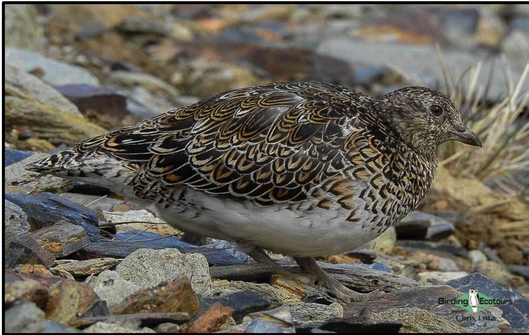
White-bellied Seedsnipe can be seen on the Garibaldi Pass.

This short tour of Tierra del Fuego gives you the opportunity to explore southern Patagonia and the Tierra del Fuego National Park from the world's most southerly city, Ushuaia. Apart from the sheer beauty of the area, including snow-capped peaks, mountain streams, and large beech forests, there is an assortment of important bird species which will be targeted. High on this list will be the huge Magellanic Woodpecker , which inhabits beech forests in Tierra del Fuego National Park, as well as White-bellied Seedsnipe , which is found above the tree line on a nearby mountain pass. Other range-restricted species which we hope to find include Flying Steamer Duck , Andean Goose , Yellow-bridled Finch , and Patagonian Sierra Finch .