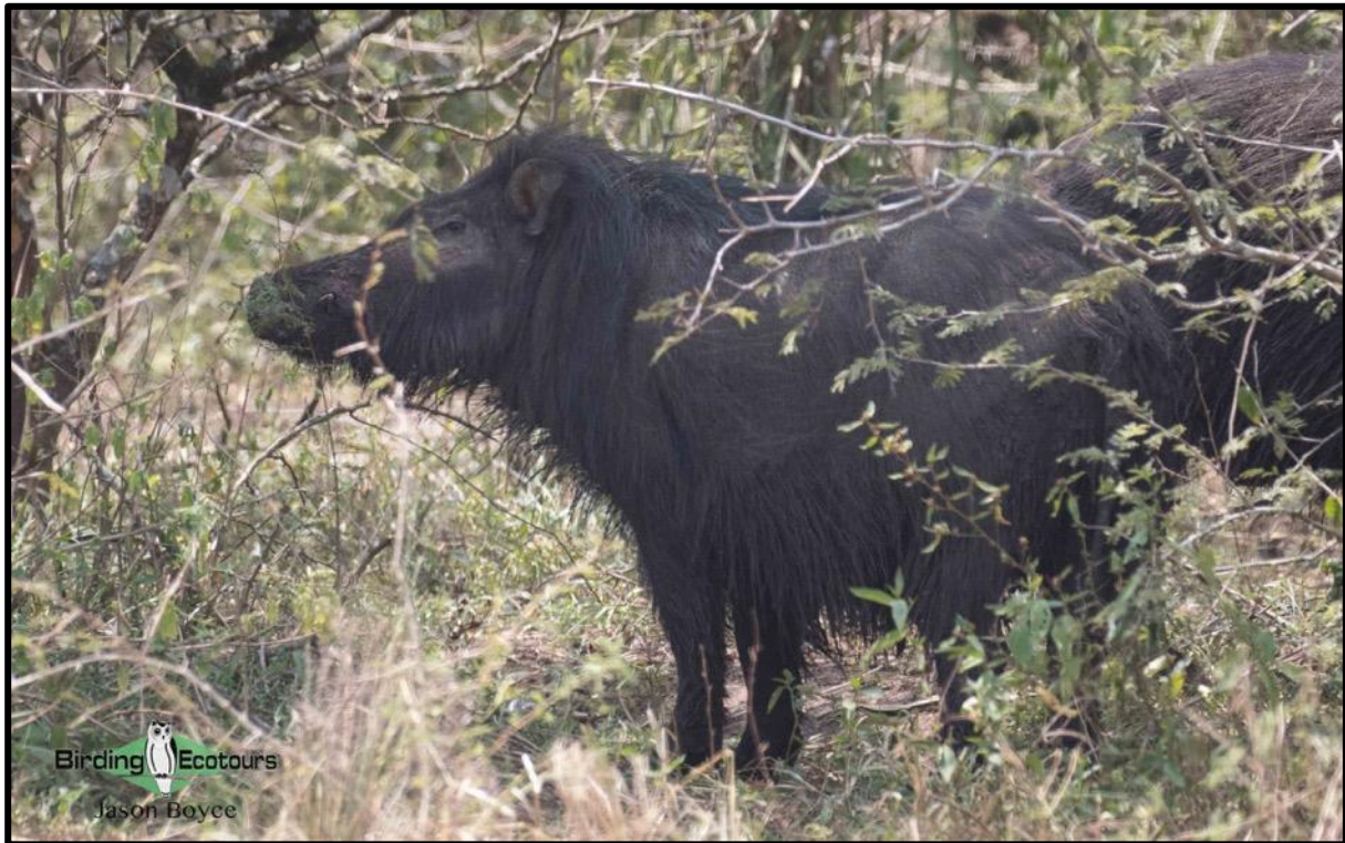
Forest Hog stole the show today on the mammal front.

eater, White-tailed Lark , Red-collared Widowbird , Croaking and Stout Cisticolas , and Crimson-rumped Waxbill . A little further north we added three new non-passerines; Goliath Heron , Brown Snake Eagle , and Black-bellied Bustard were all welcome additions to our day and trip lists. We spent a fair amount of time in some good areas this morning to try and locate the famous ‘tree-climbing’ lions, but unfortunately neither our fellow travelers nor we could locate these great animals. A couple of stops here and there en route to Mweya, where we would enjoy a boat cruise as well as spend the night, were productive. We picked up African Pygmy Kingfisher , Slender-billed and Black-headed Weavers , White-winged Tern , and Long-crested Eagle . A few kilometers from Mweya we were surprised with one of the sightings of the day – two giant Forest Hogs crossed the road in front of us and showed briefly before clambering into the thick bush.