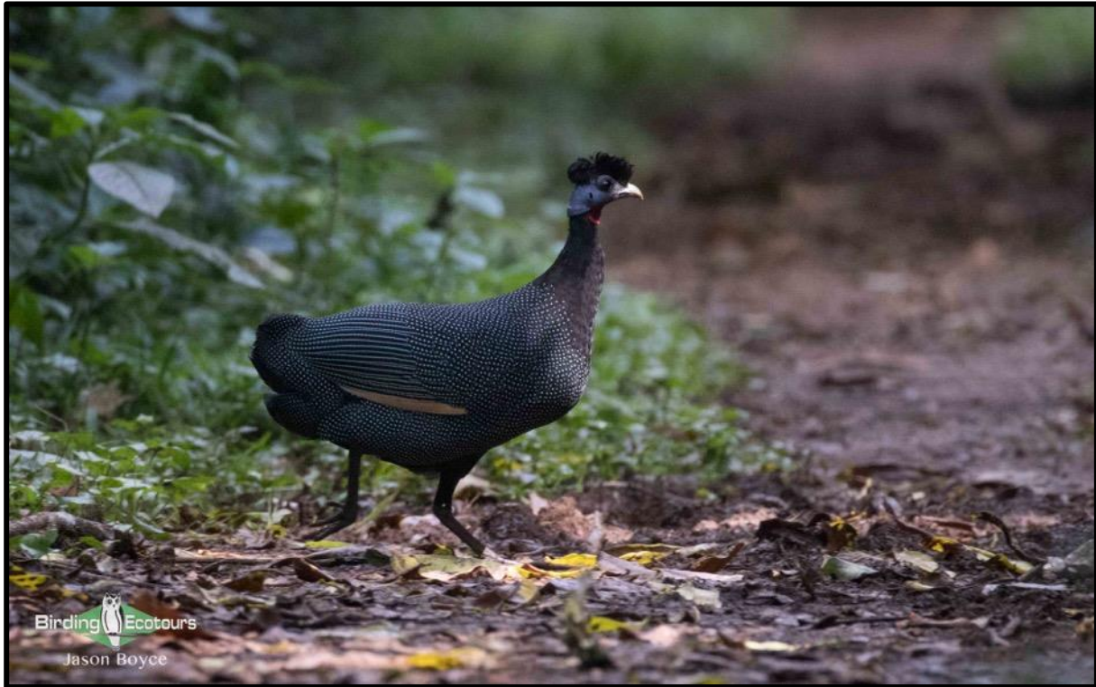
The punk-rocker-like Crested Guineafowl

day we were treated to sightings of troops of Red-tailed and L’Hoest’s Monkeys , both clambering through the dense foliage around us while we were walking.