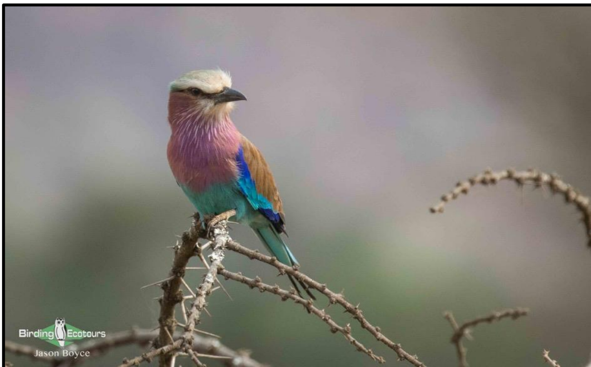
Lilac-breasted Roller, the rose among the thorns!

(Bushbabies) in a large acacia tree alongside the road. After connecting with a few more diurnal animals, including African Buffalo , our first mammal surprise was a single White-tailed Mongoose , a lesser-known, fairly large nocturnal mongoose that sauntered off into the darkness once it realized that we were onto it. We tried really hard to locate Swamp and Pennant-winged Nightjars but didn't manage to find them. We did see, however, a single Square-tailed Nightjar moving up and down in one of the acacia patches. Later that evening, on our way back to the main gate, the biggest surprise (perhaps of the whole trip) was finding an Aardvark ! Yes, an Aardvark – the large, terrestrial ant-eater-type mammal. Since this is a truly fascinating and rare animal to see anywhere in Africa, we were incredibly fortunate.