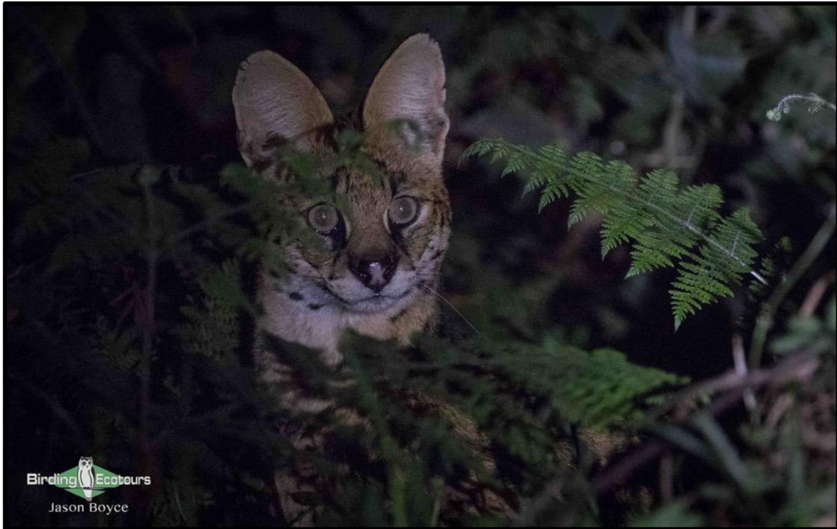
A truly wonderful sighting of Serval on our Ruhija night drive