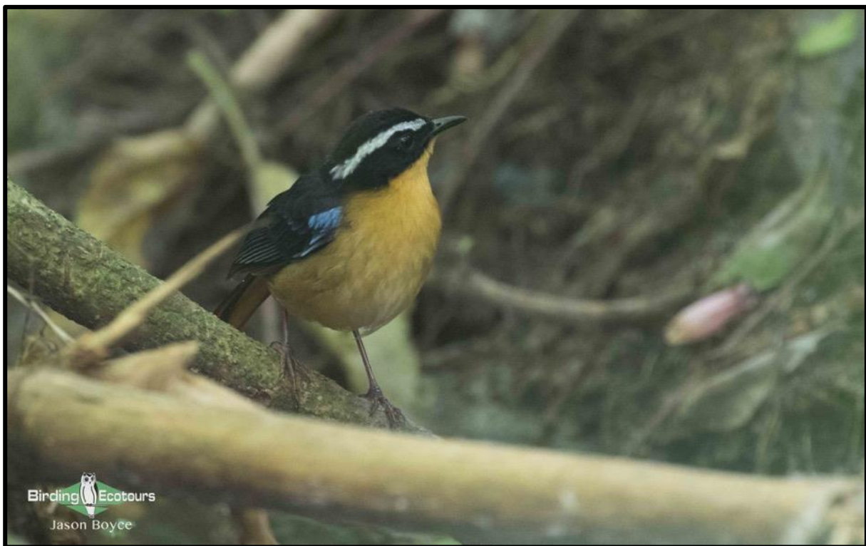
One of the most difficult Robin-Chat species I have ever worked for, Blue-shouldered Robin-Chat .

We left Buhoma early this morning so that we could get into the Ishasha sector of Queen Elizabeth National Park with some morning birding time remaining. Bird activity was high here, and in the first hour we spent there we had already accumulated an impressive list. The new savanna species included White-headed Vulture , Senegal Lapwing , White-throated Bee-