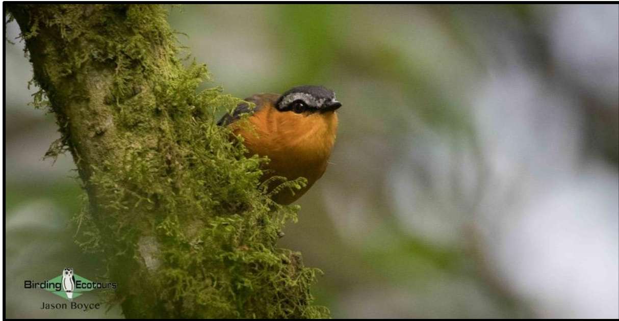
Grey-winged Robin-Chat peering at us from within the dark foliage