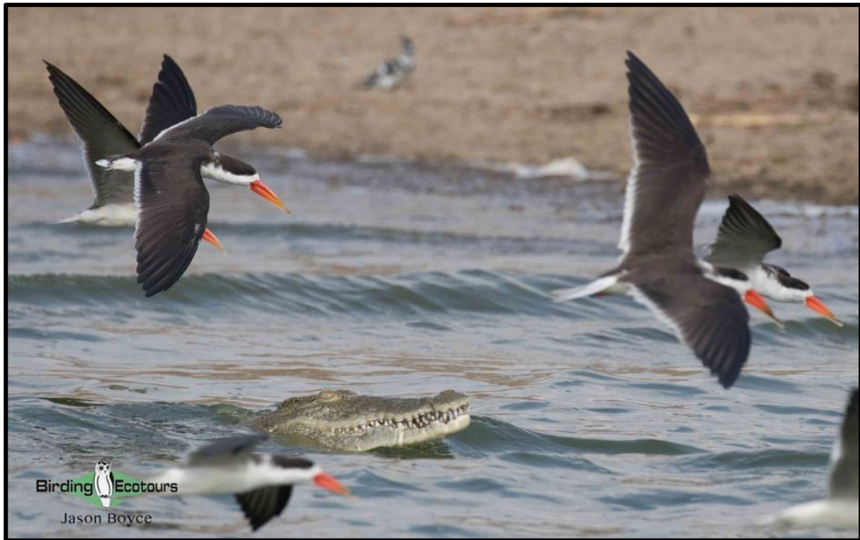
African Skimmers being photo-bombed by a Nile Crocodile

Today we transferred from Queen Elizabeth National Park to the world-famous (mainly for Eastern Chimpanzee ) Kibale National Park. We did, however, make sure to use the early morning to do some more birding in the northern section of Queen Elizabeth National Park. We had a good morning here and picked up a few tricky species. In the grassy plains of the savanna, much of it having had recently burned, Plain-backed Pipit and White-tailed and Rufous-naped Larks were all around in small numbers, while African Pipit was common. One of the sightings of the morning was seeing several different Collared Pratincoles spread across the open plains. A relative of the pratincole, Temminck's Courser , was harder to come by, but we did eventually find a single bird moving around inconspicuously. The good birds kept coming, and other crackers were Common Buttonquail and an awesome Ayres's Hawk-Eagle . A few Black-winged Stilts and some very distant Greater Flamingos were also in the area.