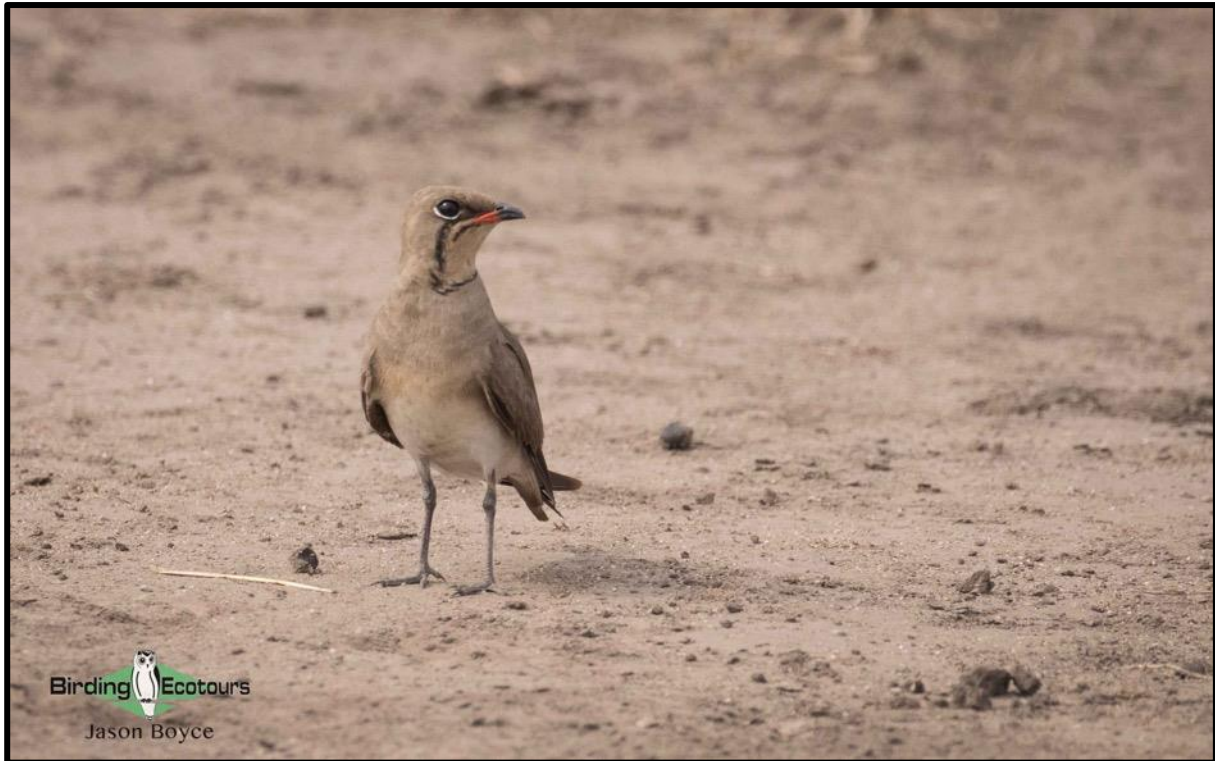
One of my personal favorite species – Collared Pratincole