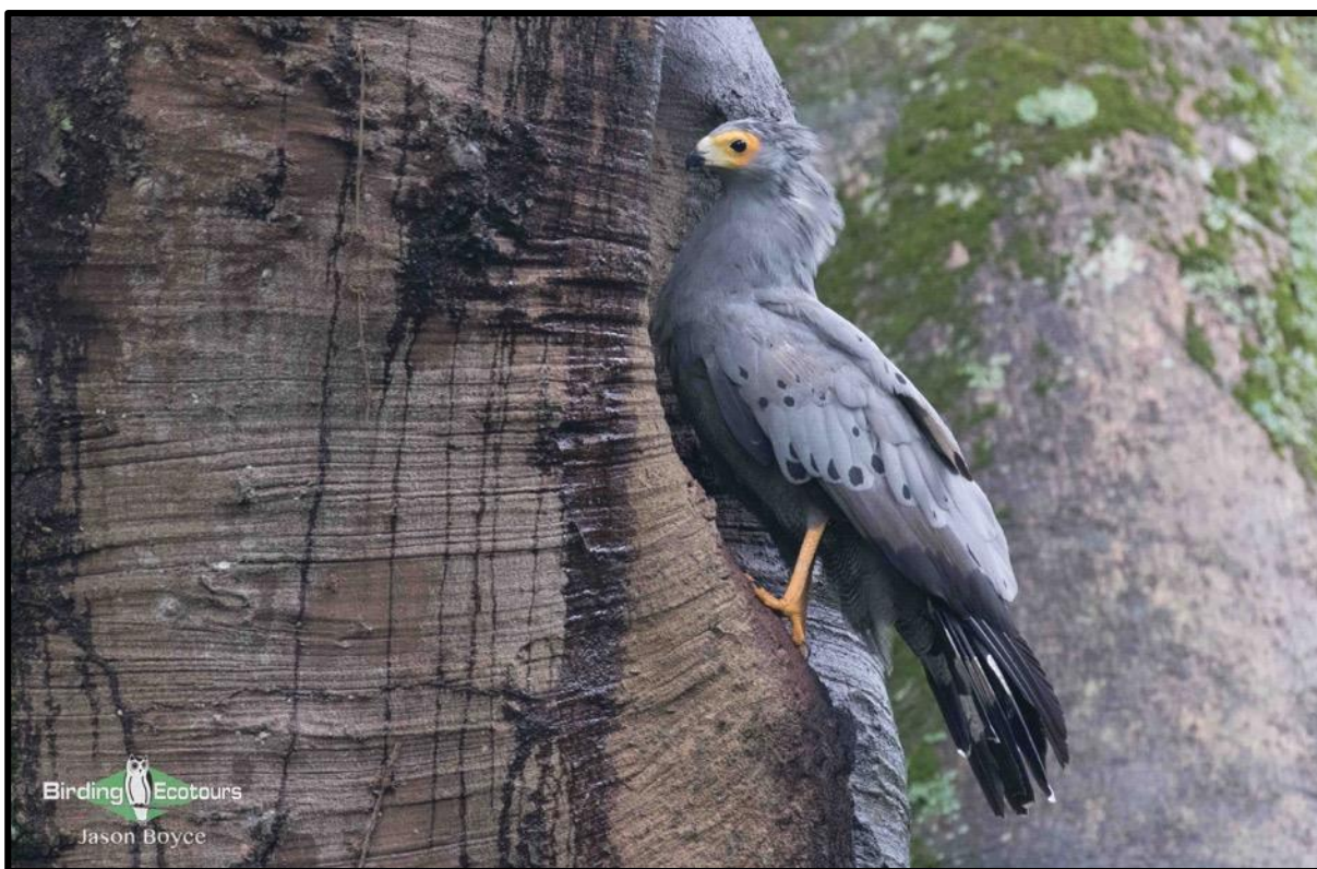
One of ten raptor species we encountered in the first day and a half; African Harrier-Hawk

Despite some unfavorable weather, including quite a bit of rain, the Entebbe Botanical Gardens really did put on a great show for us. The gardens are a great introduction to birding in Uganda and hold a good number of representatives of many of the bird families we would see over the next two weeks. Woodland Kingfisher was one of our first sightings here – a dapper kingfisher with a very distinctive trilling call. Shouts of, “raptor” echoed through the group, and much to my surprise we had an awesome flyby of a Bat Hawk , definitely one of the highlights of the morning. Other highlights during the morning included Orange and Golden-backed Weavers , Black-and-white-casqued Hornbill , Great Blue and Ross's Turacos , Grey Parrot , Grey Kestrel , Palm-nut and Hooded Vultures , and a very confiding Grey-capped Warbler . The lakeside produced a number of enjoyable sightings over the course of the day. Grey-headed Gull and both Reed and White-breasted Cormorants were constantly moving up and down the shoreline, while Pied Kingfisher and Olive Bee-eater lined a few of the trees and bushes. A pair of African Wood Owls had been staked out by some of the local guides and we managed to get some good scope views. Other species that we spent some time watching today included Klaas's and African Emerald Cuckoos , African Harrier-Hawk , Brown-throated Wattle-eye , Green Crombec , Yellow-throated Longclaw , and Western Citril .