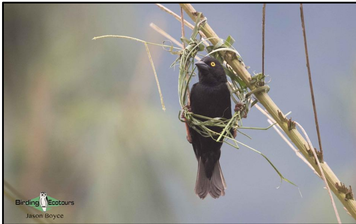
Vieillot's Black Weaver is pretty smart-looking, in my opinion.

Just like that, our 14-day Birding Ecotours Ugandan birding adventure had come to an end. Both the participant and I really enjoyed what Uganda had to offer us this year. We will certainly be back again next year, so do join us for that.