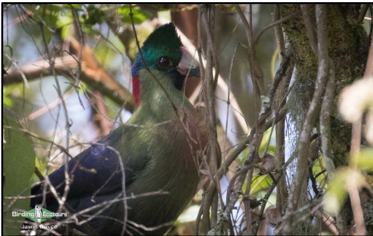
A very much sought-after species, the Rwenzori Turaco . We were lucky enough to see no less than six individuals during the day.