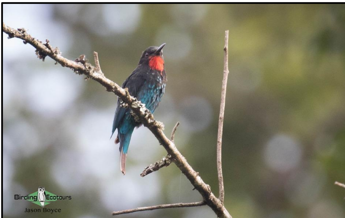
Black Bee-eater perched slightly lower than normal.

An afternoon birding session at the start of the Buhoma forest trail is always very productive. Here we did well to add Black-billed Weaver , three Bushshrike species comprising Lühder's , Many-colored , and Bocage's , Tambourine Dove , Pink-footed Puffback , and a close-up visual of both White-spotted Flufftail and Grey-winged Robin-Chat in the same binocular frame!