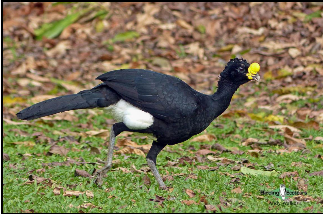
The attractive Great Curassow can be seen at La Selva Biological Station.

Overnight: La Quinta Sarapiquí Lodge, La Virgen