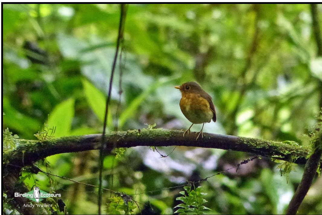
Ochre-breasted Antpitta can be seen at San Gerardo Biological Station.

Overnights: San Gerardo Biological Station