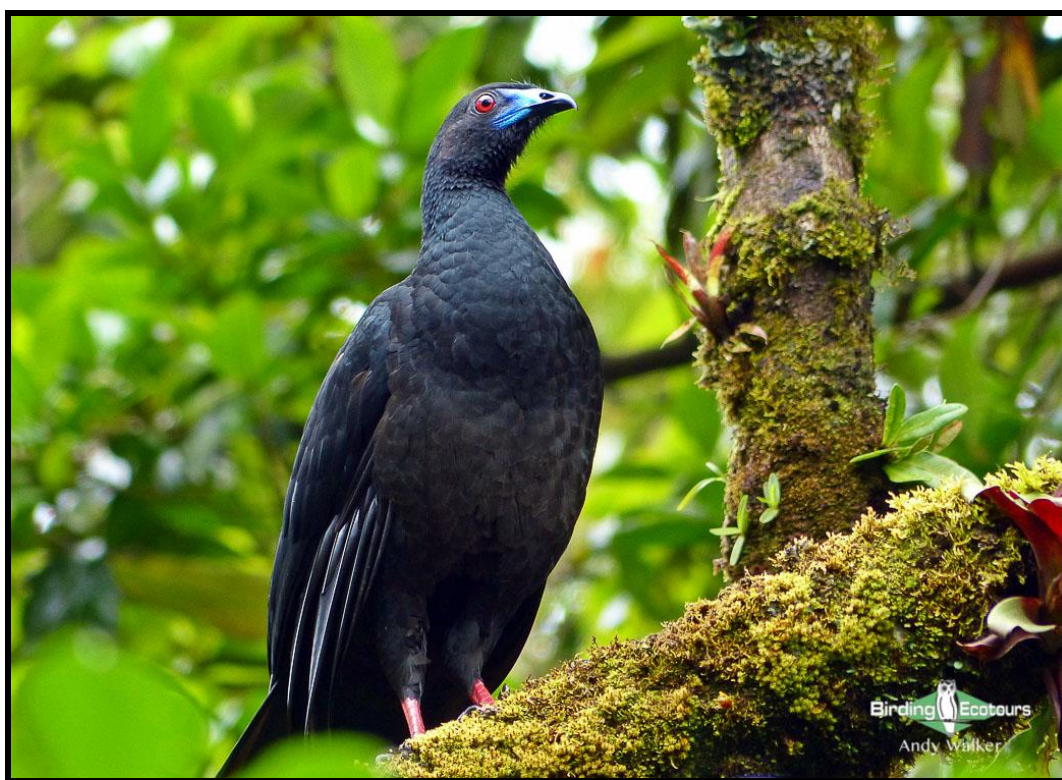
Tapantí National Park has some great birds, such as Black Guan .

Overnight: Hotel Tapantí Media Lodge, Orosi