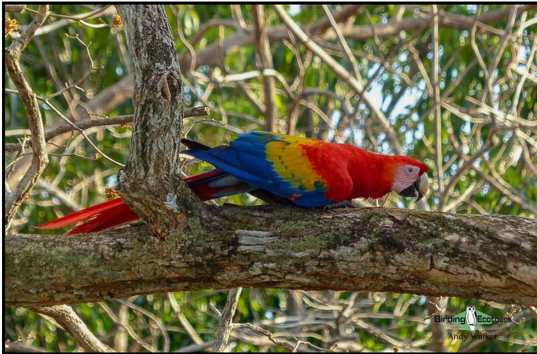
The huge and brightly colored Scarlet Macaw