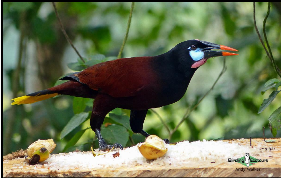
We'll look for Montezuma Oropendola at La Paz Waterfall Gardens.

Overnight: Arenal Observatory Lodge & Spa, La Fortuna