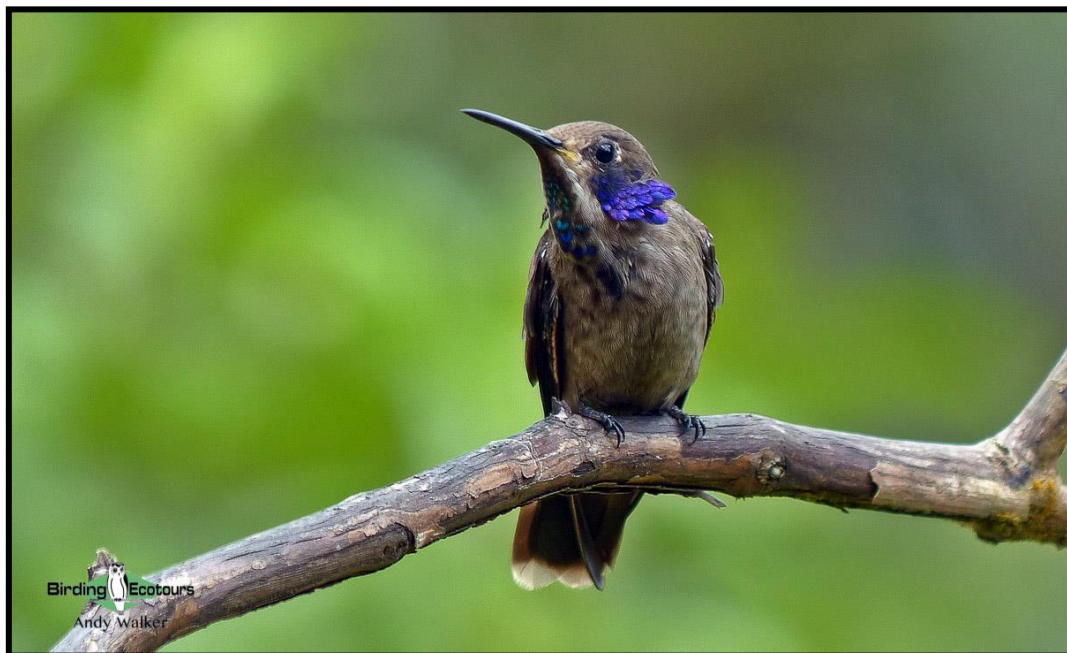
Buenaventura has hummingbird feeders that attract Brown Violetear and many others.

Overnight: Umbrellabird Lodge, Reserva Buenaventura