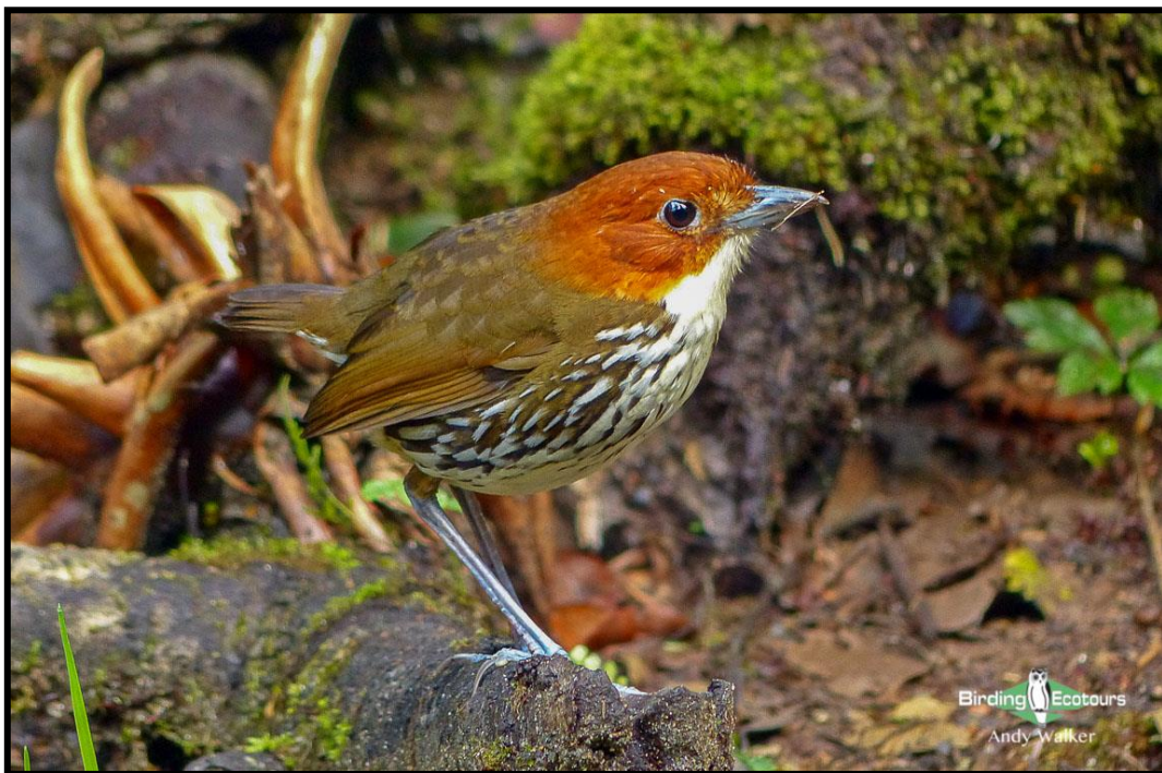
Chestnut-crowned Antpitta can be seen along the trails in Podocarpus National Park.

Overnight: Grand Victoria Boutique Hotel, Loja