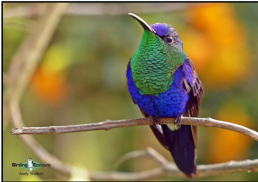
We should see many hummingbird species on this tour like this Crowned Woodnymph .

Join this 19-day Birding Ecotours trip! We are sure you will have a fantastic time with us.