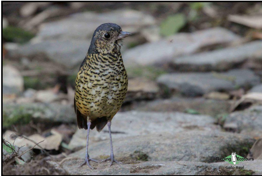
Undulated Antpitta is another antpitta species we may see on this tour.