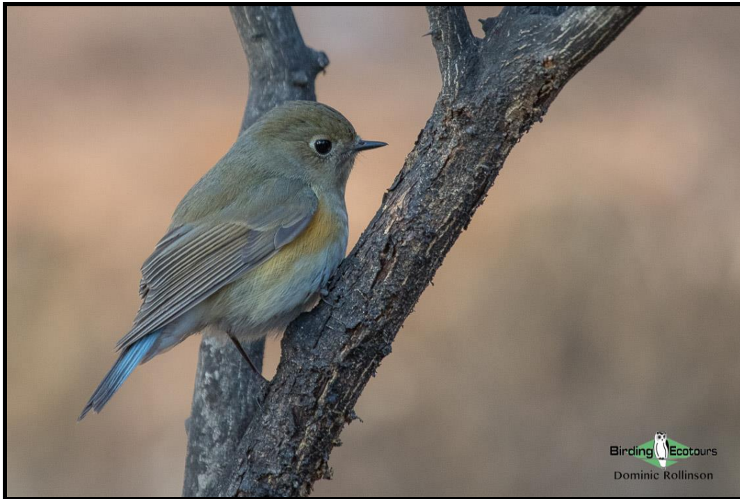
The Tateshina area should produce sightings of Red-flanked Bluetail .

Before breakfast we will be birding the forests in Tateshina. After breakfast we will drive via Lake Suwa to Komatsu in the Ishikawa Prefecture to visit the Katano Kamo-ike Bird Sanctuary to bird in the afternoon for waterfowl. We will especially be looking for Baikal Teal , but may