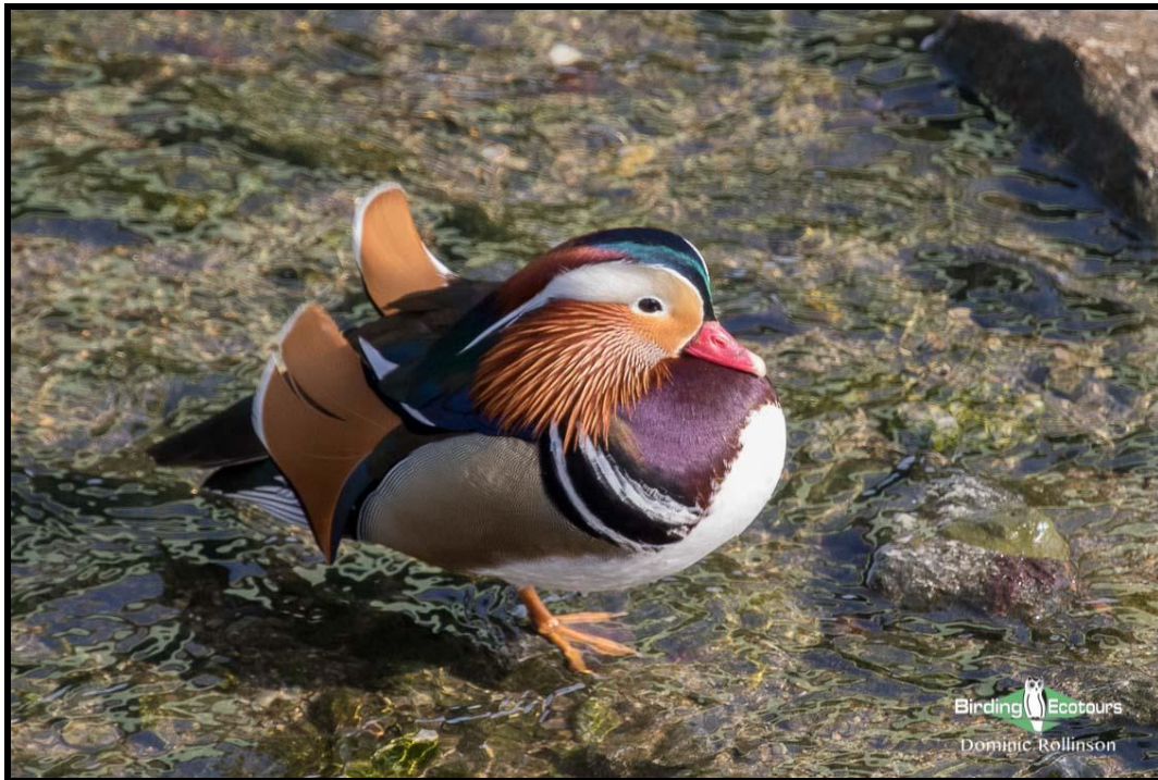
Truly wild Mandarin Duck may be seen on this tour.