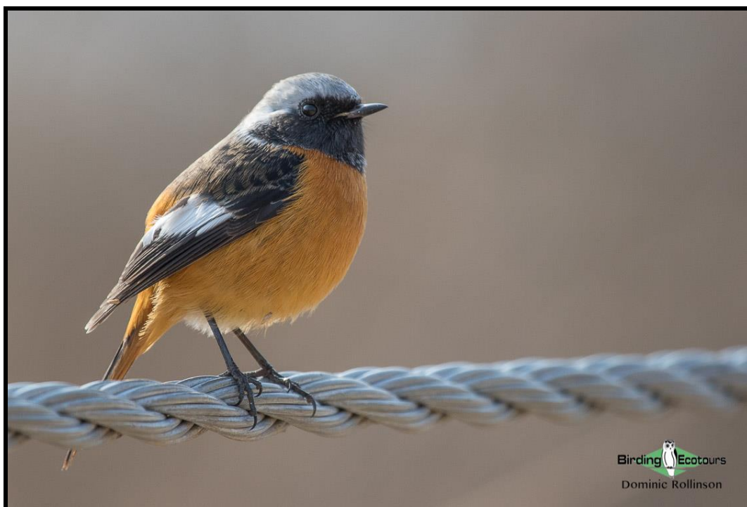
Daurian Redstart adds a splash of color to the Japanese woodlands.