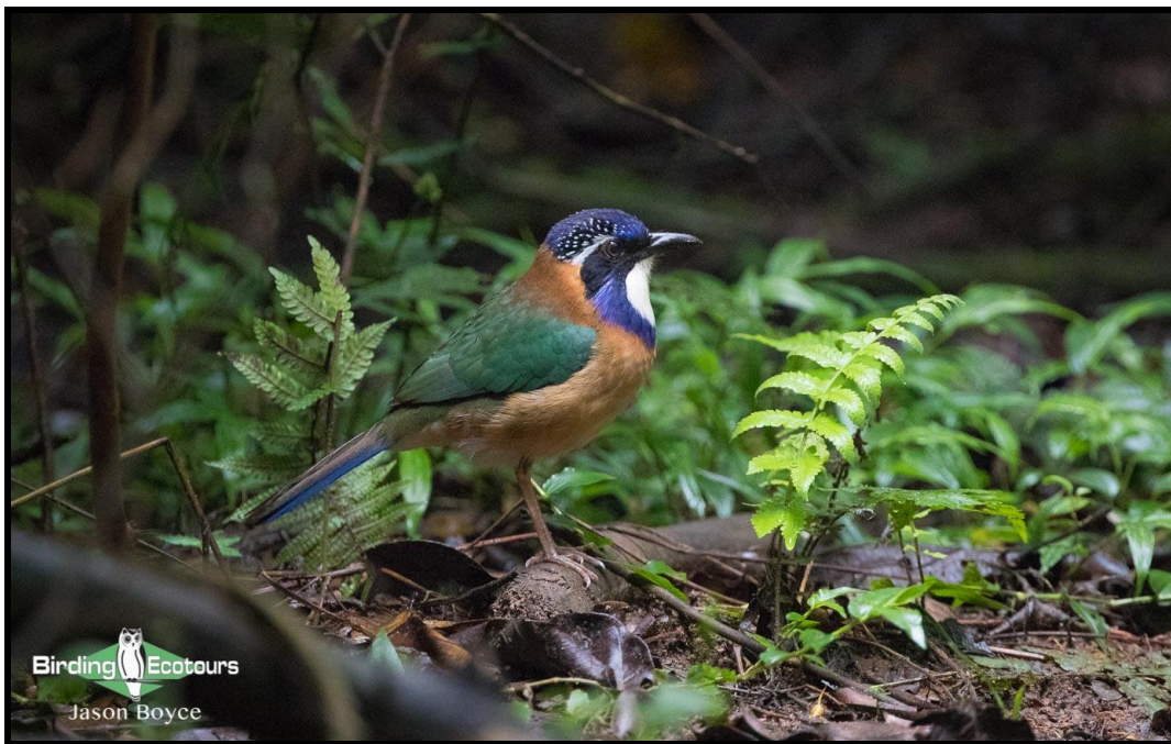
The incredible Pitta-like Ground Roller.