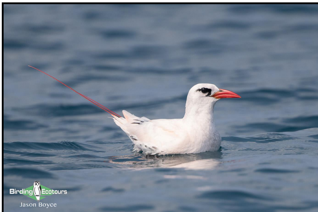
A coastal treat; the smart Red-tailed Tropicbird