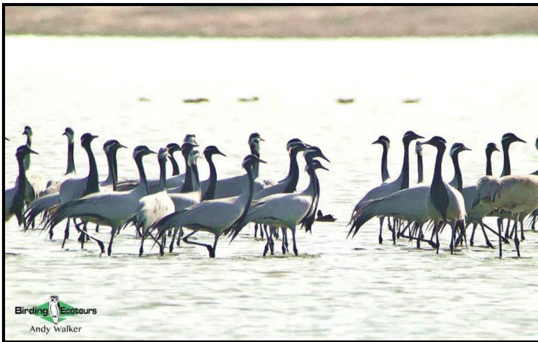
Flocks of Demoiselle Cranes should be seen on this tour.

On one evening we will look at an area where raptors usually come in to roost. We hope to find Western Marsh , Montagu's , and Pallid Harriers , a range of Aquila eagles, falcons, and buzzards. On another evening we will visit a site to look for the gorgeous Demoiselle and Common Cranes as they gather in large flocks, which is sure to be a seriously stunning sight and likely tour highlight.