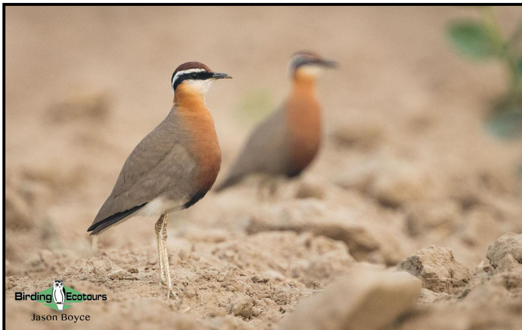
A pair of the sought-after and rather dapper-looking Indian Courser

You could combine this tour with our exciting Birding Tour India: The South – Western Ghats and Nilgiri Endemics or our very popular Birding Tour India: The North – Tigers and Birds that runs directly before this one, or you could follow it up with our Birding Tour India: The Northeast – Birds and Mammals of Eaglenest, Nameri and Kaziranga , which visits the mountains of Assam and Arunachal Pradesh. We can also easily offer you extensions at each location if you'd like to prolong your stay in this wonderful and vibrant country.