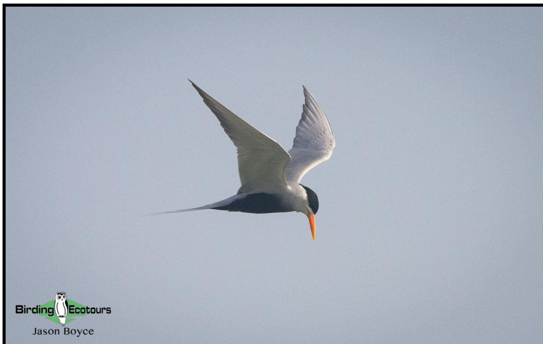
One of the smartest-looking terns in the Eastern Hemisphere, Black-bellied Tern