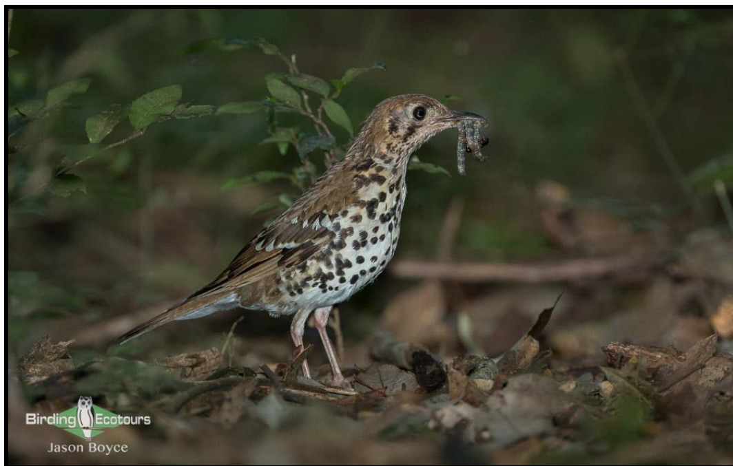
For Spotted Ground Thrush Dlinza Forest usually produces the goods.

A couple of the sites we'll bird today (such as Amatikulu Nature Reserve, the Raffia Palms Monument, Dlinza Forest, and Ongoye Forest) are on the subtropical coast, whereas others are in the cooler midlands closer to Eshowe, where we're spending two nights. Eastern Bronze-naped Pigeon , Crowned Hornbill , Trumpeter Hornbill , and a variety of canopy species (e.g. Grey Cuckooshrike and with some luck Scaly-throated Honeyguide ) are the prized species accessible at the canopy tower at Dlinza Forest. We'll be sure also to spend time walking the trails below, as this is one of the best places anywhere for the stunning Spotted Ground Thrush . Ongoye Forest is the only site for the "Woodward's" subspecies of Green Barbet , plus this is also an excellent place for Yellow-streaked Greenbul , Brown Scrub Robin , and a great many other temperate forest birds.