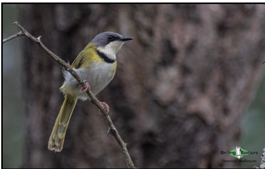
An east coast endemic — Rudd's Apalis.

Overnight: St Lucia Wetlands Guest House, St Lucia