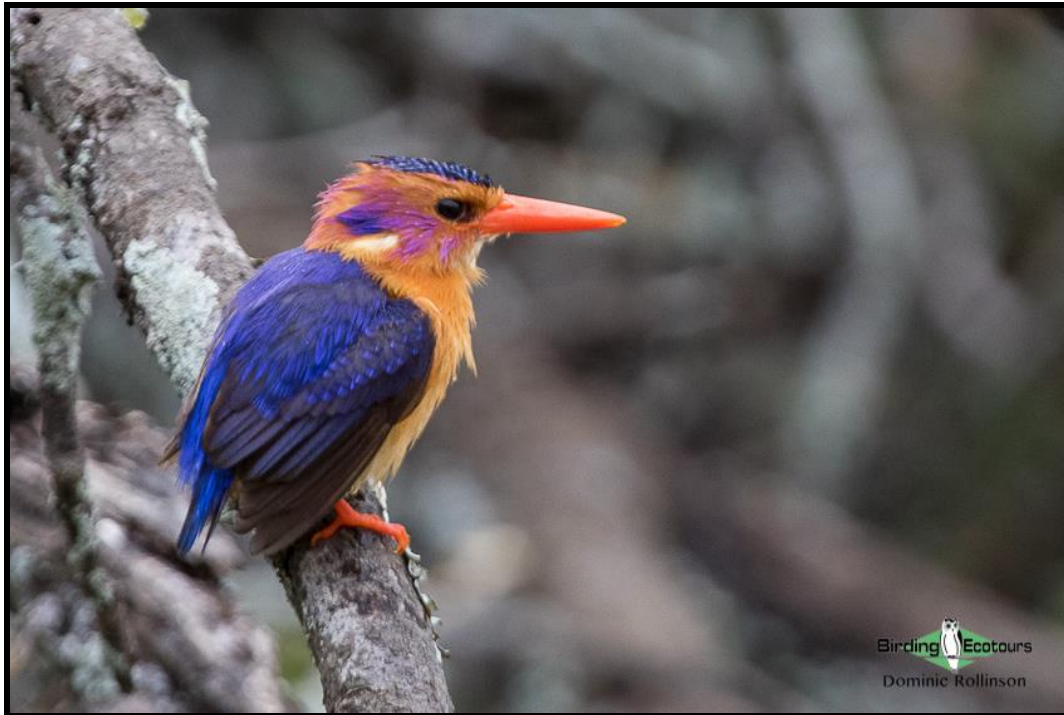
The tiny and remarkably colored African Pygmy Kingfisher can often be seen in Mkhuze Game Reserve.

Overnight: Main (Mantuma) Camp, Mkhuze Game Reserve