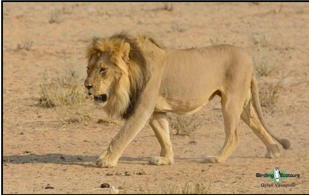
We should find Lion in Kruger National Park.

This subtropical tour provides a representative sample of the very best that African birding can offer. Huge numbers of species will be seen (the typical bird list for this adventure is in the range of 400 species), and we will also find large numbers of South African endemics. Apart from yielding hundreds of bird species, this dream African experience also provides the possibility of seeing Lion , Cheetah , Leopard , African Elephant , White and Black Rhinoceros , Nile Crocodile , Hippopotamus , Giraffe , multiple antelope species, and many other mammal species, as well as breathtaking scenery. We also often get feedback that the accommodation on this tour is great!