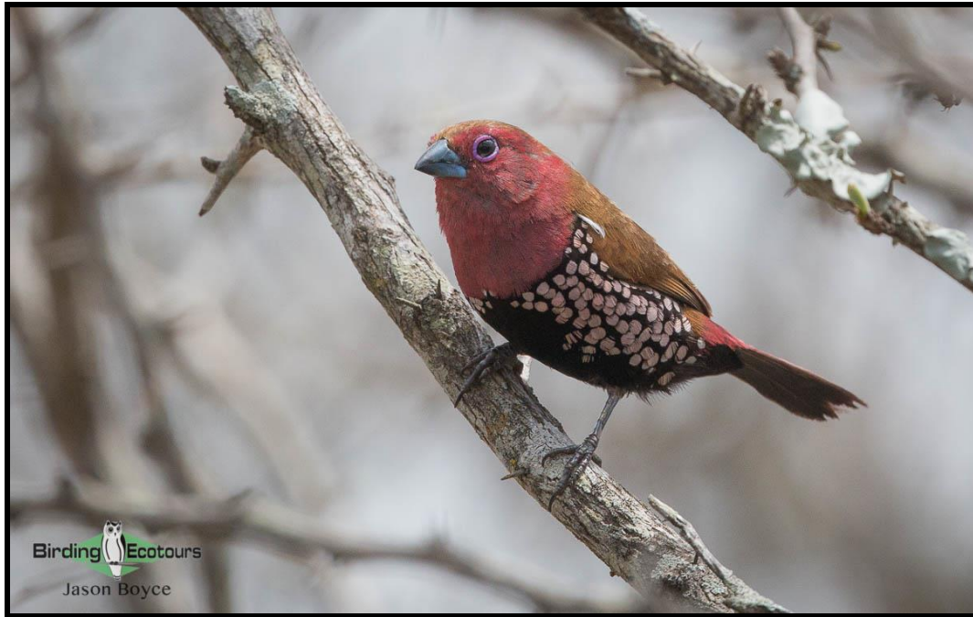
One of the east coast specials we should find on this tour — Pink-throated Twinspot .

occurring here and in southern Mozambique – e.g. Pink-throated Twinspot , Lemon-breasted Canary , and Neergaard's Sunbird . This also is big mammal country and one of the world's strongholds for Black and White Rhinoceros , very good for Leopard , and hosting a variety of mammals not likely to be seen in Kruger – including Nyala , Samango Monkey , the absolutely tiny Suni antelope, etc.