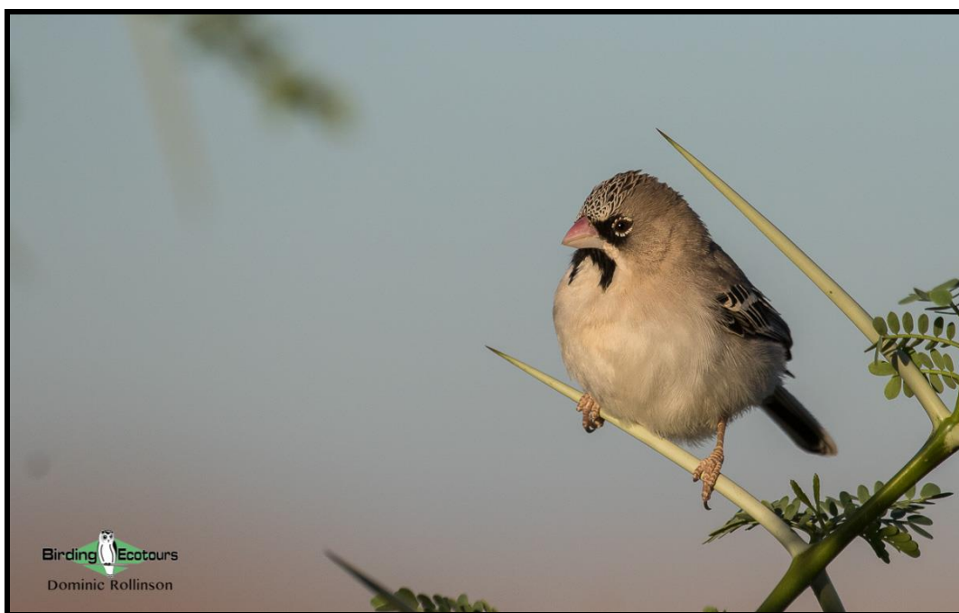
The tiny and cute Scaly-feathered Weaver is often seen at Zaagkuil drift.

Overnight: Zenzele River Lodge, Rust de Winter