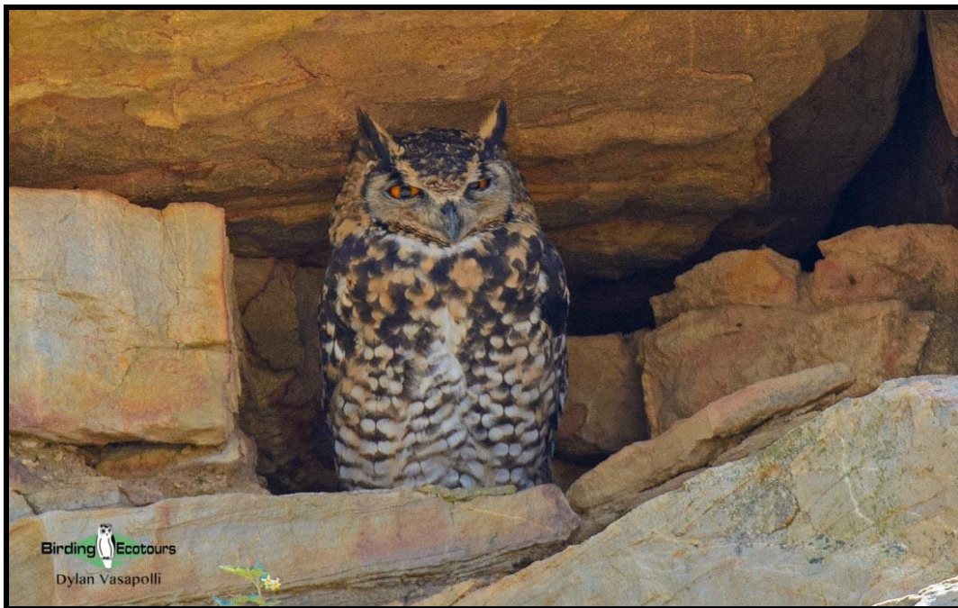
The large and impressive Cape Eagle-Owl

Overnight: Linger Longer Country Retreat, Dullstroom