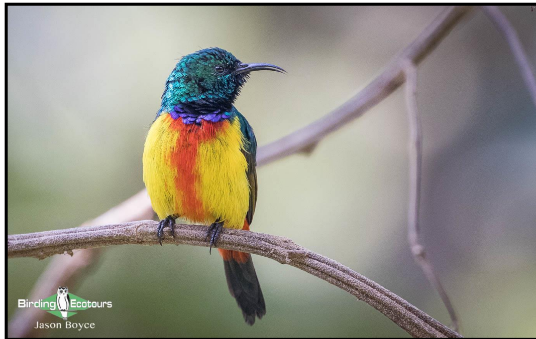
The beautiful Regal Sunbird.