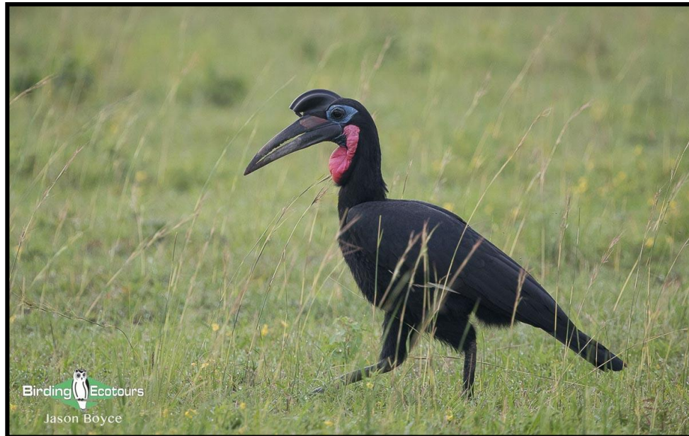
The bizarre Abyssinian Ground Hornbill.

We do boat trips and birding/game drives in this area, where we always add a great many new birds to our list. This is also a brilliant place for big and small mammals that might include Lion , Leopard , Rothschild's Giraffe , Oribi , Lelwel Hartebeest , Common Warthog , the scarce Patas Monkey , and many others. Black-headed Lapwing , Silverbird , Speckle-fronted Weaver , Abyssinian Ground Hornbill , Red-throated Bee-eater , Swallow-tailed Bee-eater , Rock Pratincole , White-headed Barbet , Black-billed Barbet , Meyer's Parrot , and Bateleur are just a few of the species on our rather large menu.