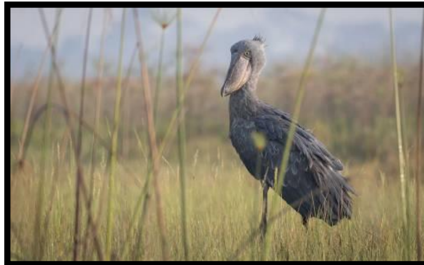
Shoebill is one of our targets on this tour.

1 - 19 August 2020 (14-day tour 1 - 14 August 2020) 1 - 19 August 2021 (14-day tour 1 - 14 August 2021)