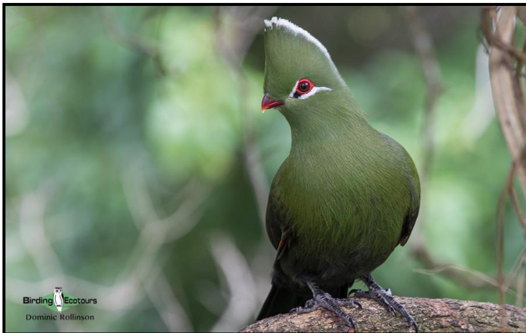
The loud and brightly colored Knysna Turaco is common along the Garden Route.

We begin this tour in one of the world's most beautiful cities, Cape Town, looking for a host of avian endemics found nowhere else but in the Cape Floral Kingdom (the richest place on earth for plants) and also doing a pelagic trip. Cape pelagics are among the best in the world. We then head northward from Cape Town up the west coast, and then across the beautiful and rugged Cederberg range into the Karoo, another one of Africa's greatest endemics hotspots. We then visit the Agulhas Plains, which are the stronghold of South Africa's national bird, Blue Crane , and also are inhabited by localized endemics such as Agulhas Long-billed Lark . We then continue to the picturesque Garden Route, where we have time to sample some of the birds more typical of Eastern South Africa, including Knysna Turaco , Knysna Woodpecker , Half-collared Kingfisher , and a host of others.