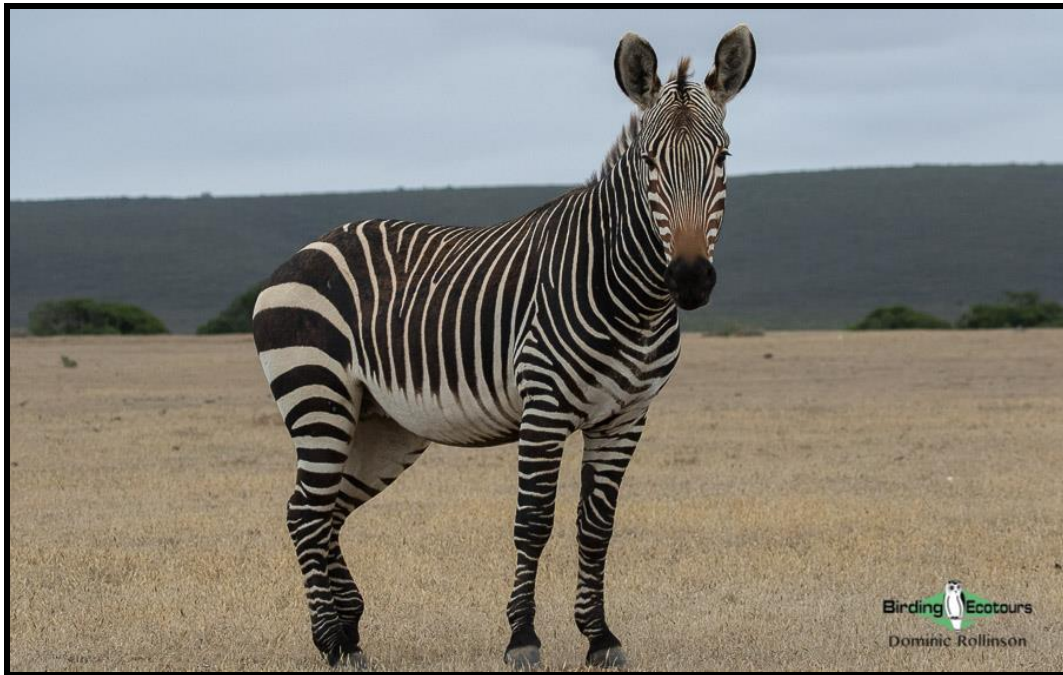
Cape Mountain Zebra is common in De Hoop Nature Reserve.