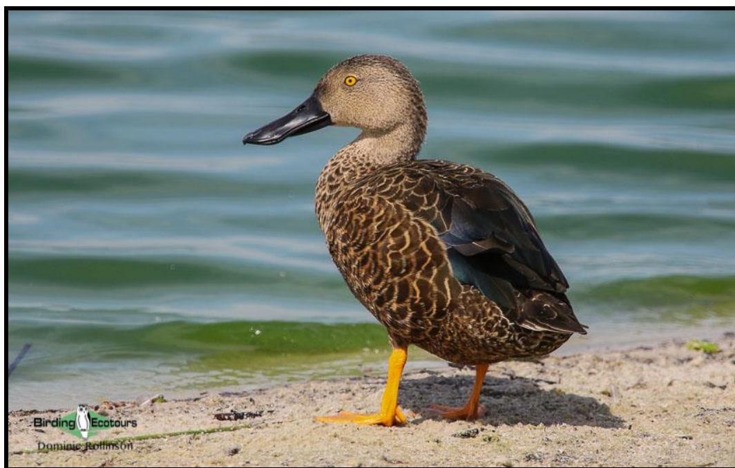
Cape Shoveler, one of the many waterfowl species we should see around Cape Town.

Overnight: Mariner Guest House, Simonstown, South Peninsula