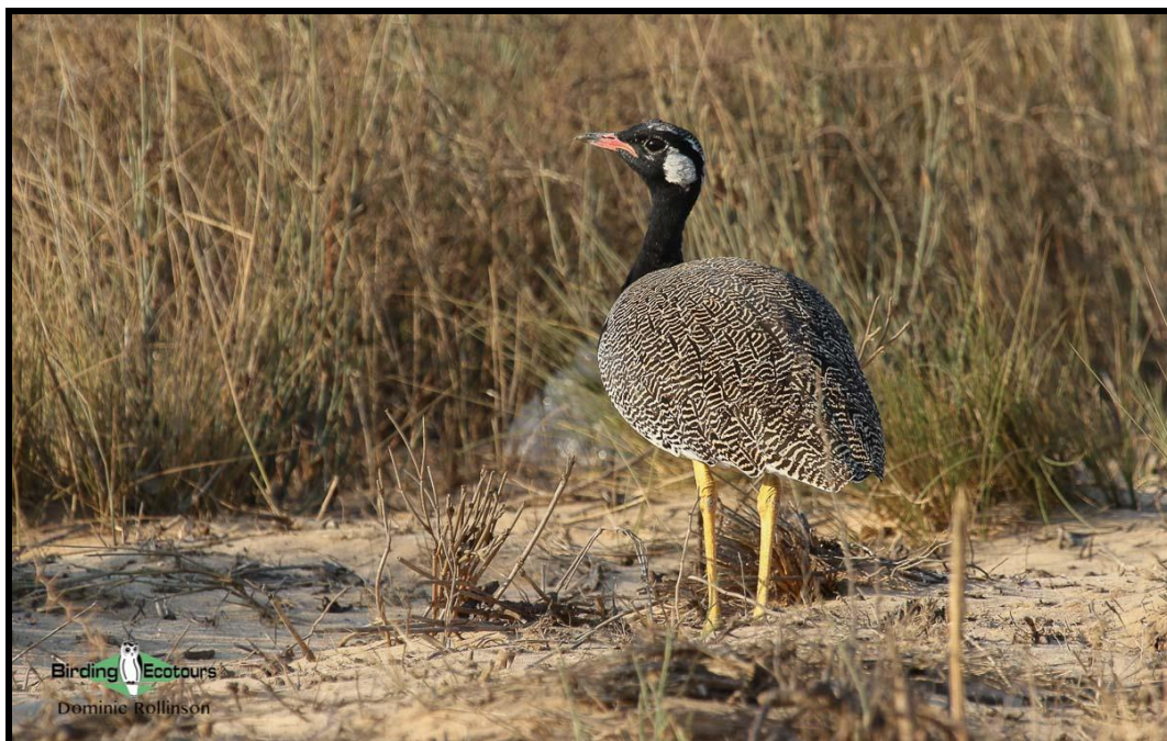
Southern Black Korhaan is normally found fairly easily along the west coast.

Overnight: Le Mahi Guest House, Langebaan