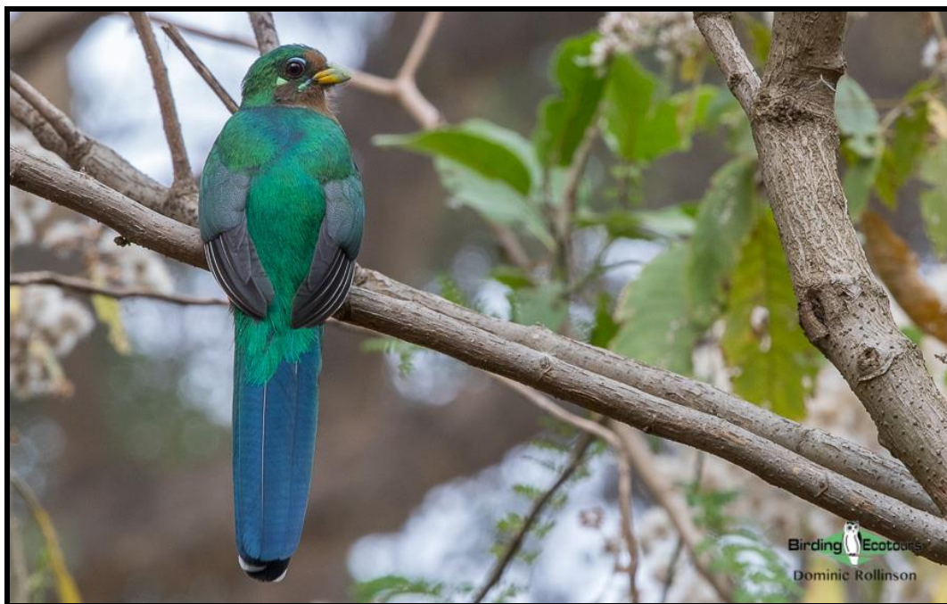
Narina Trogon may be seen in forested areas near Heidelberg.