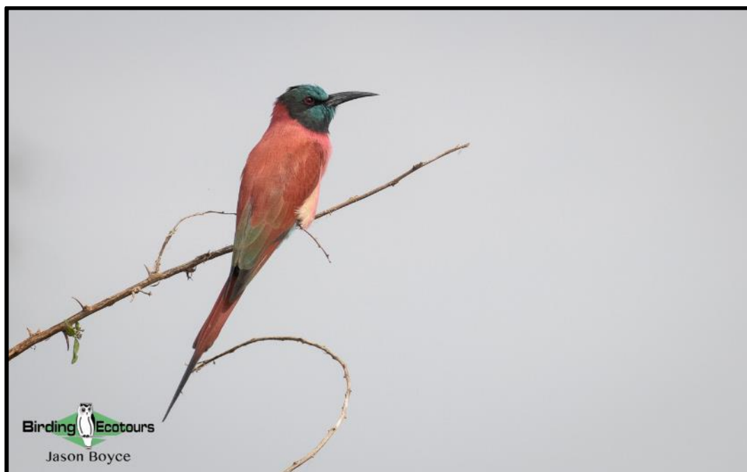
Uganda has bee-eaters and more bee-eaters! Pictured here is Northern Carmine Bee-eater at Murchison Falls National Park.