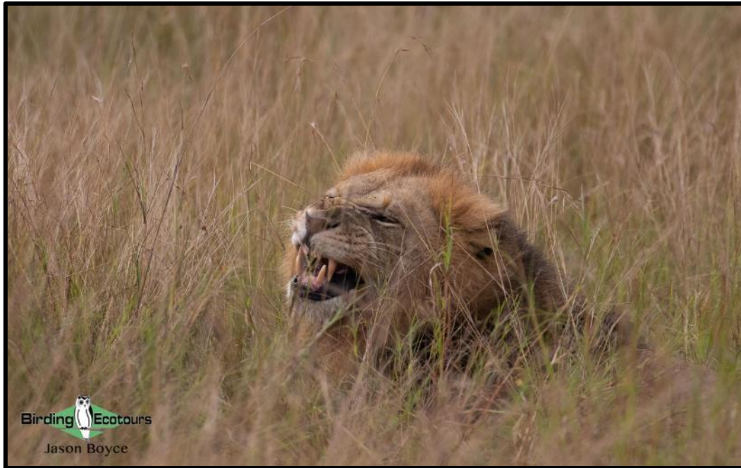
Lion in Queen Elizabeth National Park

On the way to our accommodation we enjoyed some roadside birding with the likes of Chestnut Wattle-eye , male and female African Shrike-flycatcher , Red-headed Malimbe , and three Yellow-crested Woodpeckers . Alpine Swifts were also seen cruising fairly high overhead. Red-tailed Monkey , Grey-cheeked Mangabey , and many Olive Baboons were always nearby. Chestnut-winged Starling and Black Bee-eater rounded off a superb afternoon of enjoying what Kibale has to offer.