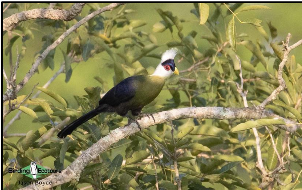
One of my personal favorite sightings of the tour was White-crested Turaco in Murchison Falls National Park.

A rest and a hot lunch were welcome after a morning that produced 30 odd new species for our trip. We then headed back to the boat launch, from where our boat cruise to see Murchison Falls departed. We spent a lot of the time searching the dense foliage along the banks of the Nile for White-backed Night Heron when our skipper exclaimed "There is the heron"! A great sighting, and that of a bird which had not been seen at its regular spot in Lake Mburo.