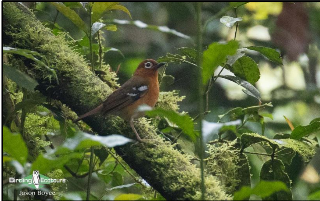
Abyssinian Ground Thrush, one of the more elusive birds in the Buhoma forest. It is fairly often heard but very seldom seen well, but it's safe to say that we had a great sighting!

of Black-faced Rufous Warbler , Black Bee-eater , Western Bronze-naped Pigeon , and a large party of charismatic White-headed Wood Hoopoes on the way back. Some more rain in the afternoon luckily came down pretty late in the day, and we didn't lose too much birding time.