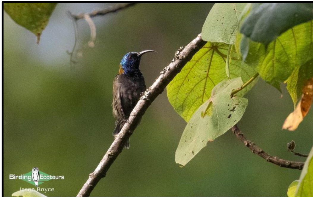
The Albertine Rift endemic Blue-headed Sunbird was more common than usual. We encountered four or five individuals on the hike to Mubwindi Swamp.

It was time for the famous walk to Mubwindi Swamp. This walk is well known for possibly yielding Grauer's Broadbill and Grauer's Swamp Warbler and for the grueling uphill trek back to Ruhija from the swamp. Our enthusiastic group set off with high expectations. Mountain Illadopsis greeted us not long after we had started our walk, and soon after that we picked up the beautiful Blue-headed Sunbird . The soft calls of Dusky Crimsonwing came ringing from the undergrowth alongside the trail, but the birds did not even give us a flash of movement. Mackinnon's Shrike and Yellow-eyed Black Flycatcher were also seen. Black-billed Turaco really gave us the runaround, but we managed to see a few very well on the way back. The "one that got away" today would have to go to Grey-chested Babbler . The bird was calling quite a lot, but getting any sort of visual in the thick undergrowth seemed impossible. Before long we had made our way down to the lower levels of the walk and picked up no less than four Grauer's Broadbills ! The adult pair had successfully raised two young, and they were moving around as a family group. We spent time with them, watching them flit from tree to tree and observing their feeding habits. A few other great birds that we got to see on the way to the swamp included the Albertine Rift endemic Archer's Ground Robin , Black-throated Apalis , Dusky Tit , and Crowned Hornbill .