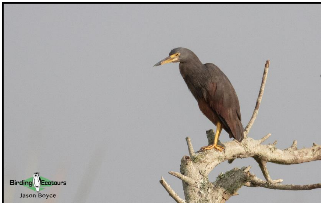
A fairly uncommon species, Rufous-bellied Heron

Before arriving at our accommodation for the next two nights we did some birding on the access road. A small group of Wattled Starlings was trumped by seeing much larger groups later on. Blue-naped Mousebirds were everywhere, while a pair of Nubian Woodpeckers put in a short display. A Red-chested Cuckoo also showed surprisingly well. Other species in this dry woodland included Red-cheeked Cordon-bleu , Crested Francolin , Red-necked Spurfowl , Woodland Kingfisher , and Yellow-billed Oxpecker . It was great to once again find Brown-chested Lapwing in the same area as in the previous few years. Rattling and Trilling Cisticolas were very vocal near the entrance to the park. We arrived safely at the lodge after a successful day. Before we settled in for a drink and a buffet-style dinner we added a few