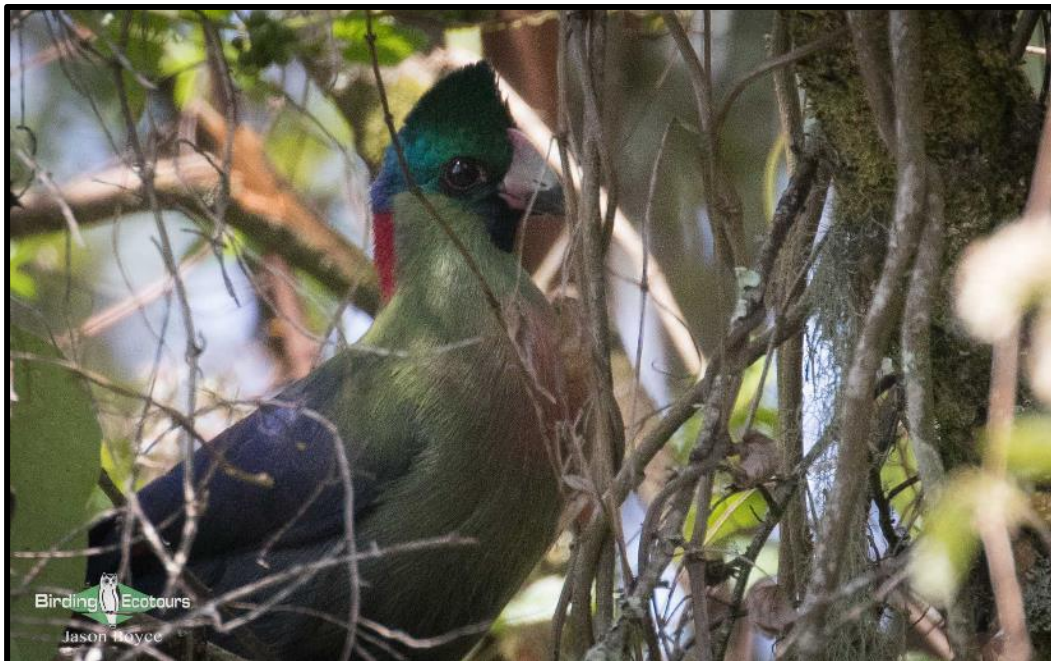
This is certainly an incredibly sought-after species, the Rwenzori Turaco , which was seen in Mgahinga Gorilla National Park.

The Mgahinga Gorilla National Park is one of the most incredibly scenic reserves that we visit on this tour. Both the flora and fauna on the walk up toward Mount Sabyinyo are fantastic. We arrived at the reserve, completed the formalities quickly, and soon we had picked up the likes of White-starred Robin , Olive-breasted and Yellow-whiskered Greenbuls , and Rwenzori Double-collared Sunbird , as well as a whole party of Kandt’s Waxbills . We started our walk up the hillside and encountered Dusky Turtle Dove on the path in front of us. Regal Sunbird and Western Tinkerbird put in appearances throughout the day, but African Paradise Flycatcher only showed once near the start of the walk. Our first apalis of the trip was Mountain Masked Apalis ; we picked up a pair of them calling in the thick bushes and with some patience managed to get some really nice views of both birds. One of our main targets today was the sought-after Rwenzori Turaco ; we heard its call in the morning and enjoyed great looks of one individual on the way down from the gorge.