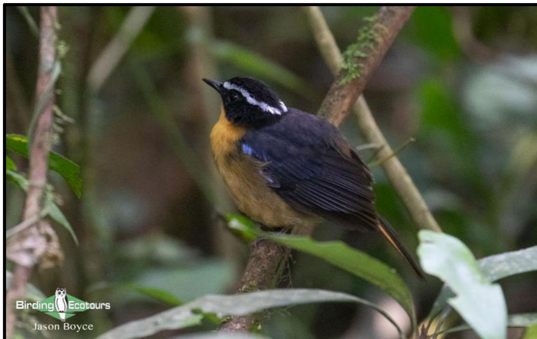
A tinge of the blue shoulder is visible on this Blue-shouldered Robin-Chat .

During our pitta foray a number of species were calling round us: Scaly-breasted Illadopsis (of which we had great looks), Red-chested and Dusky Long-tailed Cuckoos , Tambourine Dove , Brown-chested Alethe , and Fraser's Rufous Thrush . We also managed to locate a calling Narina Trogon as well as Velvet-mantled Drongo . The muddy track through the forest attracted a few species to the verges, Red-tailed Ant Thrush and Red-capped Robin-Chat both giving super views. As if we had not already had an amazing morning we moved toward a large fig tree where we could hear some activity. About six Eastern Chimpanzees were happily moving about in the large canopy, feasting on the fruits of the tree. They were joined by a few avian species, including African Green Pigeon and Purple-headed Starling . There is always something going on in the beautiful Kibale forest, both sights and sounds are really enjoyable. Yellow-mantled Weaver , both male and female, showed well when we arrived back at the office area. In the afternoon we spent some time trying to get visuals of White-spotted Flufftail and Red-chested Owlet . We didn't manage to find the owlet but did manage to see the incredibly elusive White-spotted Flufftail .