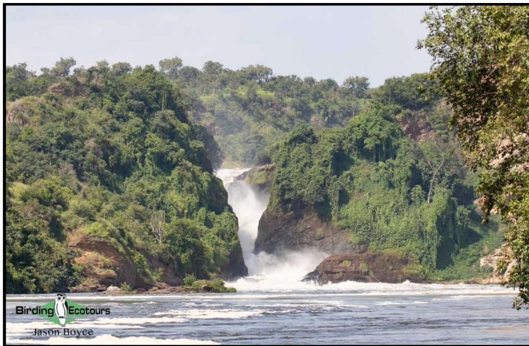
The majestic Murchison Falls from afar.

Our day was far from over, though. Further birding in the park produced a family of Brown Babblers , a few Fawn-breasted Waxbills , and an amazing sighting of Red-winged Pytilia ! We managed to find an area where nightjars are known to be active around dusk. Black-shouldered Nightjar was heard calling, and then suddenly both a female and a cracking male Pennant-winged Nightjar were cruising around above us. It was still light enough to get a really awesome silhouette of the male with long pennants. Greyish Eagle-Owl also showed really nicely before we arrived back at the lodge. What a day!