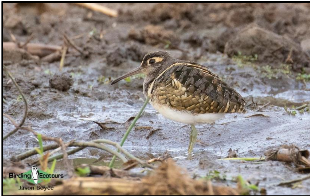
This was certainly unexpected: Greater Painted-snipe

numbers of shorebirds were dotted along the shoreline. The shorebirds, presumably early passage migrants, included Common Greenshank , Marsh and Common Sandpipers , Curlew Sandpiper , Three-banded and Kittlitz's Plovers , Ruddy Turnstone , and a real surprising single Sanderling ! The surprises kept coming, and we also managed to find Greater Painted-snipe on the shoreline. The stunning Red-throated Bee-eater was also present, and we managed to get a few pictures. We also found the likes of Black Crake , Yellow-billed Stork , Hamerkop , Malachite Kingfisher , African Spoonbill , and Pink-backed and Great White Pelicans . Verreaux's Eagle-Owl was another really good find, a bird sitting on an open branch underneath the canopy of a thorn tree. We arrived at the lodge just after sunset and settled in for the night.