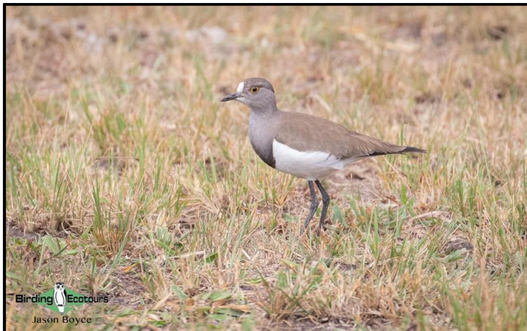
One of many Senegal Lapwings that we found on the grassy plains of Lake Mburo National Park