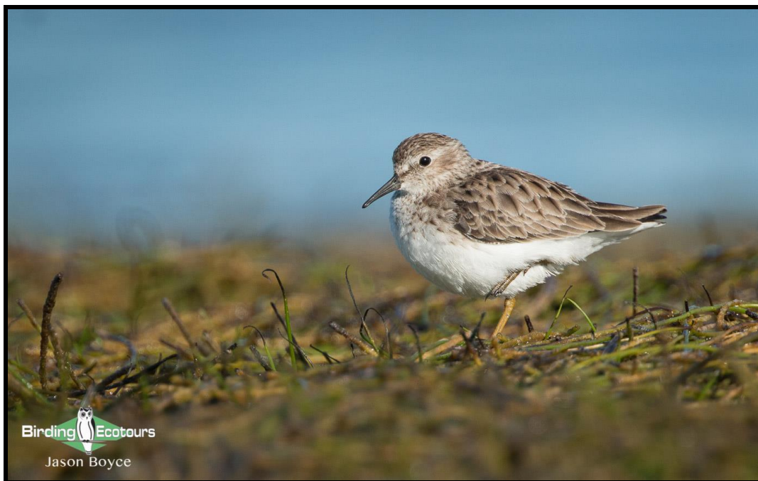
Note the yellowish legs of Least Sandpiper .

The morning will be spent around Bodega Bay, where we will be targeting anything we may have missed the previous day. Next we head southward, with perhaps a stop at the Marin Headlands hawk watch. Here we may see a variety of raptors, including Sharp-shinned , Cooper's , Red-tailed , and Red-shouldered Hawks , White-tailed Kite , Prairie and Peregrine Falcons , and possibly Golden Eagle .