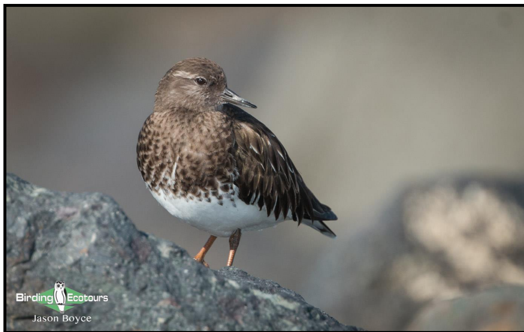
Black Turnstone is a fantastic west coast special!

Today will be the first of our two scheduled pelagic trips, this time into the world-famous Monterey Bay. Huge upwellings produced by a massive submarine canyon twice the size of the Grand Canyon allow for rich and diverse wildlife viewing within a short distance of land. Potential species include Buller's , Pink-footed , Sooty , and Black-vented Shearwaters , Ashy and Black Storm Petrels , Pomarine , Parasitic , and Long-tailed Jaegers , South Polar Skua , Arctic Tern , Cassin's and Rhinoceros Auklets , and Scripps's and Marbled Murrelets . We will hope for a rarity such as Tufted Puffin , Fork-tailed Storm Petrel , Streaked , Wedge-