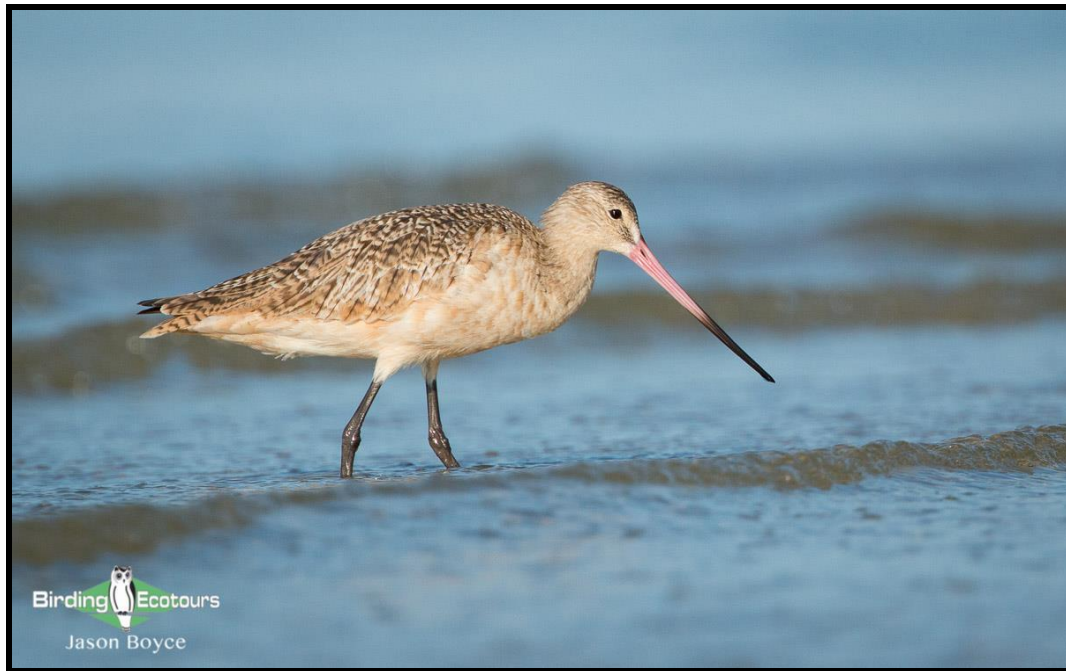
Marbled Godwit, one of the many waders we should encounter in the Watsonville area