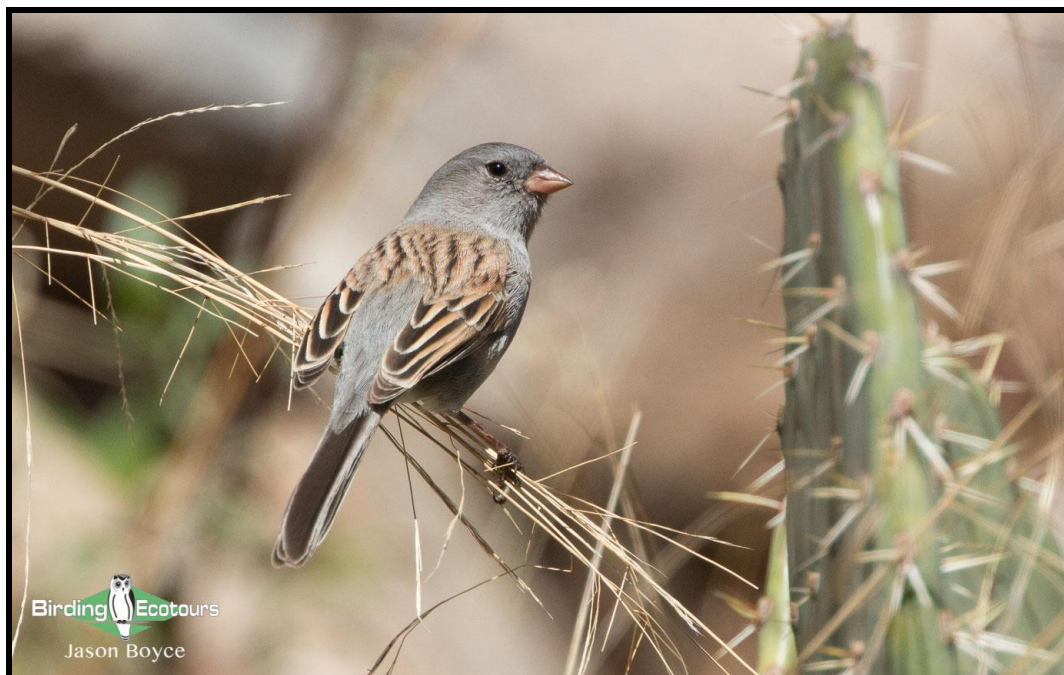
A young Black-chinned Sparrow , showing only hints of a black chin.