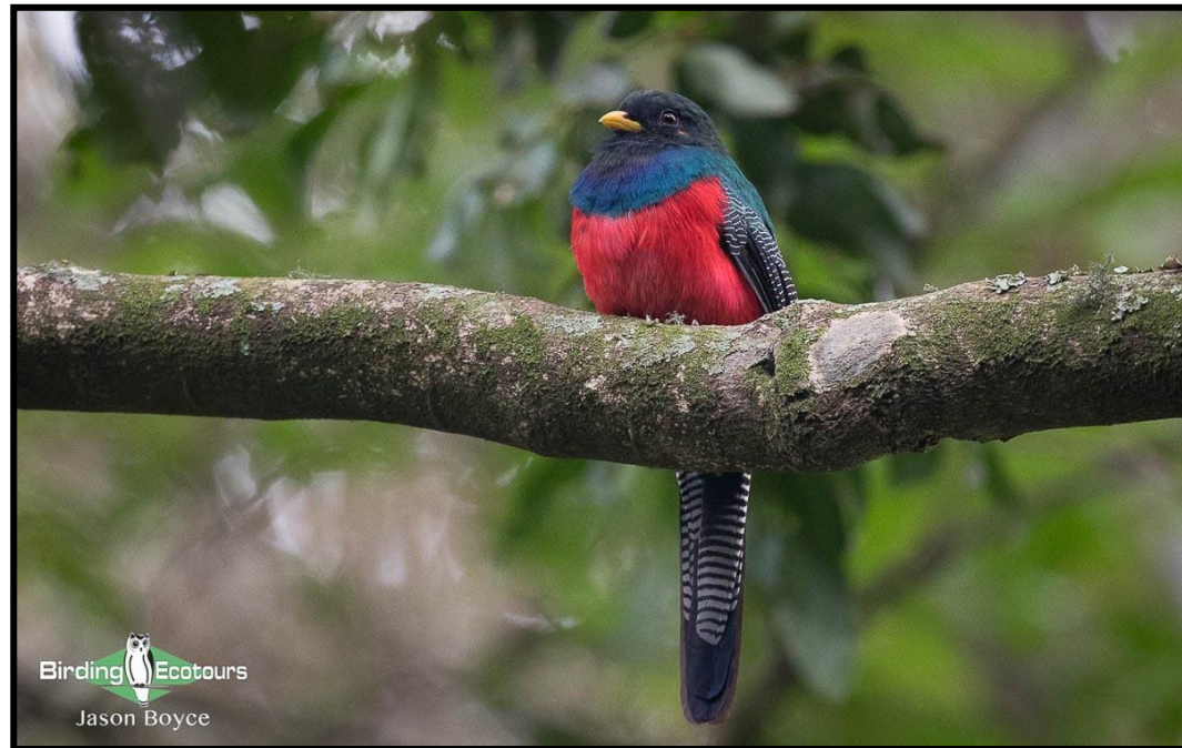
Bar-tailed Trogon is a target at Bwindi.

Overnight: Trekker’s Tavern Cottages, Ruhija – Tel. +256-772455423