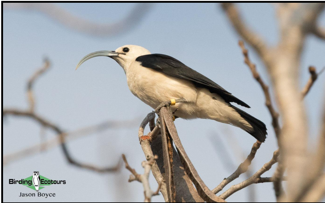
Sickle-billed Vanga is a target near Ifaty.