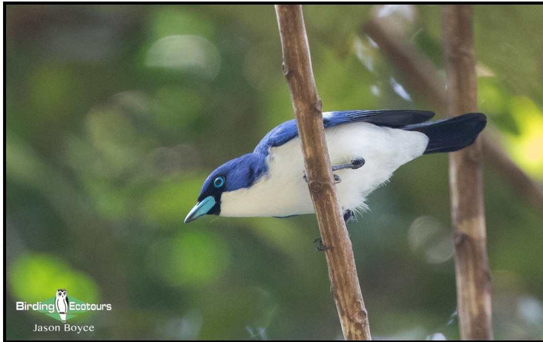
An inquisitive Blue Vanga .