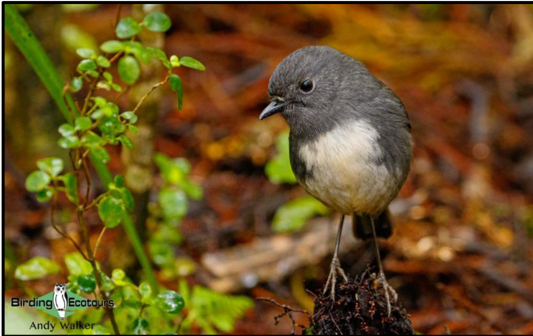
South Island Robin is extremely confiding!