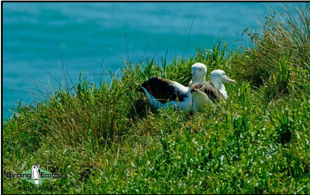
A unique opportunity to observe Northern Royal Albatross on land!

As the afternoon drew on we had one final stop at a private reserve, where we learned about and then saw five of the Endangered (IUCN) Yellow-eyed Penguins , a species in rapid decline globally and a real privilege to see. While here we also saw a couple of the much smaller Little Penguins that were also nesting in the area. A New Zealand Sea Lion was loitering on the beach too, presumably looking for a penguin-shaped dinner snack... As far as first days of a tour go, this was a pretty great start!