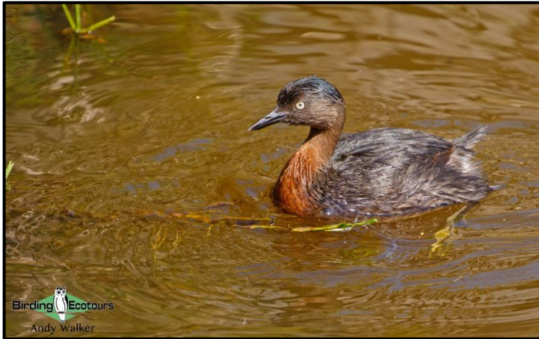
New Zealand Grebe .... pretty cool to get a lifer while in Hobbiton!

A non-birding day exploring the Lord of the Rings and Hobbit film set 'Hobbiton' near Matamata. It was a great site to explore, and we had the bonus of a pair of New Zealand Grebes on the village pond outside the Green Dragon Pub!