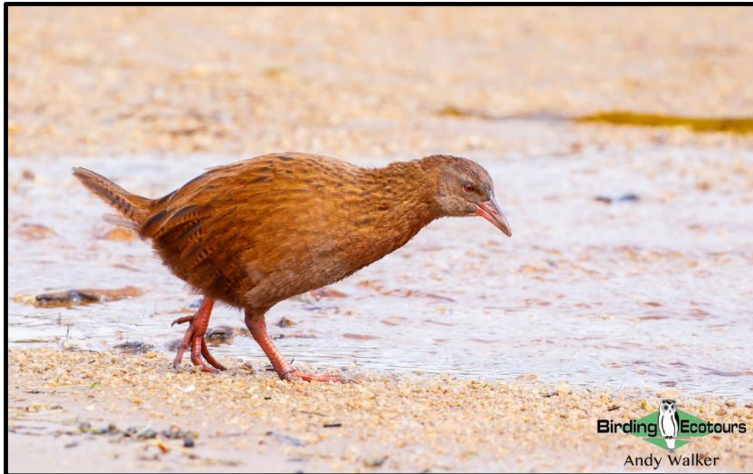
Weka - another confiding, flightless bird living on the edge

On arrival at Milford Sound the clouds were down, and the view was not as spectacular as we had hoped. However, twenty minutes later, after we had been enjoying views of Weka , Tomtit , and New Zealand Bellbird , the sun came out and the clouds shifted, giving us some seriously spectacular views of the lake and mountains. A tour highlight in its own right!