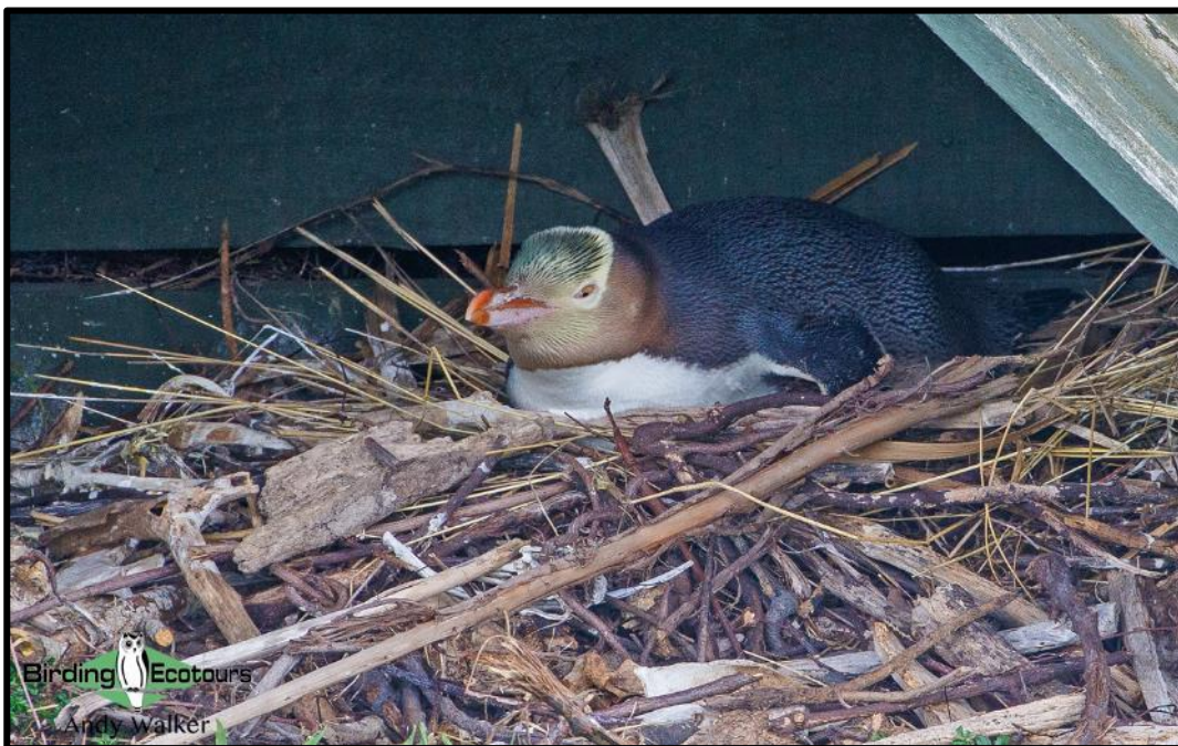
It was a real privilege to observe nesting Yellow-eyed Penguin .

As the afternoon drew on we had one final stop at a private reserve, where we learned about and then saw five of the Endangered (IUCN) Yellow-eyed Penguins , a species in rapid decline globally and a real privilege to see. While here we also saw a couple of the much smaller Little Penguins that were also nesting in the area. A New Zealand Sea Lion was loitering on the beach too, presumably looking for a penguin-shaped dinner snack... As far as first days of a tour go, this was a pretty great start!