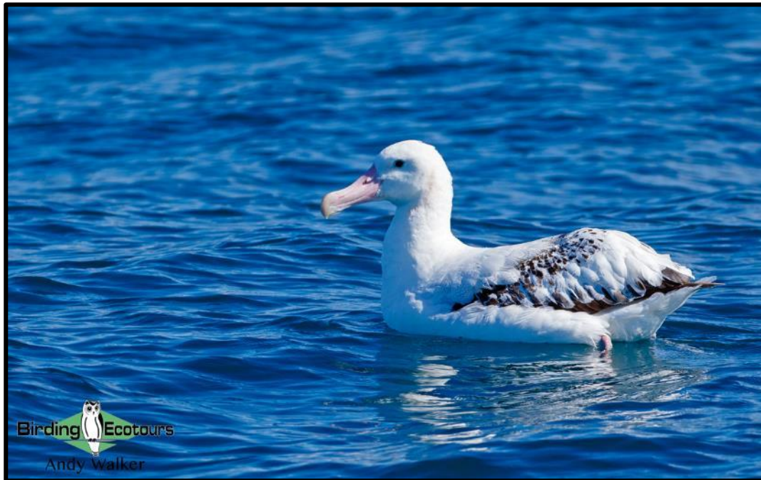
Antipodean Albatross was present on the pelagic trip.

close, a Grey-faced Petrel performed a fly past, and several boisterous Northern Giant Petrels jostled for position with several Antipodean Albatrosses and one Wandering Albatross .