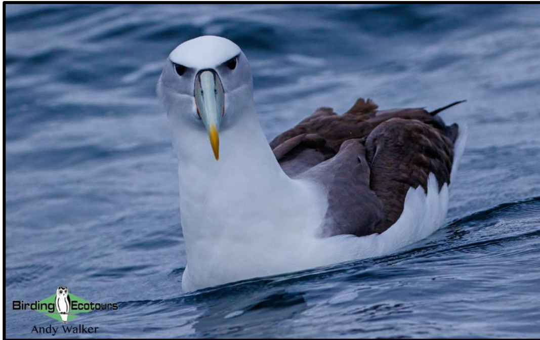
The New-Zealand-breeding subspecies of Shy Albatross is split by some authorities and called White-capped Albatross . It's easy to see why in this picture.