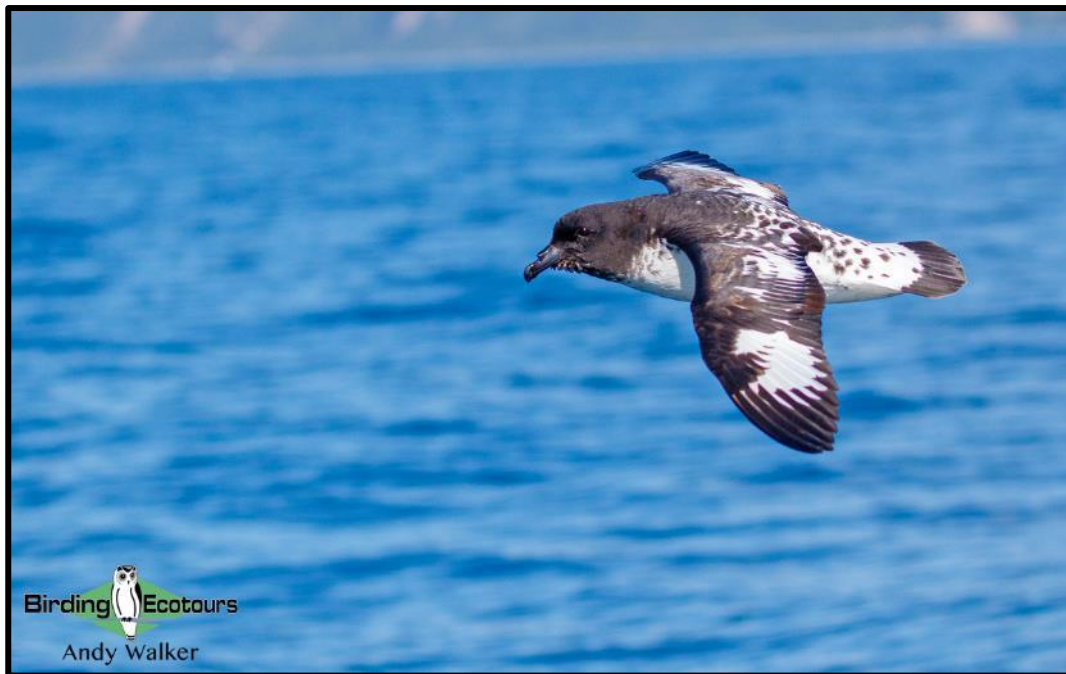
Cape Petrel was a constant feature on the boat trip.

We took a morning boat trip into the bay at Kaikoura. We didn't have to go far before we started to see some good birds, with Caspian Tern in the harbor, quickly followed by a small flock of White-fronted Terns , our best view to date. As we left the harbor we found our first raft of Hutton's Shearwaters in much lower numbers than the previous evening but much closer. A little farther and we were suddenly watching Northern Giant Petrel and Cape Petrel , from none to about forty of the latter in no time at all.