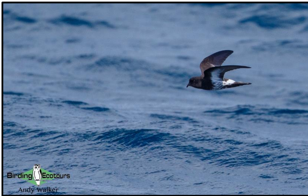
The main target of our pelagic trip was the Critically Endangered (IUCN) and very locally distributed endemic New Zealand Storm Petrel .

We stopped off at a couple of islands along the way, finding Weka , New Zealand Kaka , Tui , Paradise Shelduck , and Indian Peafowl . New Zealand Plover , Royal Spoonbill , and Bar-tailed Godwit were present on the beach as we came back into the harbor.