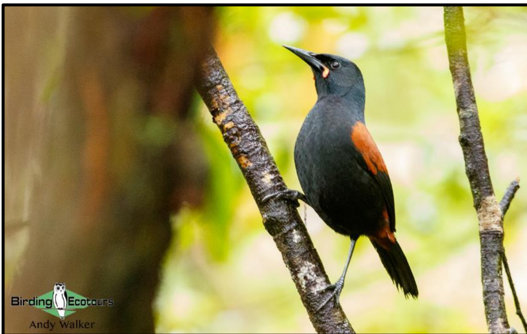
South Island Saddleback was a highlight bird for us during the afternoon, along with a flock of Yellowhead and Pipipi.

Several other birds were noted as we made our way around the island, such as White-fronted Tern , Variable Oystercatcher , Paradise Shelduck , and Spotted Shag .