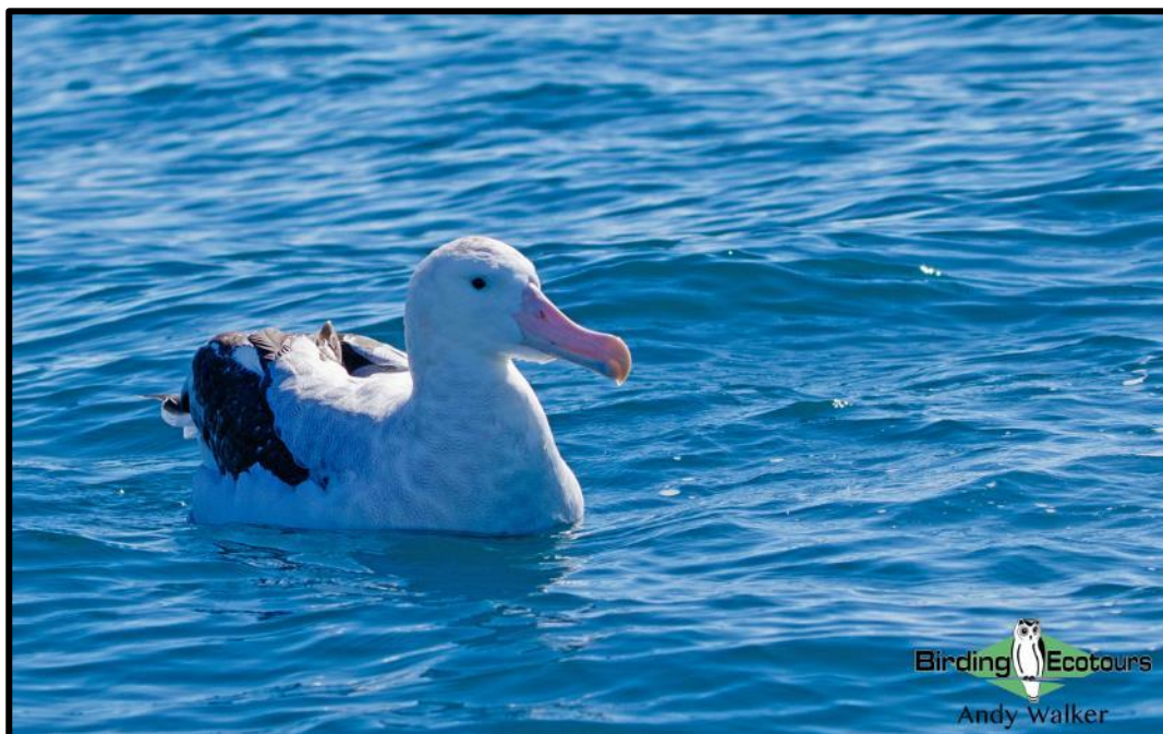
Wandering Albatross was a good record for the pelagic.

Two Northern Royal Albatrosses came in, one eventually sitting close to the back of the boat, with the other keeping its distance. A single Shy (White-capped) Albatross came in briefly, with a couple of others noted as we were transiting, but they seemed less bothered about our presence