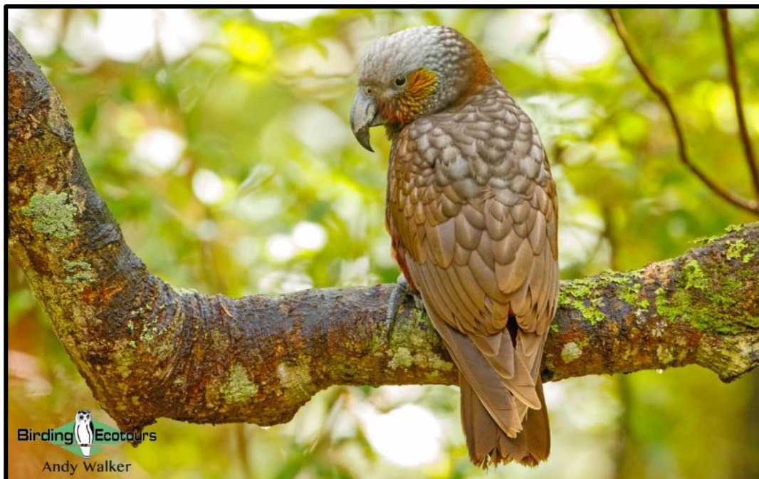
New Zealand Kaka is a large, endemic parrot that makes some remarkable sounds.

As soon as the boat pulled into the tiny harbor on Ulva Island we noted South Island Robin waiting there to welcome us, along with a huge bull New Zealand Sea Lion . As we got our bearings and sorted out our gear we became aware of a Weka (a flightless rail) literally right beneath our feet, totally unconcerned by our presence. As we started our hike we found the huge New Zealand Pigeon sitting low in a giant tree. Over the course of the next couple of hours we found many of our target birds, such as Red-crowned Parakeet , Yellow-crowned Parakeet , New Zealand Kaka , Pipipi (New Zealand Creeper), Yellowhead , Grey Gerygone , Morepork , New Zealand Bellbird , Tui , Tomtit , New Zealand Fantail , and South Island Saddleback . Most of the birds seen were extremely approachable and gave great views. Furthermore the primeval forest was a real joy to walk in, and one could imagine what much of New Zealand must have been like in years gone by.