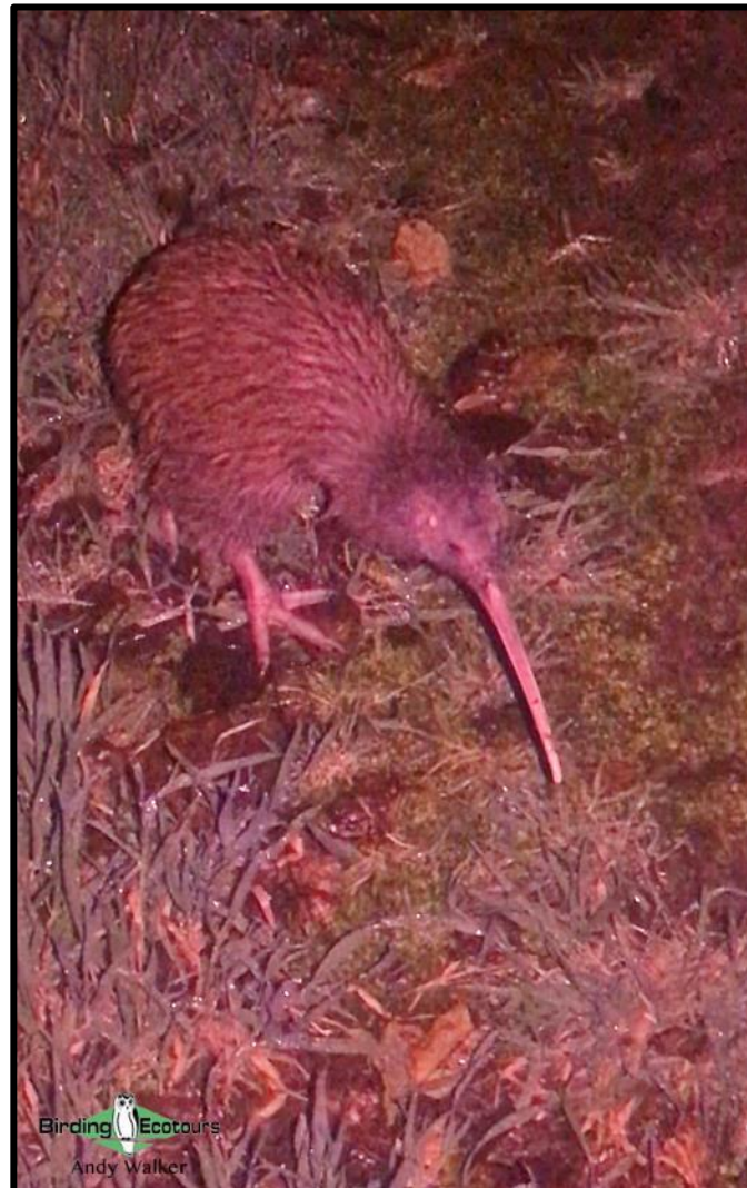
Southern Brown Kiwi gave outstanding views as one walked right up to us! (iPhone video-grab)

a kiwi), flightless, ancient bird. It was a real privilege to get such amazing views of a pair of birds. Just as we were leaving the area we were treated to a wonderful, clear, southern starry sky.