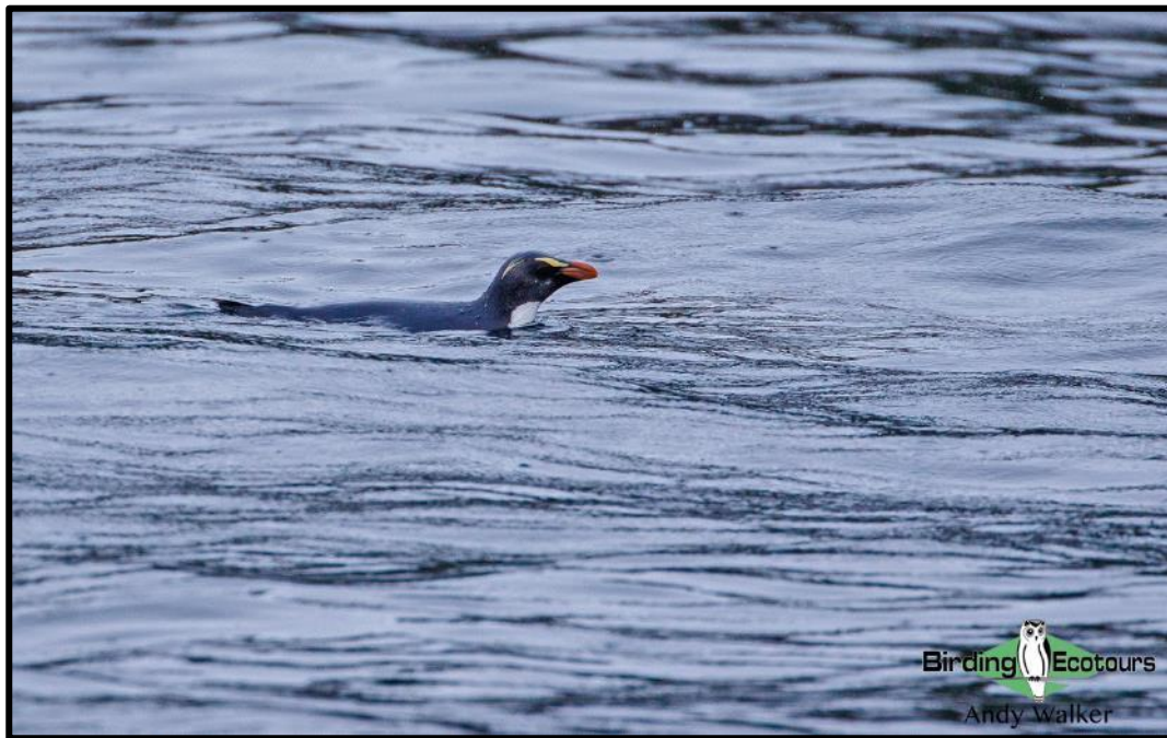
Fiordland Penguin was a bonus bird as we were looking for albatross.

As we walked to and from the boat jetty from our accommodation we found several endemic and introduced birds, highlights being Tui , New Zealand Pigeon , New Zealand Kaka , Grey Gerygone , New Zealand Fantail , New Zealand Bellbird , Variable Oystercatcher , and Paradise Shelduck .