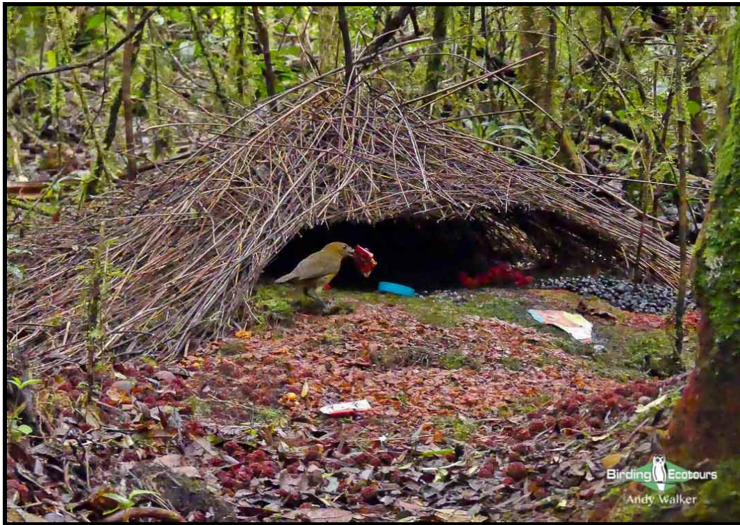
The impressive bower of the Vogelkop Bowerbird

This Arfak and Waigeo tour will begin in the town of Manokwari, situated on the north-eastern tip of West Papua's Bird's Head (or Vogelkop) Peninsula. From here we will travel to the nearby Arfak Mountains, where we will search for a fabulous series of birds, renowned in birders' circles as the "Vogelkop Endemics", such as Vogelkop Bowerbird , Western Parotia , Arfak Astrapia , Long-tailed Paradigalla , Black Sicklebill , Magnificent Bird-of-paradise , and Spotted Jewel-babbler .