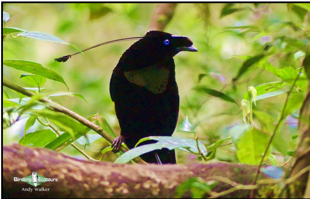
Western Parotia, yet another great bird-of-paradise

We will also look for the exciting Western Parotia , the males of which perform a bizarre side-step dance on the floor of their display courts, while their flank plumes are spread to form a circular skirt, with their six, wiry, antenna-like nape feathers directed forward. Two other endemic birds-of-paradise are commonly seen here at higher altitudes (almost 2,000 meters/6,550 feet) – the little-known Arfak Astrapia and Long-tailed Paradigalla (rediscovered in 1989) – as well as the more widespread Black Sicklebill with its magnificent tail, which can be 80 centimeters/31 inches long. Lower down the Magnificent Bird-of-paradise may be seen on his court, displaying, in sequence his iridescent, carmine back, dark-green breast shield, and sulphur-yellow cape before jerkily dancing up and down a vertical sapling, while quivering his cocked, sickle-shaped central tail feathers. Up to seven species of robins may be seen on the mountain trails, among many other families, as well as Spotted Jewel-babbler , and, if we are lucky, Feline or Mountain Owlet-nightjar .