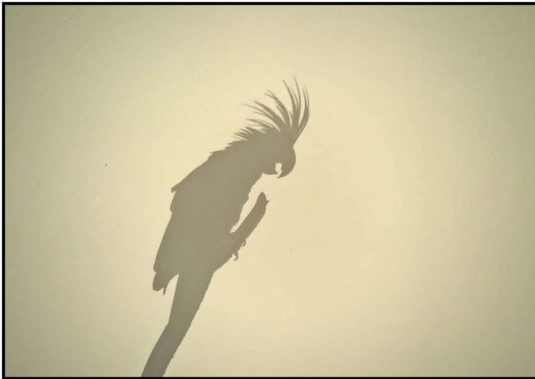
We should see Palm Cockatoo in the forests near Sorong.

An early start today will see us birding in some forest near Sorong. There are many incredible birds possible, some of which may include Palm Cockatoo, Magnificent Riflebird, King Bird-of-Paradise, Red-breasted Paradise Kingfisher, Yellow-billed Kingfisher, Blue-black Kingfisher, Red-billed Brushturkey, Black Lory, and Long-tailed Honey Buzzard .