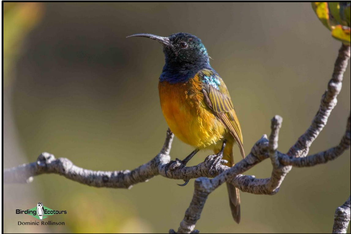
The beautiful Orange-breasted Sunbird is common in mountain fynbos of the Cape.

Gull, Purple Heron, Whiskered Tern, Intermediate Egret, and Glossy Ibis. In the surrounding scrub and reedbeds we found Black-winged Kite, Little Rush and Lesser Swamp Warblers, Cape Longclaw, and Cape Weaver.