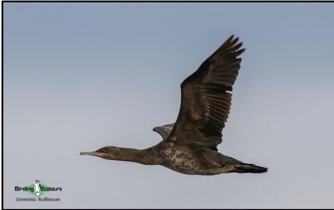
Cormorants, such as this Cape Cormorant , were seen well at Stony Point.

After a fantastic week of birding around the Cape unfortunately the tour came to an end this morning. As we were packing the vehicle an African Harrier-Hawk flew by briefly before we headed to the airport, where some of us would be carrying on to join our 18-day Subtropical South Africa tour starting in Durban later that afternoon.