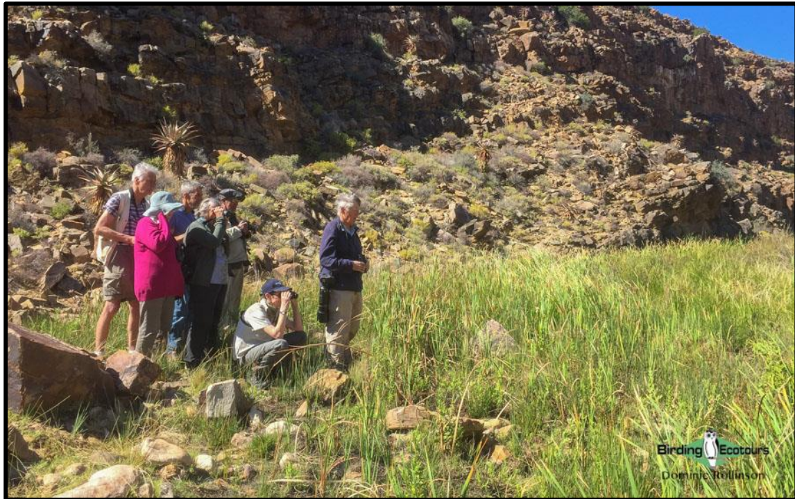
Waiting for a flufftail!

This morning we headed back to the reedbeds to have another crack at Red-chested Flufftail. As we arrived at the site we flushed a couple of African Snipes and then began the vigil of waiting for the flufftails to show themselves. After a long wait a couple of us managed brief views of a single male Red-chested Flufftail as it briefly crossed the path.