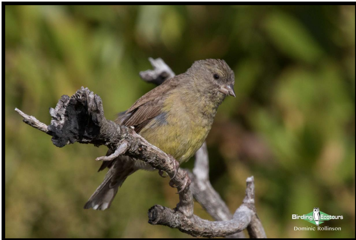
The endemic Cape Siskin put on a show for us at Rooi Els.