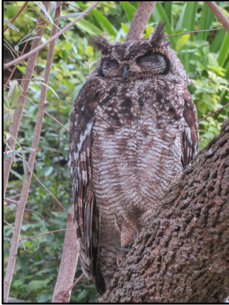
The resident Spotted Eagle-Owl showed well at Kirstenbosch National Botanical Garden.