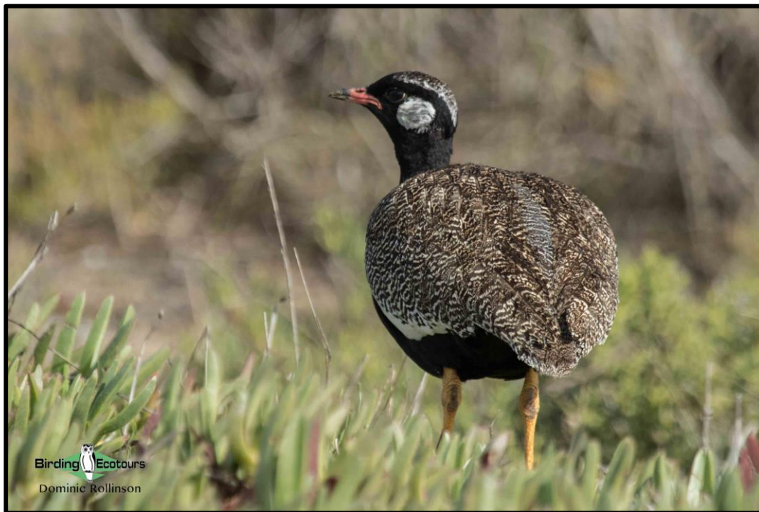
Southern Black Korhaan was seen on the west coast.

For those who were keen to join we left on a predawn mission to look for displaying Cape Clapper Larks. Unfortunately, there were none calling in the area, and so we headed back for an early breakfast at the guest house before making our way farther north up the west coast. En route to the farmlands of Vredenburg we stopped around Langebaan, where we found a number of displaying Cape Clapper Larks as well as Cape Long-billed and Karoo Larks and Southern Black Korhaan . The farmlands proved really productive with sightings of Blue Crane (dozens!), Spotted Thick-knee , Capped Wheatear , Namaqua Dove , Grey Tit , Banded Martin , and Sickle-winged Chat , with sighting of the day going to a distant Ludwig's Bustard .