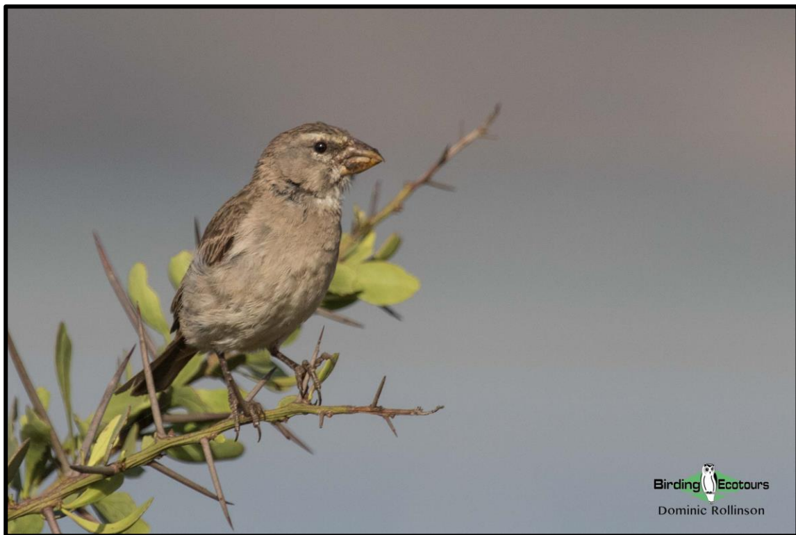
White-throated Canary was common in the Tankwa Karoo.

Today we had the full day to bird the vast open plains of the Tankwa Karoo; always an exciting prospect when you understand just how many special birds are on offer here! First thing in the morning we headed into the plains, where we soon found Karoo Eremomela , Rufous-eared Warbler , Karoo and Tractrac Chats , Karoo Korhaan (heard only), and Spike-heeled Lark . Before breakfast we thought we would give a nearby gorge a try for Cinnamon-breasted Warbler . Alfonso produced the goods soon after we jumped out the car, as he had spotted a pair of warblers working their way along the scree slope. This was definitely the shortest time I've ever spent looking for this species, which can give you the runaround for hours. Other good birds seen here included Fairy Flycatcher , African Reed Warbler , White-throated Canary , Layard's Warbler , Mountain Wheatear , and Dusky Sunbird . Around our accommodation we found a very obliging pair of Nicholson's Pipits (a recent Long-billed Pipit split). The morning couldn't have started much better!