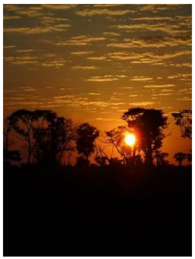
Sunset in the Pantanal

After dinner we decided to do a short night drive along the Fazenda Santa Teresa track and managed to spot another lowland tapir and a pair of crab-eating foxes.