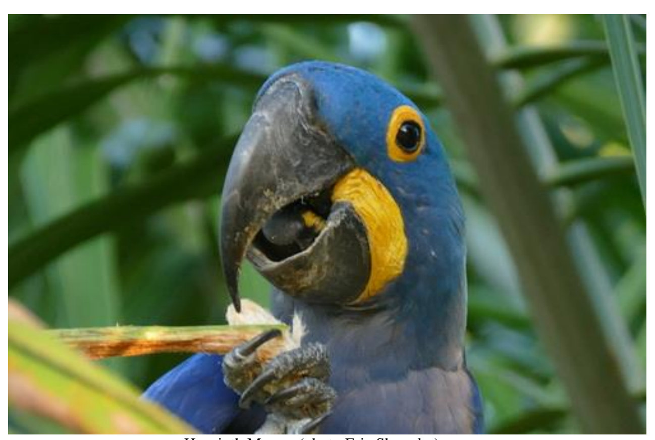
Hyacinth Macaw