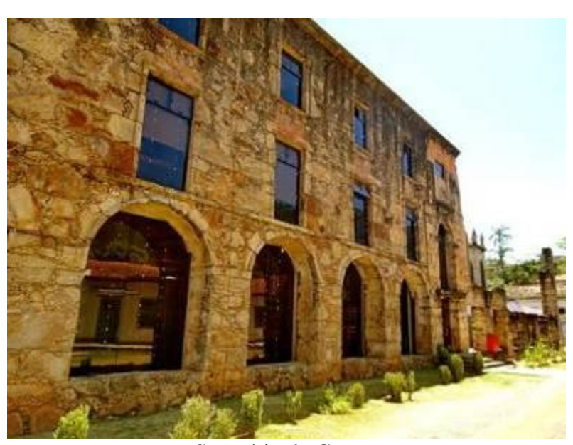
Santuário do Caraça

Since 1982 the monks leave food to attract wolves to come to the entrance of the monastery. But, even though the sightings are almost guaranteed, the animals are still shy and unpredictable, as we have heard about people who actually missed the wolves in Caraça. One can wait for the animals to come just after dinner, which ends by 7.00 p.m., until 12.00 a.m., when the monks close the door of the monastery and turn off the lights.