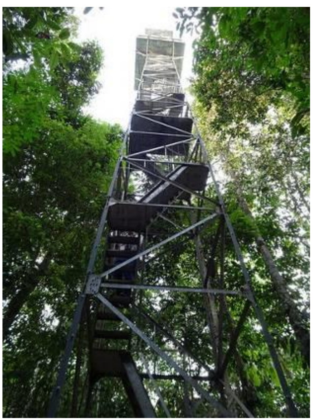
Cristalino Lodge tower

It started to get very hot, and the mist did not vanish. In addition we were constantly bothered by sweat bees and wasps, so we decided to descend and explore the forest trails, hoping to find understory species. We actually did well, because the first bird we found was Banded Antbird . This lovely terrestrial bird must be one of the most attractive species in the family. It keeps maintaining a territory near the bottom of the tower. We also saw Ruddy-tailed Flycatcher and Amazonian Royal Flycatcher . Later we added Plain Xenops , Spix's Woodcreeper , Grey Antwren , Pygmy Antwren , Sclater's Antwren , Rufous-rumped Foliage-gleaner , Squirrel Cuckoo , Long-tailed Woodcreeper , Olivaceous Flatbill , and White-crested Spadebill .