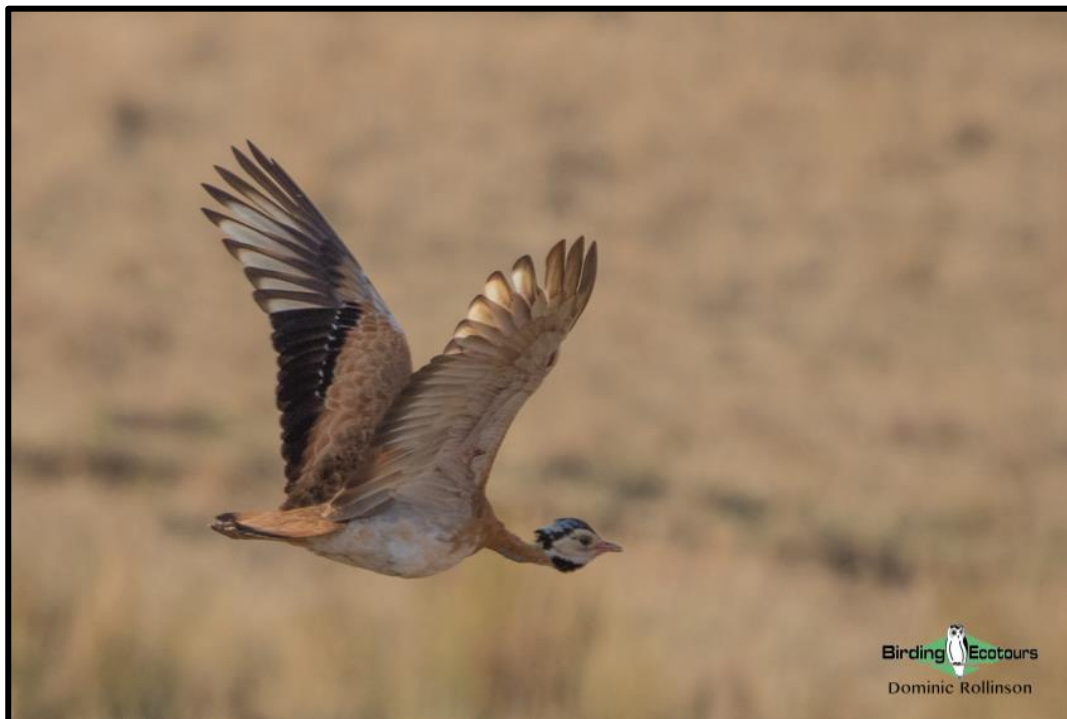
White-bellied Bustard was seen in the drier grasslands near Wakkerstroom.

We went back to our accommodation for lunch and then headed out for the afternoon's birding. It did not take long until we found White-bellied Bustard , which was another of our targets, and then we also came across yet another pair of Secretarybirds . With the light fading we decided to have another try for Blue Korhaan , which we had failed to find earlier. After much searching we eventually had good views of at least three birds in some nearby fields. A great way to end another successful day of birding!