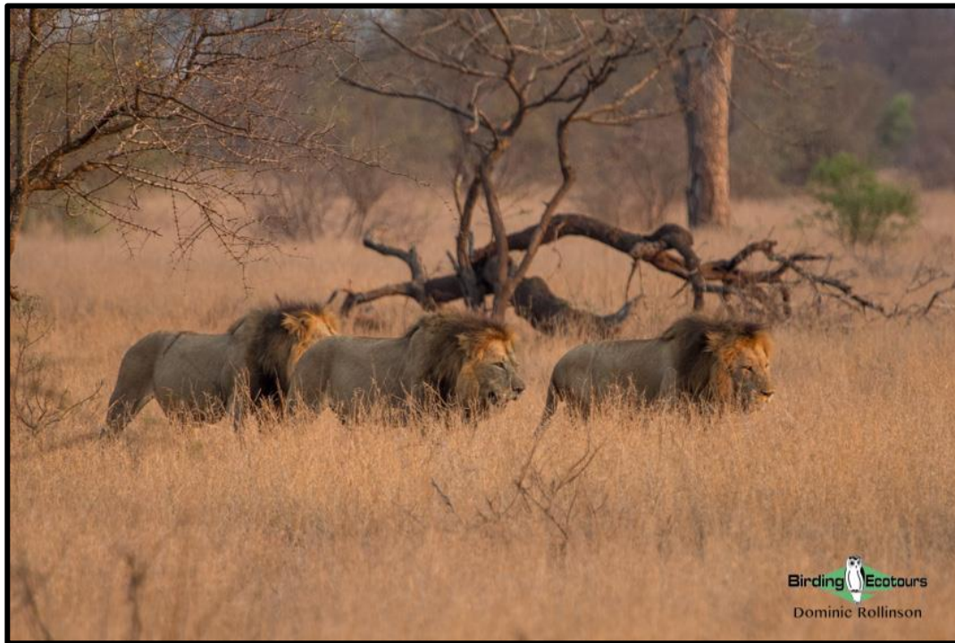
The group of three male Lions seen in Kruger National Park.

Once out of the park we made our way south toward Dullstroom, where we were staying for the night. En route we stopped at the Blyde River Canyon to look for Taita Falcon; however, they were unfortunately not around.