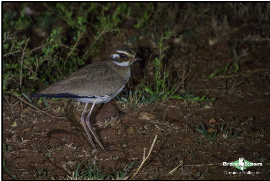
Bronze-winged Courser was seen well on our night drive at Mkhuze Game Reserve.

In the evening we did a night drive, where we added Bronze-winged Courser and African Scops Owl as well as a few more Senegal Lapwings .