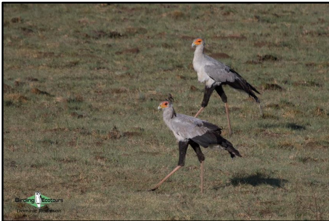
This pair of Secretarybirds were seen in the grasslands below the Sani Pass.