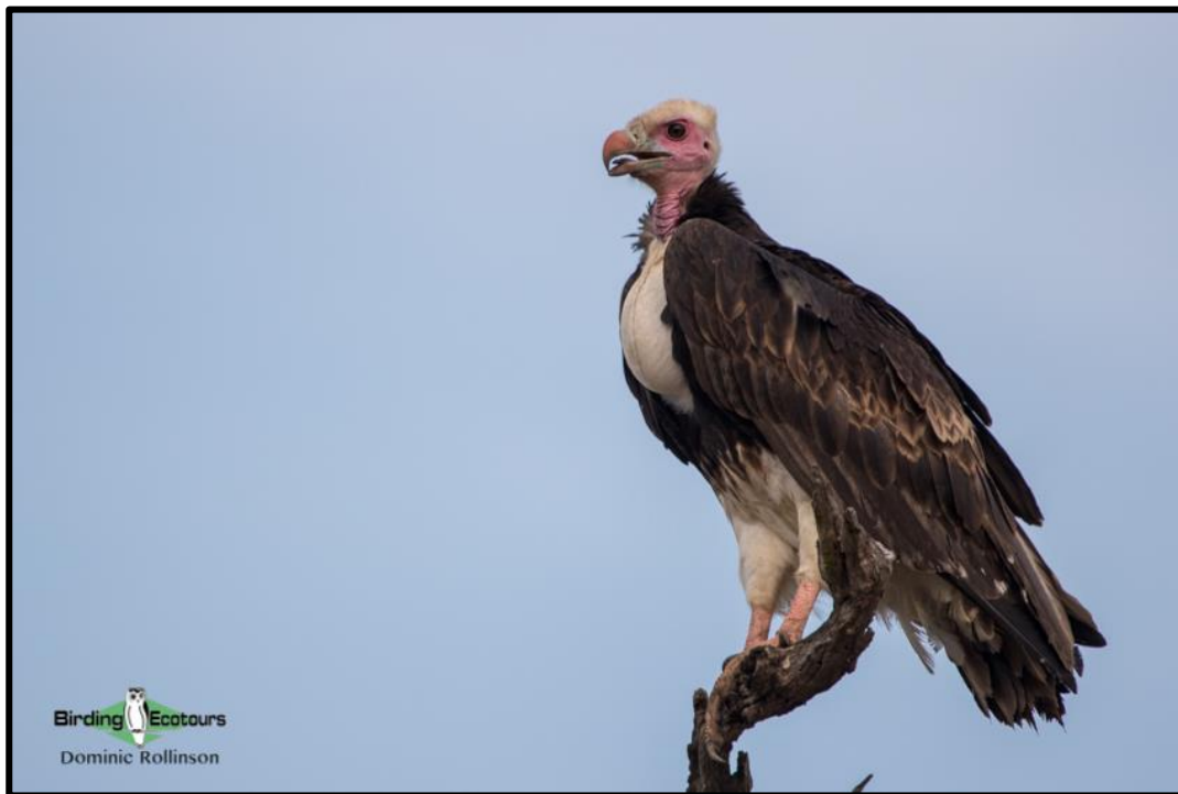
White-headed Vulture, perhaps the most attractive of southern Africa's vultures

With the really hot temperatures we decided to take it easy for a little while before heading out for our afternoon drive from Skukuza Rest Camp. With the temperatures having dropped (slightly) later there was a bit more activity on our drive, and we managed sightings of a pride of Lions as well as White-headed Vulture , Chestnut-backed Sparrow-Lark , Pearl-spotted Owlet , and Lesser Spotted Eagle . A couple of Spotted Hyenas were also seen on our afternoon drive.