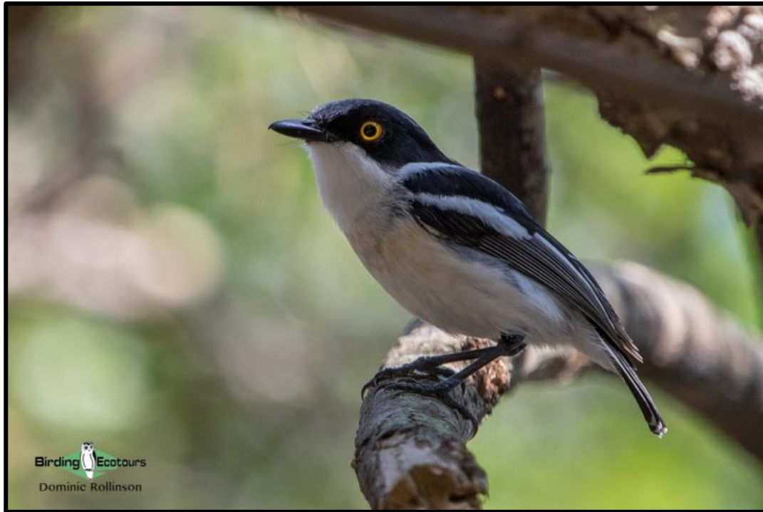
Woodward's Batis was seen well in St Lucia.