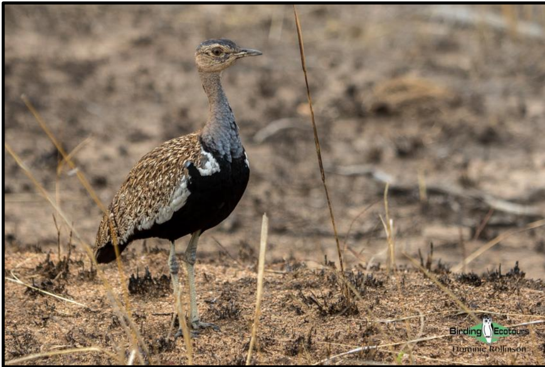
This male Red-crested Korhaan showed really well in Kruger National Park.

We finally had to leave Zaagkuilsdrift and head to the airport, but our luck had not yet run out, as we managed to add Black-faced Waxbill and Greater Kestrel while we were driving out of the area. Thankfully the trip to the airport was uneventful, and it ended a great 18 days around South Africa with many highlights to remember fondly. Thanks to all tour participants for making this a fun and highly successful tour. Looking forward to the next one!