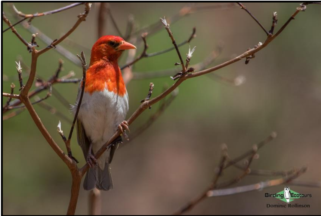
The stunning male Red-headed Weaver was seen at its nest in Mabusa Nature Reserve.

After lunch we continued west to our accommodation in the Zaagkuilsdrift area, where we soon added new birds in the form of White-browed Sparrow-Weaver , Chestnut-vented Warbler , and Northern Black Korhaan .