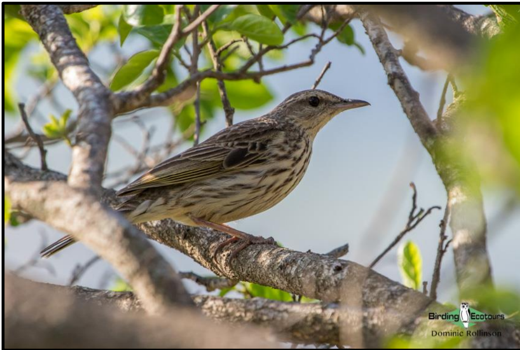
Striped Pipit was seen in the grasslands around Ongoye Forest.

In the afternoon we headed to yet another forest, this time Ongoye Forest, which is the only forest in which the endemic woodwardi subspecies of Green Barbet occurs. This forest is nestled up in the hills above Eshowe, surrounded by beautiful, pristine grassland, and really is one of the more scenic forests in South Africa. It did not take long for us to find Green Barbet along with other forest specials such as Yellow-streaked Greenbul and Brown Scrub Robin . On the way back to the lodge we birded the grassland and bushveld valleys, which were incredibly productive and produced Striped Pipit , Orange-breasted Bushshrike , Yellow-breasted Apalis , Little Bee-eater , Red-faced Mousebird , Black Sparrowhawk , and Diederik Cuckoo .