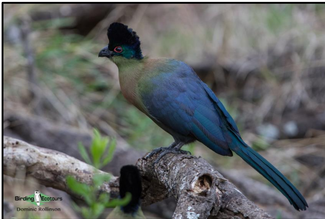
The loud and colorful Purple-crested Turaco showed well in Mkhuze Game Reserve.

During this 18-day tour we managed an impressive bird list of 463 species seen (plus 6 species heard only), including many South African endemics and near-endemics such as Cape Gannet , Southern Bald Ibis , Jackal Buzzard , Grey-winged Francolin , Blue Crane , Blue Korhaan , Northern Black Korhaan , Rudd's , Botha's , Eastern Long-billed , and Large-billed Larks , Bush Blackcap , Cape Parrot , Cape and Sentinel Rock Thrushes , Buff-streaked , Sickle-winged , and Ant-eating Chats , Drakensberg Rockjumper , Ground Woodpecker , Cape Grassbird , Cloud Cisticola , Cape Penduline Tit , Karoo and Kalahari Scrub Robins , Chorister Robin-Chat , Fairy Flycatcher , African Rock , Yellow-breasted , and Mountain Pipits , Layard's and Barratt's Warblers , Grey Tit , Gurney's Sugarbird , Neergaard's , Greater Double-collared , and Southern Double-collared Sunbirds , Swee Waxbill , Forest Canary , Pink-throated Twinspot , and Drakensberg Siskin .