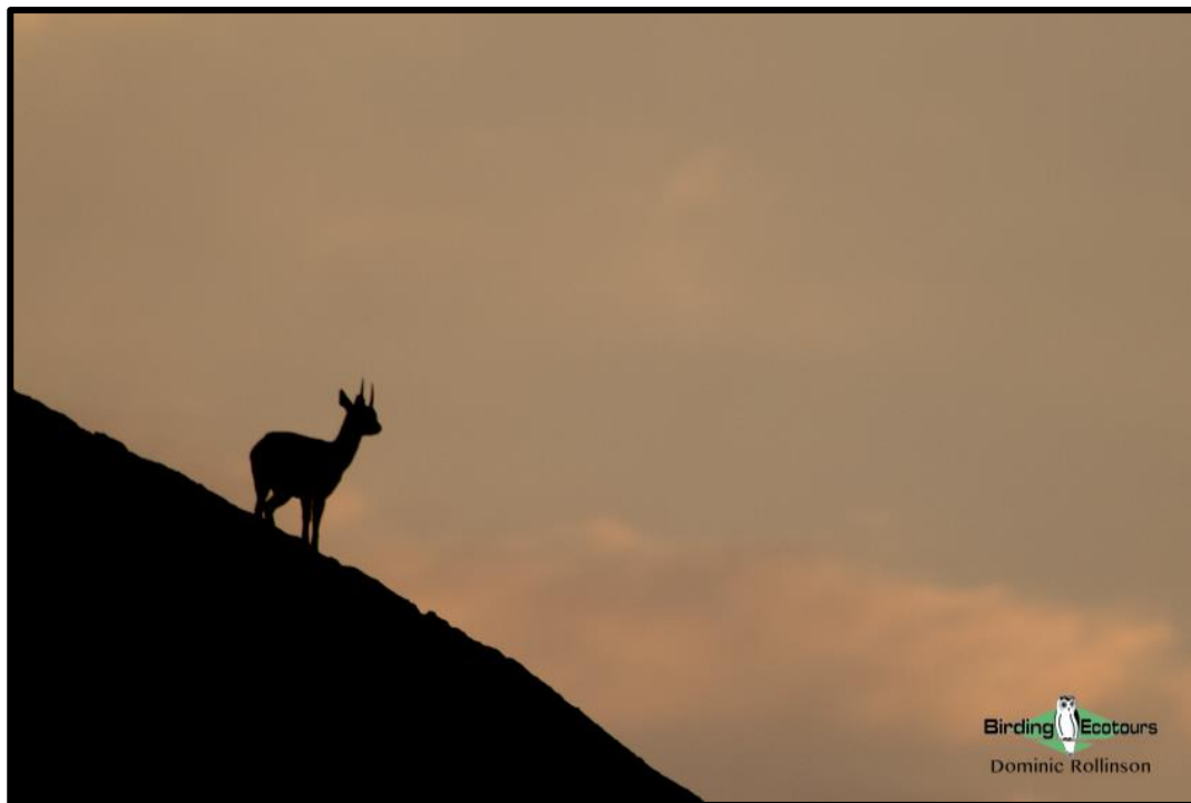
Klipspringer was seen in the granite 'koppies' around Pretoriuskop Rest Camp.

The afternoon drive was a not as productive; however, we still found Spotted Eagle-Owl , Red-faced Cisticola , Grey Go-away-bird , Bushveld Pipit , Jameson's Firefinch , Little Bee-eater , and Mocking Cliff Chat and had great views of a Klipspringer silhouetted against the dramatic sky.