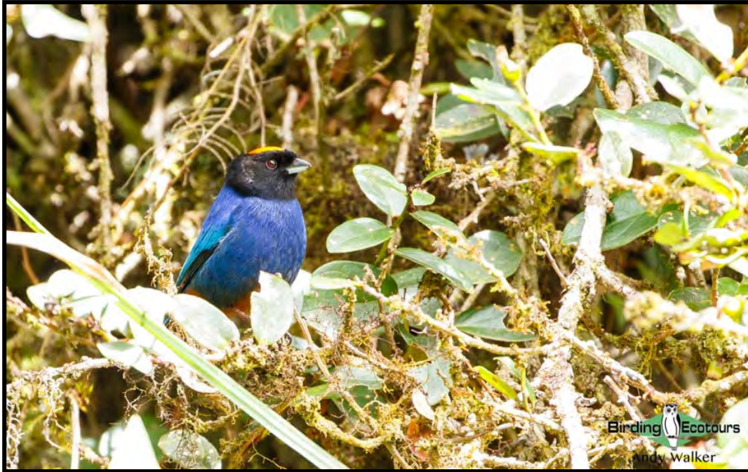
Golden-crowned Tanager — another spectacular tanager species we'll be targeting!