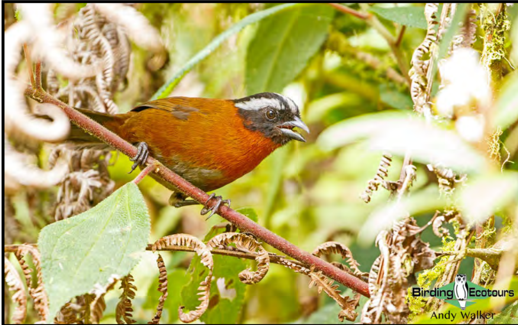
Tanager Finch will be searched for in the ProAves Yellow-eared Parrot Reserve.

On the first part of this exciting Medellín and Bogotá endemics tour, we will arrive in the city of Medellín and immediately explore its surroundings to look for the endemic Red-bellied Grackle and Stiles's Tapaculo as well as the elusive Yellow-headed Manakin . From Medellín we will drive to the picturesque town of Jardín in the southwest region of Antioquia, which will be our base from which to explore the ProAves Yellow-eared Parrot Reserve to look for our main target, the Endangered (BirdLife International) Yellow-eared Parrot . Other target species in the area include Tanager Finch , Rufous Antpitta , Purplish-mantled Tanager , Chestnut-breasted Chlorophonia , and with luck Ocellated Tapaculo and Chestnut-crested Cotinga .