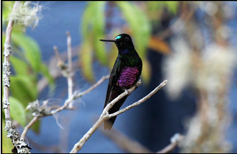
The stunning Blue-throated Starfrontlet is one of our targets at Observatorio de Colibries.

This tour can be combined with our comprehensive The Very Best of Colombia, Part II: Southern Andes, Amazonian Foothills and Llanos and The Very Best of Colombia: Santa Marta, Andes and Choco tours which immediately precede this tour.