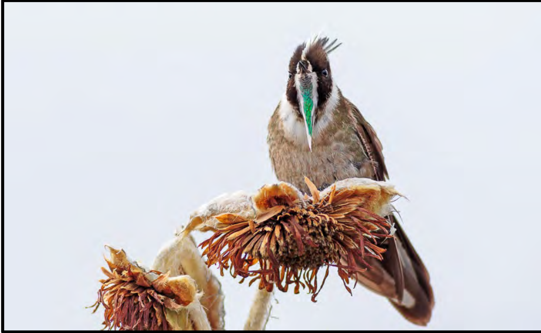
We hope to find the beautiful Green-bearded Helmetcrest near to Bogotá.