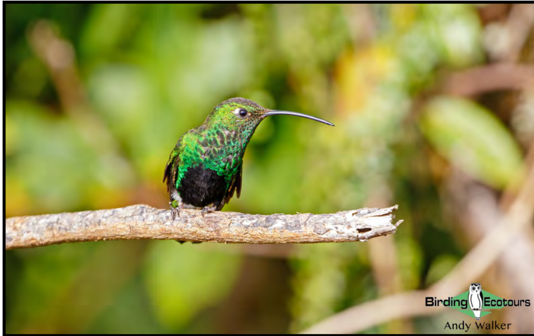
Mountain Velvetbreast — one of the many hummingbird species we should encounter on this tour.