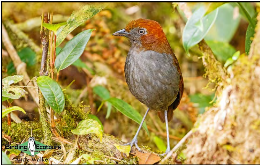
Chestnut-naped Antpitta can be seen in Colombian cloud forests.

Overnight: Los Colores Ecoparque Hotel , Rio Claro