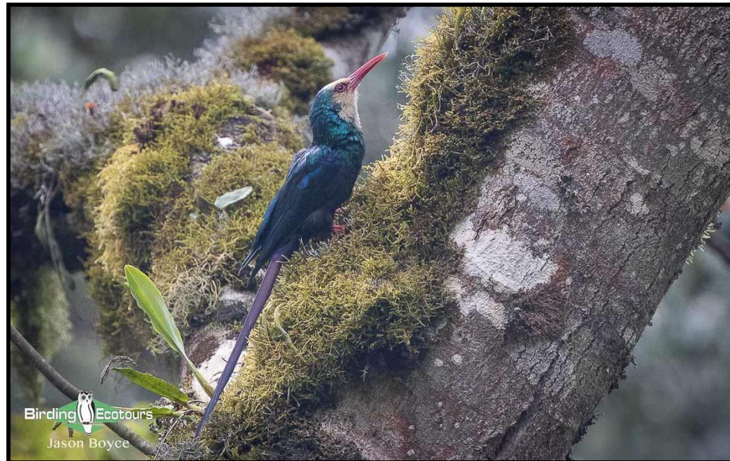
White-headed Wood Hoopoe will be a target in the Bwindi forests.

Ride 4 a Woman, Buhoma Elephant Plains Lodge, Queen Elizabeth NP Kibale Forest Camp, Kibale National Park Kibale Forest Camp, Kibale National Park Masindi Hotel, Masindi Twiga Safari Lodge, near Murchison Falls NP Twiga Safari Lodge, near Murchison Falls NP Twiga Safari Lodge, near Murchison Falls NP Lake Victoria View Guest House, Entebbe