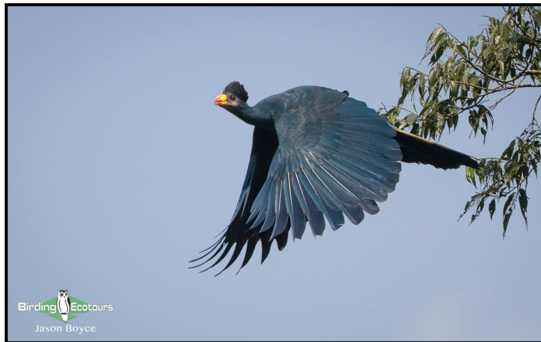
The Great Blue Turaco is magnificent!

Overnight: Lake Victoria View Guest House, Entebbe – Tel. +256-773104660