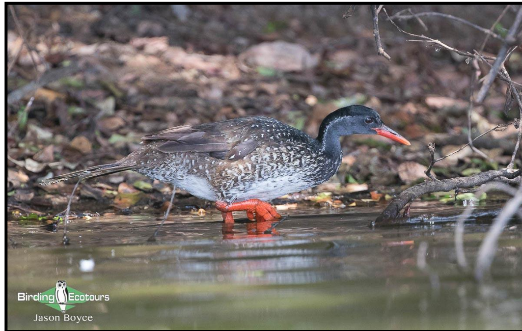
Sometimes we see four or five African Finfoots at Lake Mburo.

a dugout canoe trip into the huge swamp. Swamp Flycatcher is also common here. After seeing Shoebill we continue to our site for Orange Weaver , often seeing Eastern Plantain-eater , Ross's Turaco , large flocks of the noisy Great Blue Turaco (the far-carrying calls of which are one of the characteristic sounds of Uganda), Grey Kestrel , and a very big, beautiful barbet, Double-toothed Barbet . We eventually arrive at Lake Mburo National Park (where we'll spend two nights), which breaks the journey between Entebbe and the southwestern border region of Uganda, where we will look for over 20 Albertine Rift endemics (this, also known as the Western Rift, is a branch of the Great Rift Valley).