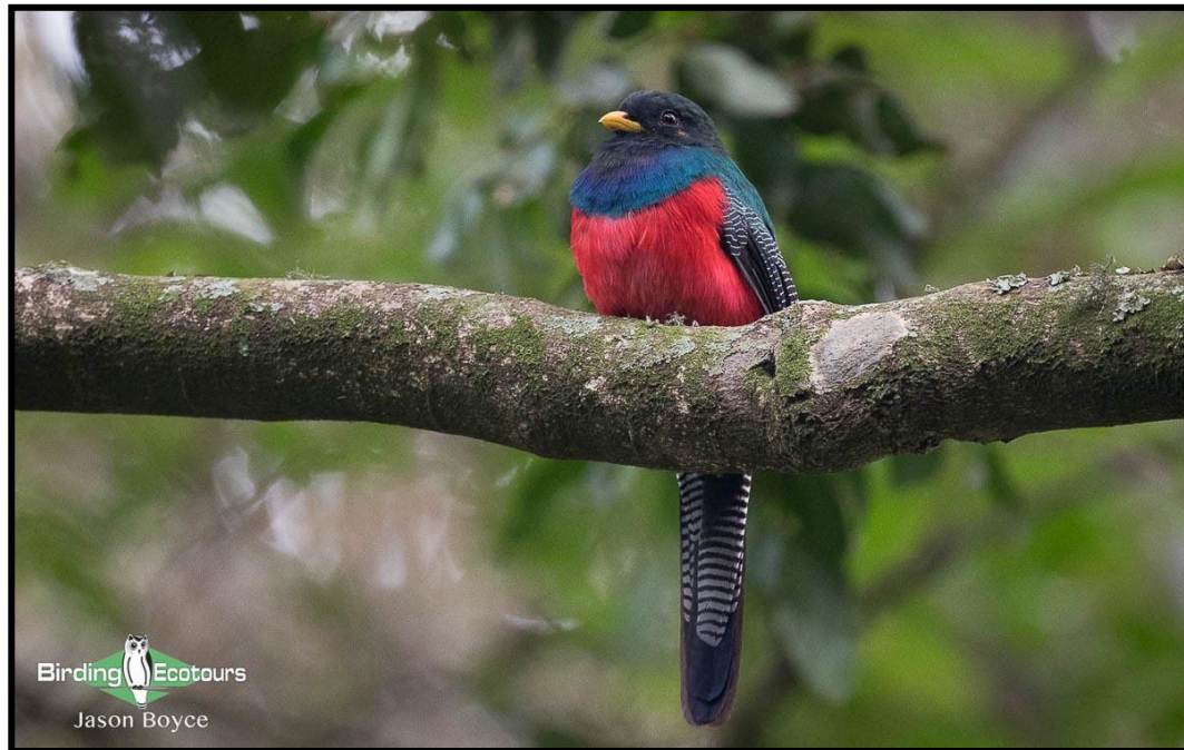
Bar-tailed Trogon is a target at Bwindi.

Overnight: Trekker’s Tavern Cottages, Ruhija – Tel. +256-772455423