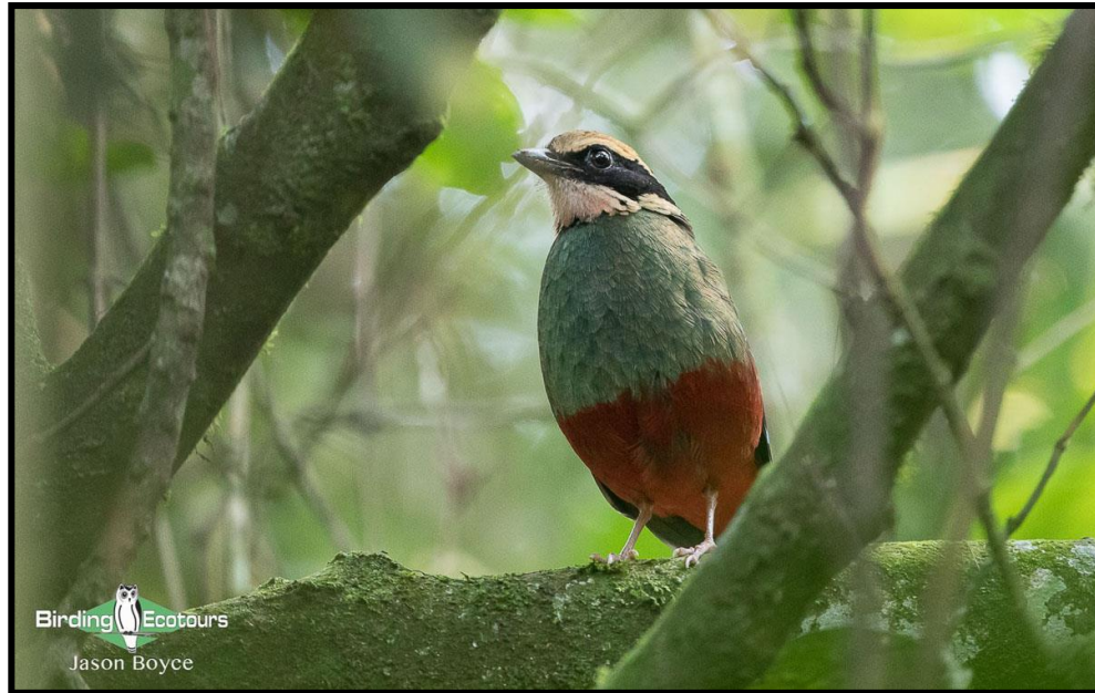
Green-breasted Pitta is one of Africa's most sought-after species.