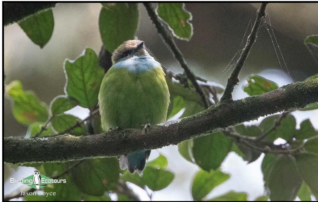
The highly prized Grauer's (African Green) Broadbill .

We travel to one of Africa's richest forests for primates and birds, Bwindi Impenetrable Forest National Park, and start in its high-altitude Ruhija part. We'll start birding the forest-covered hills as soon as we arrive, looking for the beautiful Black Bee-eater and also trying to find Grauer's Swamp Warbler at a roadside site, so that we can reduce the length of the long walk on day 6, this warbler occurring right in the lower reaches of Mubwindi Swamp. Mountain Yellow Warbler might also be seen, nice to compare with Papyrus Yellow Warbler , for which we try another day. A walk most of the way down to this swamp can't be avoided, though, as Grauer's (African Green) Broadbill , one of Africa's most desirable birds, also occurs there.