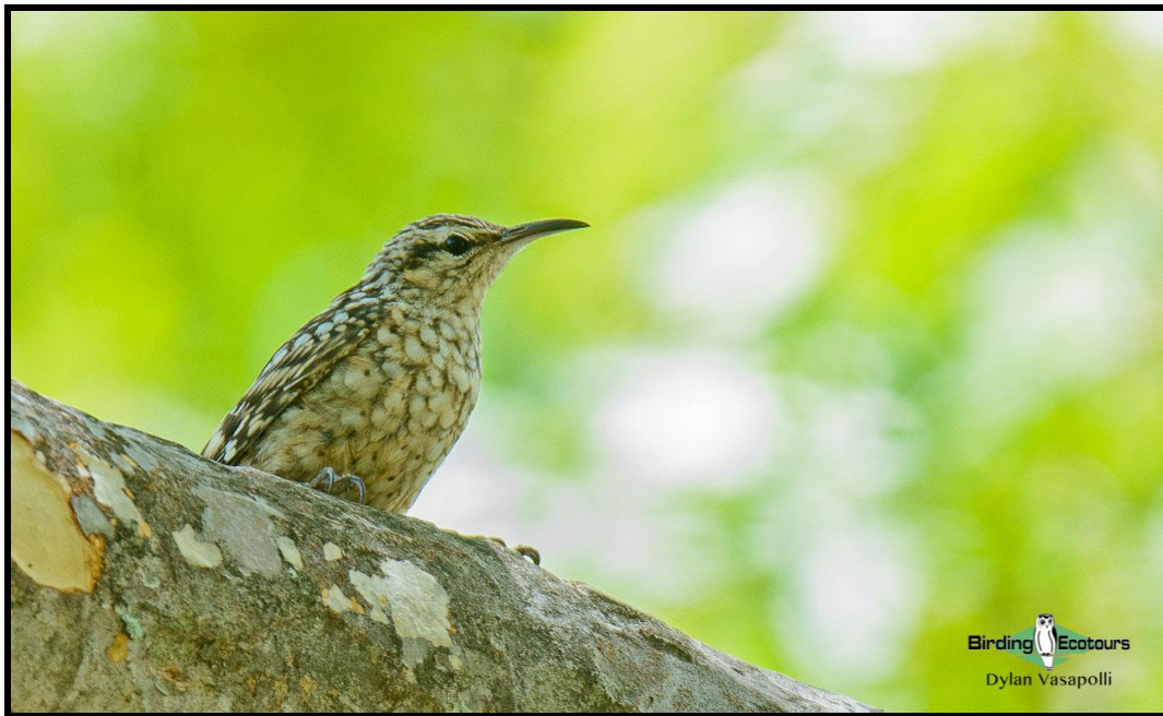
Miombo woodlands around Harare will be searched for African Spotted Creeper .

For those who only have 15 days available and wish to start the tour now, not opting for the Mana Pools National Park pre-tour, that is perfectly OK.