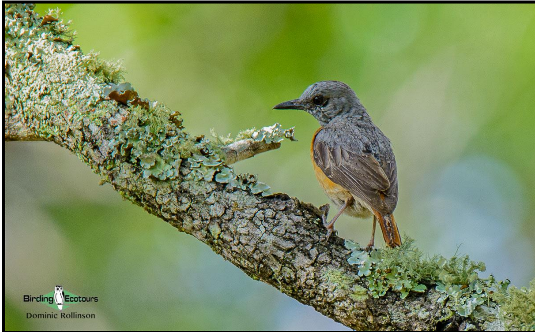
Another miombo specialist, Miombo Rock Thrush .

as the beautiful Yellow-mantled Widow , African Grass Owl , and a plethora of other sought-after birds around Zimbabwe's capital city. We also look for all the miombo woodland endemics – miombo woodland is a habitat found only in south-central Africa, so many of the birds we will see are endemic to Zimbabwe, Mozambique, Zambia, Malawi, Angola and the DRC. We'll look for species such as Miombo Rock Thrush , Miombo Tit , Cinnamon-breasted Tit , Boulder Chat (near-endemic to Zimbabwe), African Spotted Creeper , and all the others.