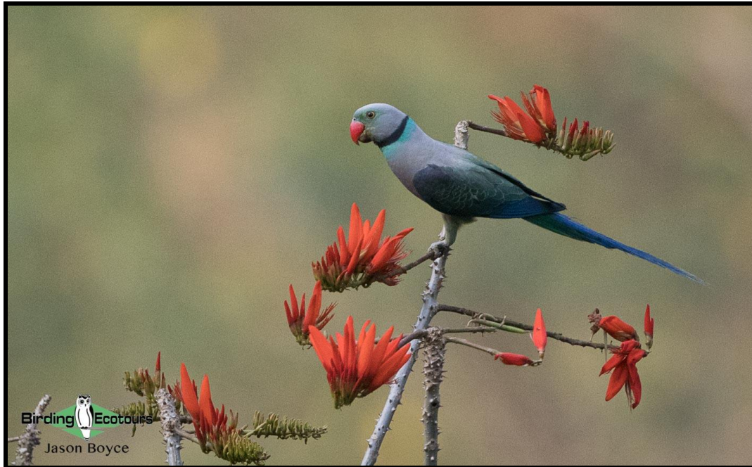
Blue-winged (formerly Malabar) Parakeet is a southern endemic at the northern limit of its range here.