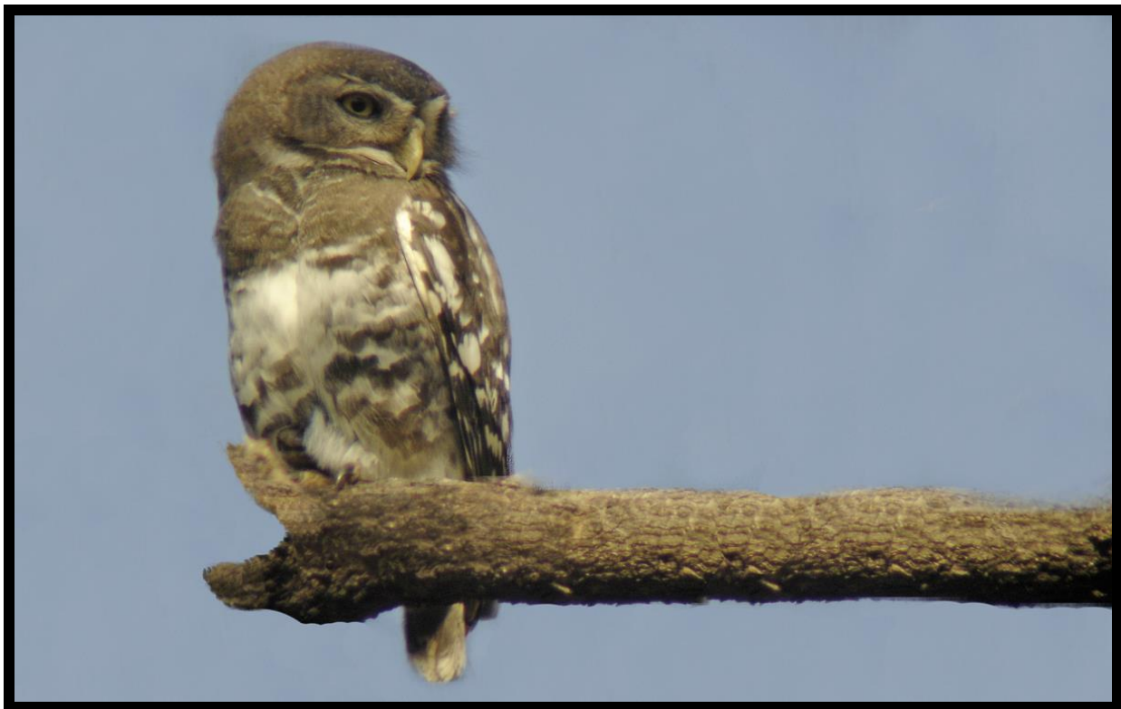
Forest Owlet is the main target of this special extension.

26 FEBRUARY - 1 MARCH 2021 24 - 27 FEBRUARY 2022 23 - 26 FEBRUARY 2023