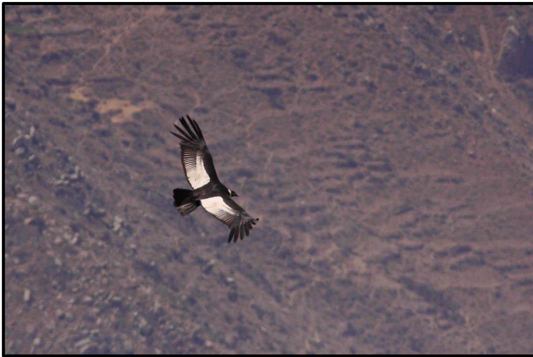
Andean Condor is an iconic bird of the high Andes.