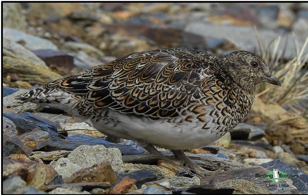
White-bellied Seedsnipe can be seen on the Garibaldi Pass.

This short tour of Tierra del Fuego gives you the opportunity to explore southern Patagonia and the Tierra del Fuego National Park from the world's most southerly city, Ushuaia. Apart from the sheer beauty of the area, including snow-capped peaks, mountain streams, and large beech forests, there is an assortment of important bird species which will be targeted. High on this list will be the huge Magellanic Woodpecker , which inhabits beech forests in Tierra del Fuego National Park, as well as White-bellied Seedsnipe , which is found above the tree line on a nearby mountain pass. Other range-restricted species which we hope to find include Flying Steamer Duck , Andean Goose , Yellow-bridled Finch , and Patagonian Sierra Finch .