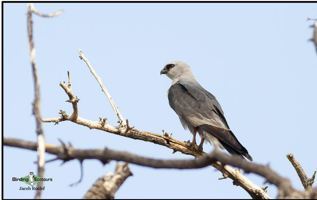
The stunning Mississippi Kite

We decided to give Mt. Lemmon one more try, and this time it sure didn't disappoint! Back at Rose Canyon Lake we waited for only about 15 minutes before a raptor started calling. The Common Black Hawk was soaring around and then perched up in a tree for us for over 10 minutes while we watched in the scope. A true highlight bird of the trip! We then continued up the mountain, where we encountered an amazing mixed flock with multiple Red-faced Warblers , Hermit Warbler , Townsend's Warbler , and Mountain Chickadee . We couldn't help but celebrate a little during a late lunch before making the few hours' drive back to Phoenix for the final night of the trip.