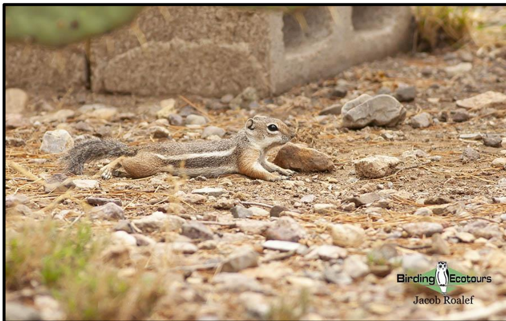
The adorable Harris's Antelope Squirrel waiting for its turn at some bird seed.

From here we began our journey up the mountain, where we enjoyed lunch at a campground with a few Yellow-eyed Juncos . After lunch we birded along the road between Onion Saddle and Barefoot junction, which is loaded with conifers. Right away a few Red Crossbills were getting a drink from a small puddle in the road. After a few hours of searching, we came across a few mixed flocks that were absolutely loaded with different species, including Hairy Woodpecker , Olive Warbler , Brown Creeper , Bridled Titmouse , Grace's Warbler , Black-throated Grey Warbler , Painted Redstart , Pygmy Nuthatch , House Wren , and Bushtit . Our last stop of the day was the feeder station at the George Walker House in Paradise. Unfortunately our time here was cut short due to an incoming thunderstorm. We decided to head back down the canyon before any potential flooding occurred.