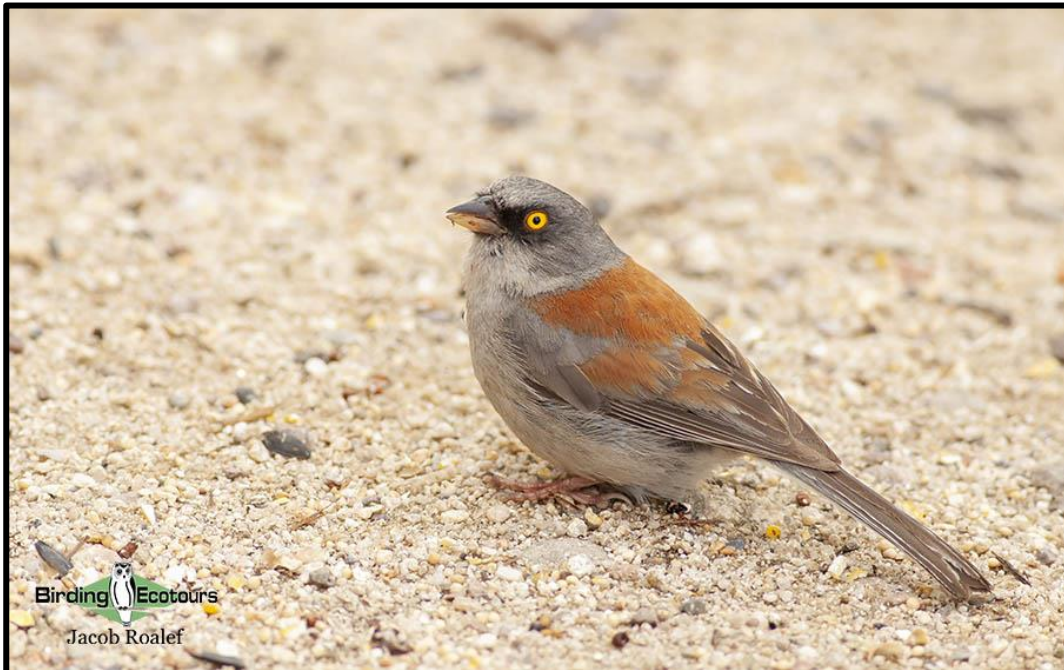
We were treated to great views of the strange-looking Yellow-eyed Junco .