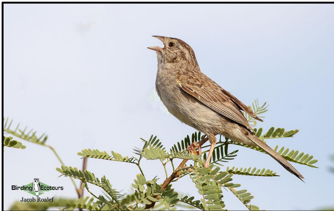
One of the many singing Cassin's Sparrows

The morning was spent in the expansive grassland habitat of Las Cienegas National Conservation Area. Right away we were treated to close views of a singing Cassin's Sparrow , and in the distance a Swainson's Hawk was perched in a small tree. The immediate success upon entering this grassland had been a sign, and the hits at Las Cienegas just kept coming with Eastern Meadowlark , Grasshopper Sparrow , Botteri's Sparrow , over 20 more Cassin's Sparrows , Cassin's Kingbird , American Kestrel , and Lark Sparrow . A stop at the small cattle ponds netted us a few Lucy's Warblers , Black Phoebe , and Brown-crested Flycatcher . Finally we made it to the colony of Black-tailed Prairie Dog , a species extirpated from the state and currently undergoing reintroduction programs. Joining these fun mammals was a whole family of Burrowing Owls .