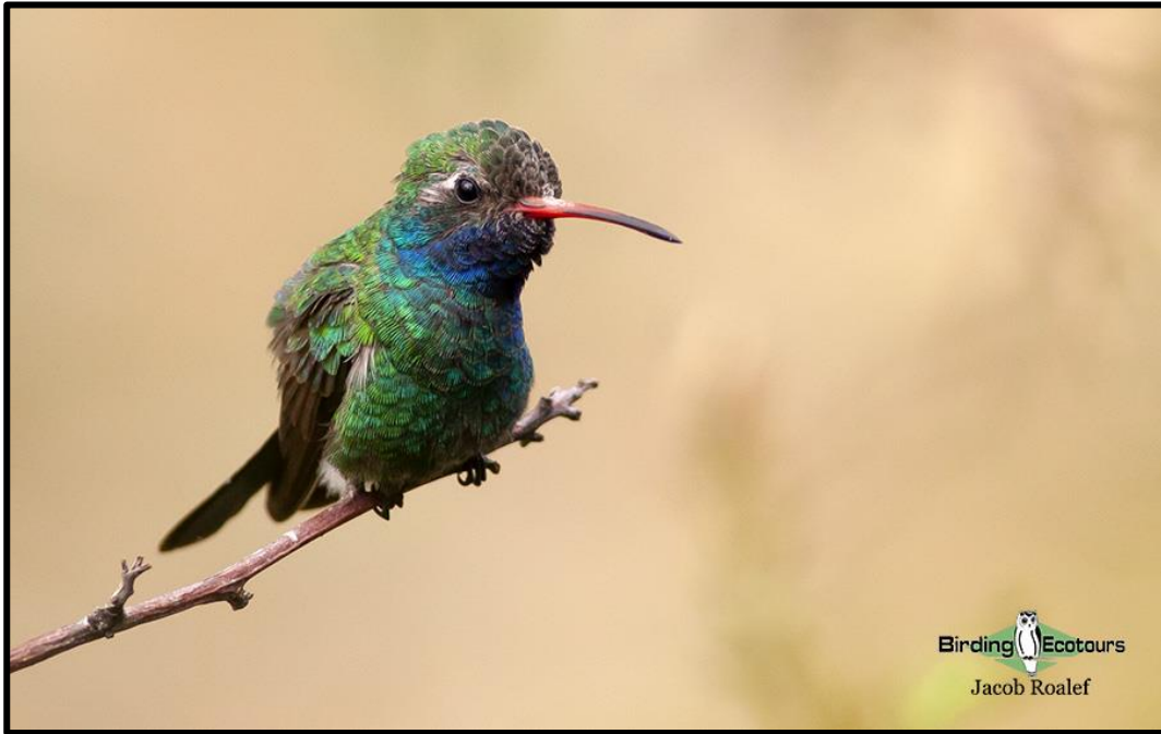
The colors on this Broad-billed Hummingbird really shimmer in the light.

Flycatcher , and a pair of Black-tailed Gnatcatchers . A great morning to finish a great tour! We then transferred to the airport and said our goodbyes and until next time.