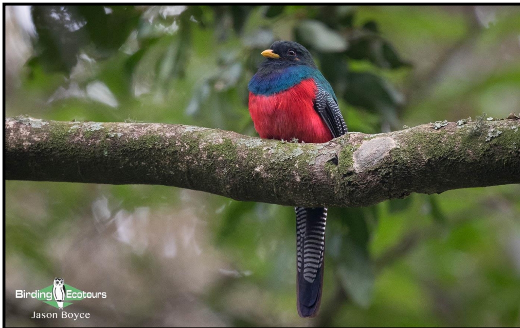
The fascinating and beautiful Bar-tailed Trogon can be seen in the forests around Ruhija.

Overnight: Trekkers Tavern Cottages, Ruhija