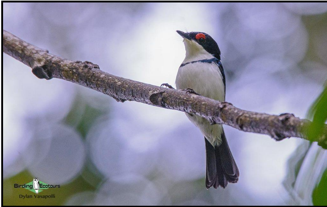
Black-throated Wattle-eye can be seen in the coastal forest near Stanger.

Purple Swamphen, African Rail and African Marsh Harrier. In the surrounding reedbeds we may come across Southern Brown-throated and Eastern Golden Weaver, Rufous-winged Cisticola and Sedge Warbler . During summer the place comes alive with migrants including Bailon's Crake and Spotted Crakes, Western Yellow Wagtail, and Lesser Moorhen . In the surrounding scrub and grasslands Fan-tailed Widowbird, Black-throated Wattle-eye, Kurrichane Thrush, Red-capped Robin-Chat and Woolly-necked Stork may all be seen.