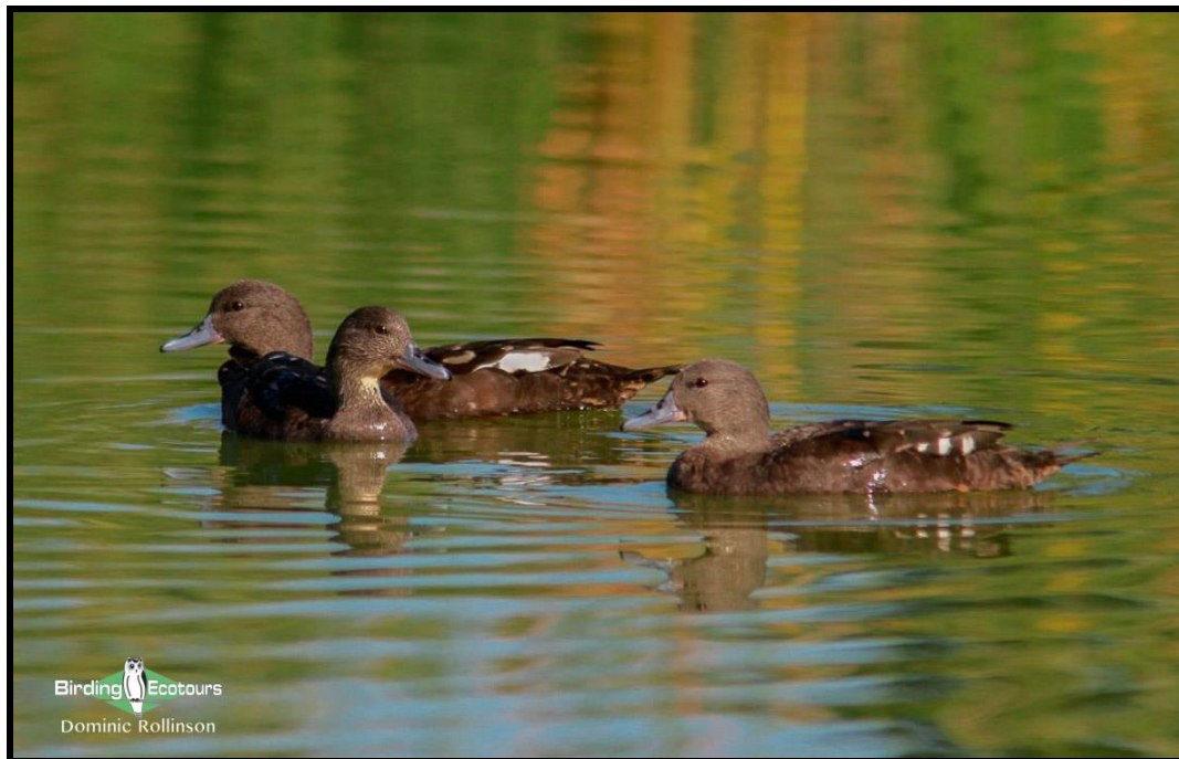
African Black Duck can be seen at Shongweni Dam.

Sitting at a slightly higher altitude, Shongweni Resources Reserve offers a different mix of species to the previous destination. Shongweni Dam is surrounded by thick forest and bushveld where some of the following may be observed; Crowned and Trumpeter Hornbills, Southern and Black-crowned Tchagra, Red-throated Wryneck, Black Cuckooshrike, Narina Trogon, Grey and Swee Waxbills as well as four species of bushshrikes (Olive, Orange-breasted, Grey-headed and Gorgeous) . Along the edge of the dam we will keep a look out for Giant Kingfisher, Mountain Wagtail, African Black Duck and Black Stork .