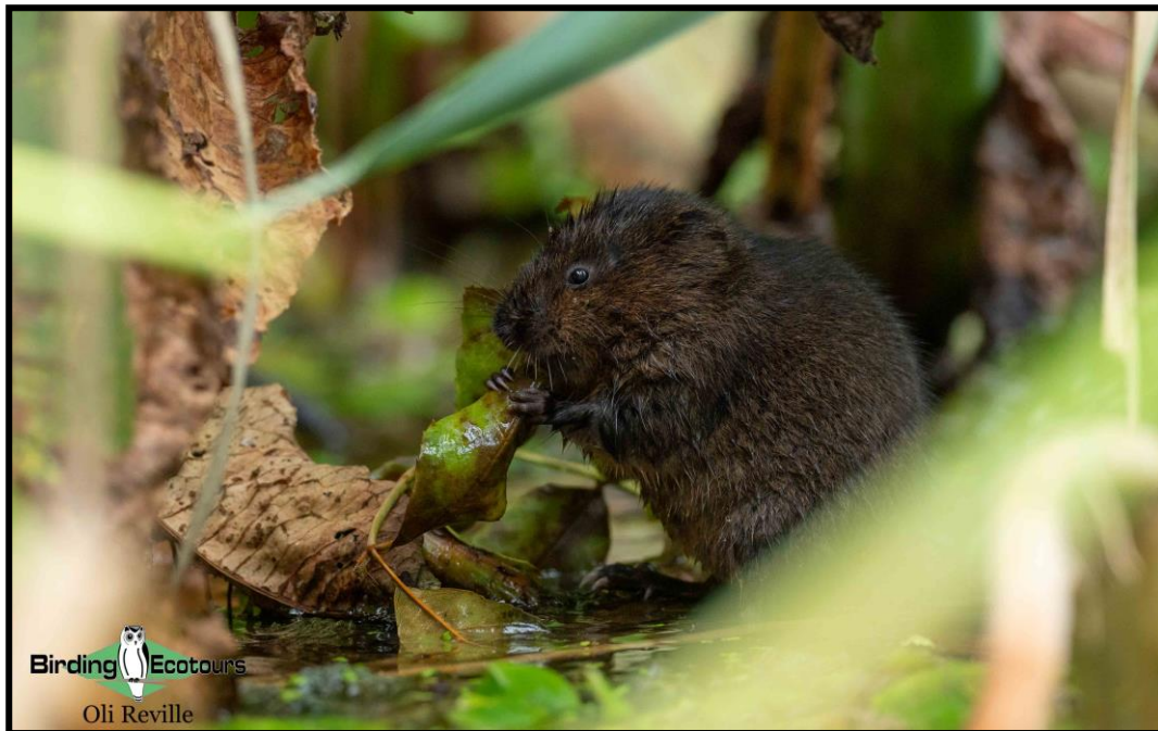
Strumpshaw Fen is a fantastic reserve for spotting the shy European Water Vole .

The feeders around the visitor center will be our first area of focus. Here we will come across typical garden birds such as European Robin , Dunnock , Common Blackbird , Great Tit , and Common Chaffinch . However, these feeders can attract scarcer species such as Eurasian Bullfinch , Eurasian Nuthatch , and Great Spotted Woodpecker which often provide particularly good views. The trees around the visitor center are a good spot to look for migrant warblers such as Common Chiffchaff , Willow Warbler , and Eurasian Blackcap while the reedbeds here will be alive with the sound of Cetti's Warbler , Sedge Warbler , Eurasian Reed Warbler , and Common Grasshopper Warbler .