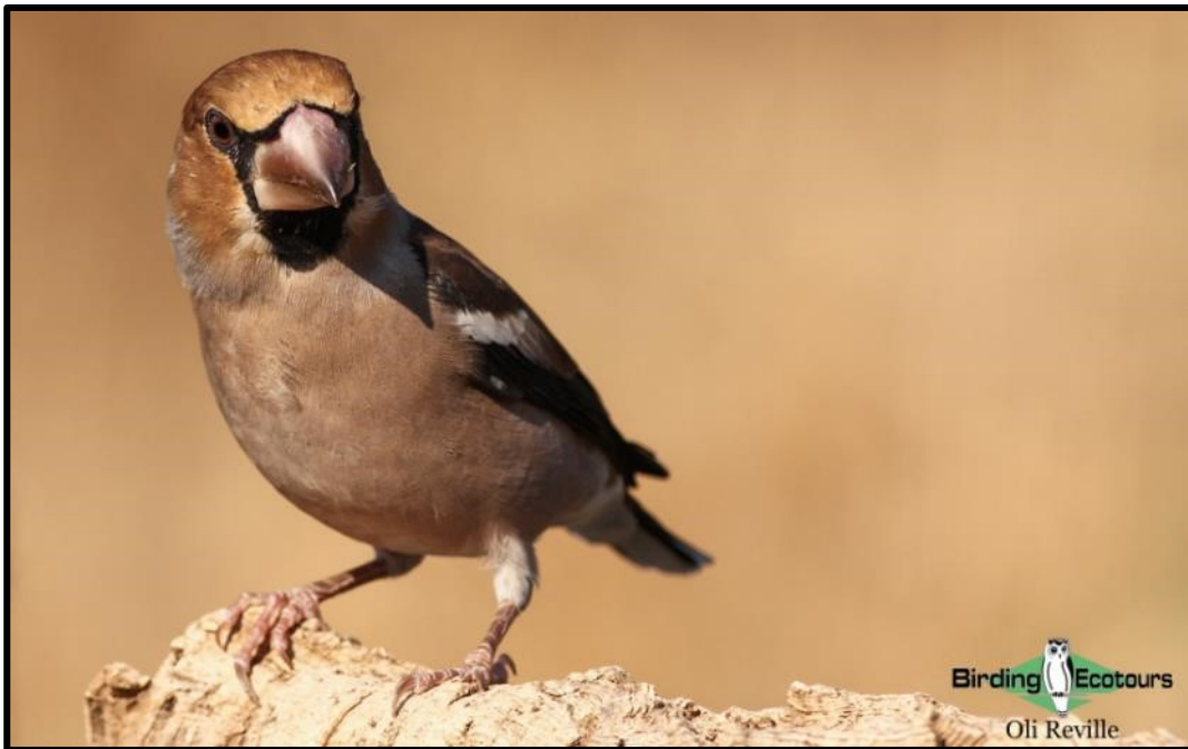
The mighty Hawfinch will be yet another target in the forests of northern Greece.

While around Lake Kerkini we will make a trip to nearby Mount Pangaio (weather permitting) to try and find some great alpine species. This will be our only high-altitude birding on the tour and