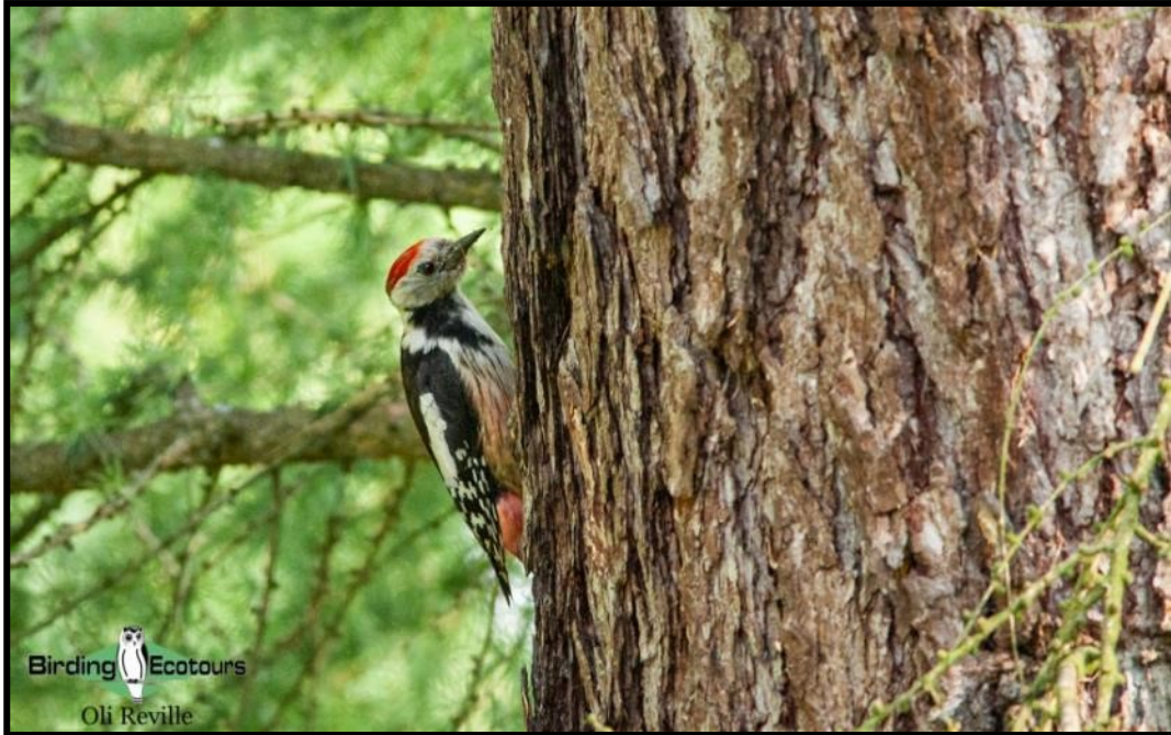
Middle Spotted Woodpecker can be seen in the forests of northern Greece.