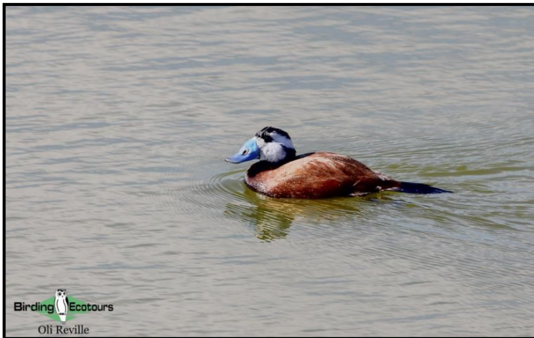
Lake Vistonis is a reliable location for finding the Endangered White-headed Duck ( BirdLife International ).

The adjacent Lake Vistonis is a vital migratory staging post and wintering area which sees vast numbers of birds arrive during October. Here we can find Common Pochard , Eurasian Coot ,