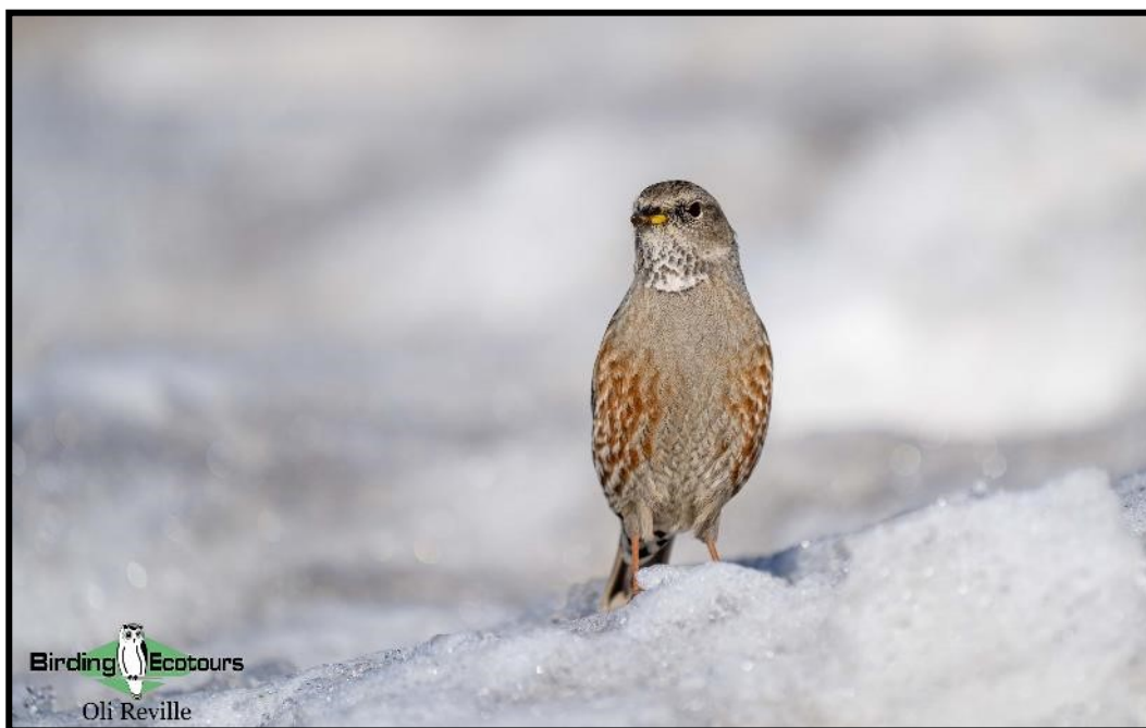
The upland areas of Mount Pangaio are home to the striking Alpine Accentor .

The surrounding forest is home to six woodpecker species, including Syrian Woodpecker , Grey-headed Woodpecker , and Middle Spotted Woodpecker . If the weather allows, we will also explore the nearby Mount Pangaio in search of higher-altitude species such as Alpine Accentor , Alpine Chough , Horned Lark , Rock Partridge , Water Pipit , and Black Redstart .