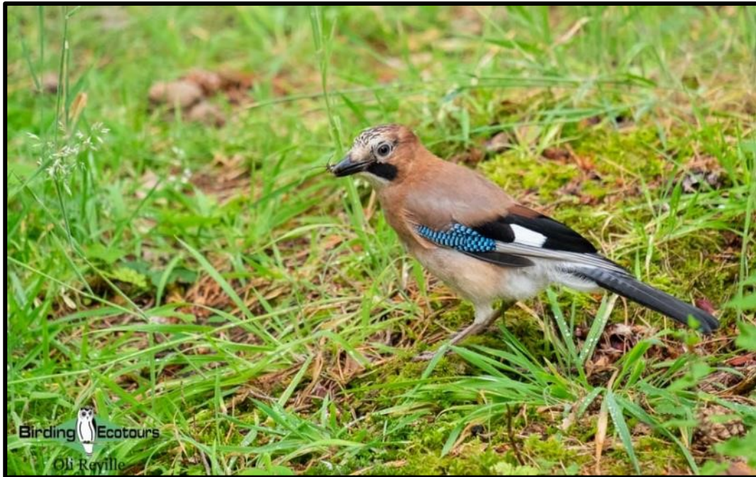
The exotic-looking Eurasian Jay putting on a great show!