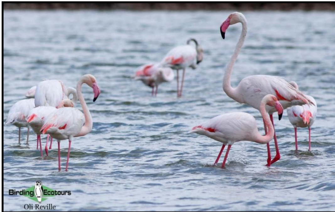
Greece holds a healthy population of the gorgeous Greater Flamingo .

The lake itself also holds high numbers of wintering waterbirds and wildfowl, including Great White Pelican , White Stork , Great (White) Egret , Eurasian Spoonbill , Great Cormorant , Greater Flamingo , Common Pochard , Ferruginous Duck , Great Crested Grebe , Black-headed Gull , Glossy Ibis , and the Vulnerable ( BirdLife International ) Lesser White-fronted Goose – this species is, unfortunately, in rapid decline.