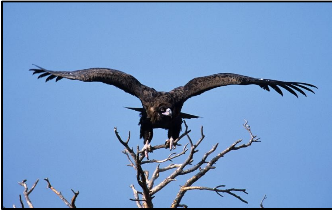
Cinereous Vulture is one of the vulture species we hope to see well at the vulture feeding station!

in the region means that the vultures here can struggle to find food. Since 1987 the Dadia Forest National Park has run a supplementary feeding program on a weekly basis. The feeding is done with animals that have already died and plays a vital role in maintaining vulture populations in the area. As a result of this, we can get up close and personal with both Cinereous Vulture and Griffon Vulture while at the feeding station, we may also get lucky and have a visit from the Endangered ( BirdLife International ) Egyptian Vulture .