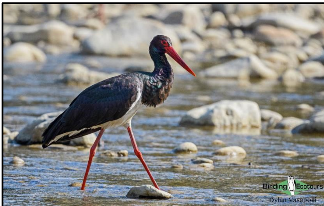
Black Stork is an elegant species and always a thrill to observe.