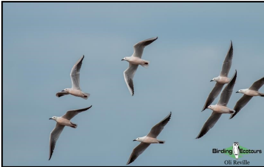
The coastal deltas are home to large numbers of the striking Slender-billed Gull .

during October. The range of birds in the area is huge and we will come across multiple species of shorebirds (wader), waterfowl, passerines, gulls, terns, and birds of prey. We will also explore the inland areas around the Nestos Gorge for Rock Partridge , Rock Bunting , Cirl Bunting , and Sombre Tit and we may get lucky in spotting the striking Golden Jackal , a species of canid whose range spreads from Eastern Europe all the way to Southeast Asia. We will finish up this tour by driving back to Thessaloniki, where the tour ends, and you can catch a flight back home.