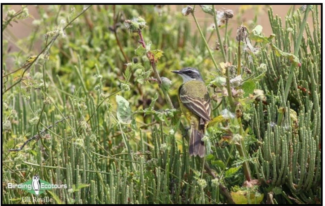
The grazing pastures around Tarifa are an excellent staging area for migrating Western Yellow Wagtail . The Iberian subspecies (iberiae) is by far the most common here.