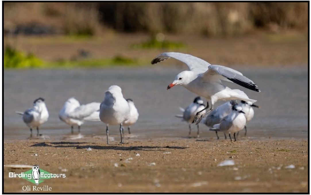
Los Lances is an excellent spot to find Audouin's Gull (foreground) and Sandwich Tern.

Some of the more numerous species here include Spotless Starling , European Stonechat , Zitting Cisticola , Tawny Pipit , Corn Bunting , Crested Lark , and the Iberian subspecies ( iberiae ) of Western Yellow Wagtail . Overhead we may see migrating raptors as they climb on thermals before drifting south, and over to <u>Africa</u>, an exciting prelude for what is to come on this tour.