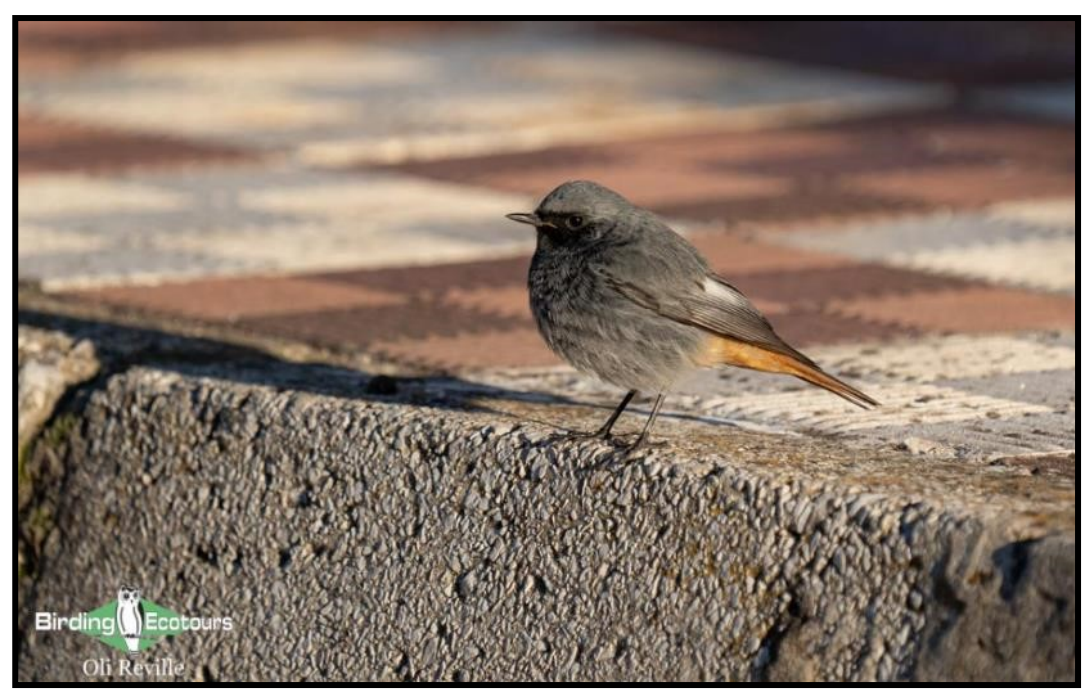
Birding in the beautiful town of Ronda can be extremely rewarding. Fall sees the arrival of the striking Black Redstart from their mountain breeding grounds; after spending the summer in the wilderness they then become garden birds!