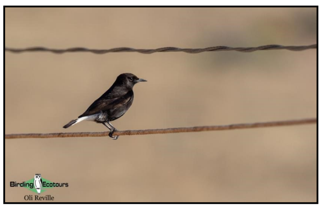
The striking Black Wheatear is one of the star species of the Sierra Grazalema Natural Park