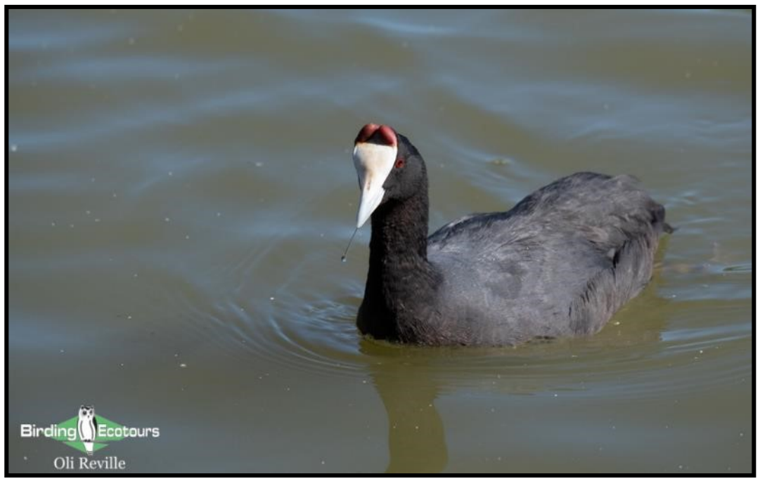
The Guadalquivir area is a stronghold for the Critically Endangered (in Spain), Red-knobbed Coot.