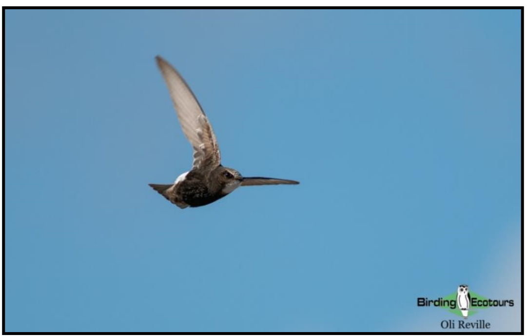
We will visit the town of Chipiona, home to Europe's only colony of Little Swift.