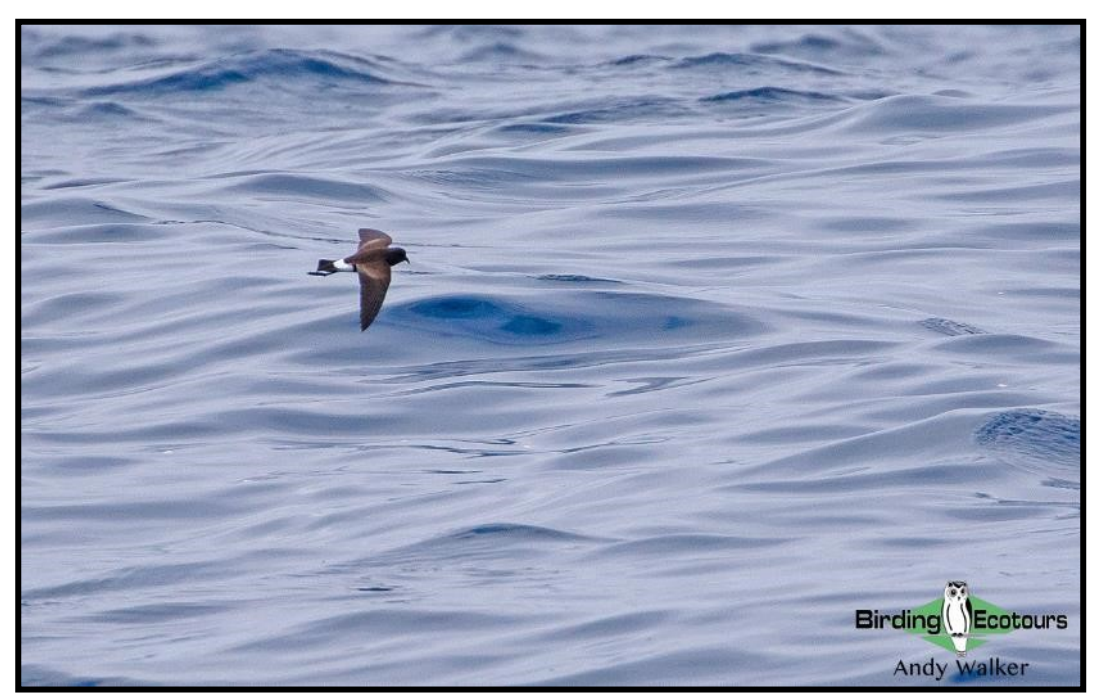
The Bay of Cadiz is an excellent place to look for the rare Wilson's Storm Petrel.