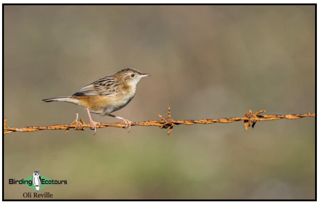
The tiny Zitting Cisticola (sometimes known as Fan-tailed Warbler), is often heard before it is seen, its "zit" call filling the air as the bird takes flight.