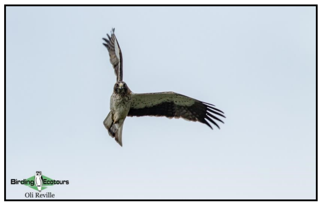
The skies above the Straits of Gibraltar can be filled with raptors, like this Booted Eagle .

We then head south to the Straits of Gibraltar to enjoy the best of the fall bird migration. We begin in the western straits and nearby Atlantic coast looking for shorebirds on the famous Los Lances beach, part of the wider <u>Estrecho de Gibraltar IBA</u>, where we also have a chance of the rare Audouin's Gull . The pastures here are excellent for migrant passerines and it is here we can also witness the raptor migration at its best. At any moment, the skies can be full of raptors and storks, and the visible migration is a truly breathtaking experience. We will also visit nearby sites for the rare <u>Mediterranean Chameleon</u> plus the chance of the Critically Endangered (<u>BirdLife International</u>) Rüppell's Vulture , a rare vagrant from <u>Africa</u>.