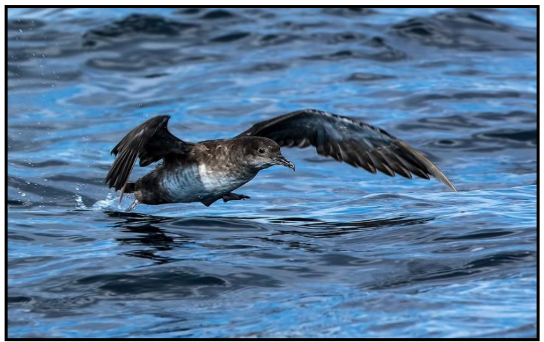
Our pelagic trip will give us excellent views of seabirds like Balearic Shearwater.