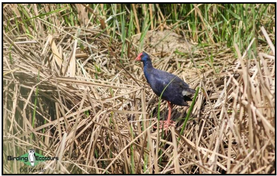
The vast reedbeds and wetlands here are home to a huge number of Western Swamphen . The area is vital to this species in southern Spain.

The protected area of <u>Brazo del Este</u>, near the city of Seville, is a superb habitat for shorebirds and waterbirds, with large numbers of Northern Lapwing , Pied Avocet , Mallard and Northern Shoveler gathering here in fall. The area is also superb for passerines such as Eurasian Penduline Tit , Savi's Warbler , and Great Reed Warbler . We also stand a chance of adding some elusive crakes to our list with Spotted Crake , Little Crake , and Baillon's Crake all present here.