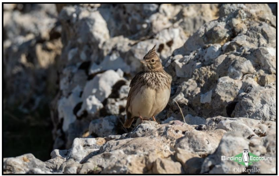
The open areas of the Alcornocales Natural Park are a good place to find the musical Thekla's Lark. Its iconic flight call is often what gives this bird away.

Today we will visit <u>Los Alcornocales Natural Park</u>, sometimes known as the Mediterranean jungle. This vast cork oak forest is famous for supplying the world with cork for wine bottles for many hundreds of years, but it is also a fabulous spot for birding. The dense forest here holds good populations of resident Short-toed Treecreeper, Common Firecrest, Great Tit, Eurasian Blue Tit, Eurasian Jay, and Eurasian Nuthatch, while the more open areas are good spots for Thekla's Lark, Iberian Grey Shrike, Woodlark, Rock Bunting, Cirl Bunting, Dartford Warbler, and Sardinian Warbler.