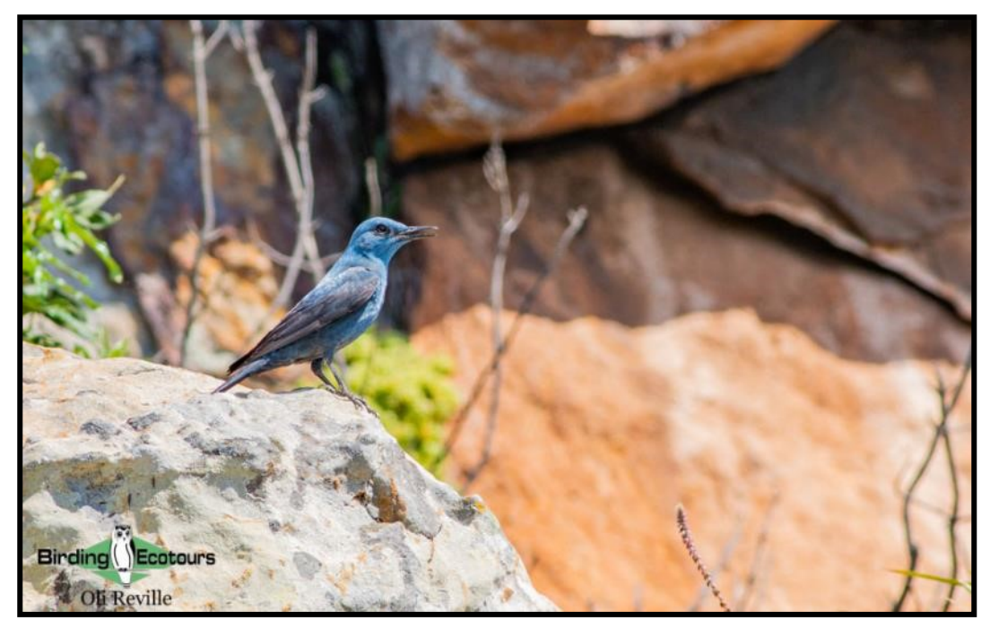
Blue Rock Thrush is a common bird of mountain areas in Andalusia, even within the town of Ronda .

Spain's bird list currently stands at <u>659 species</u> (following <u>International Ornithological Congress</u> (IOC) v10.2 taxonomy as of January 2021), one of the highest single country lists in the Western Palearctic. The region of Andalusia actually accounts for an impressive <u>484 of these species</u>. With such a range of birds on offer, we will maximize our chances of seeing as many as possible with a combination of expert guides, a comprehensive itinerary visiting the best places to go birding in Andalusia, and visiting at the best time of year. These all combine to make for a wonderful birdwatching holiday.