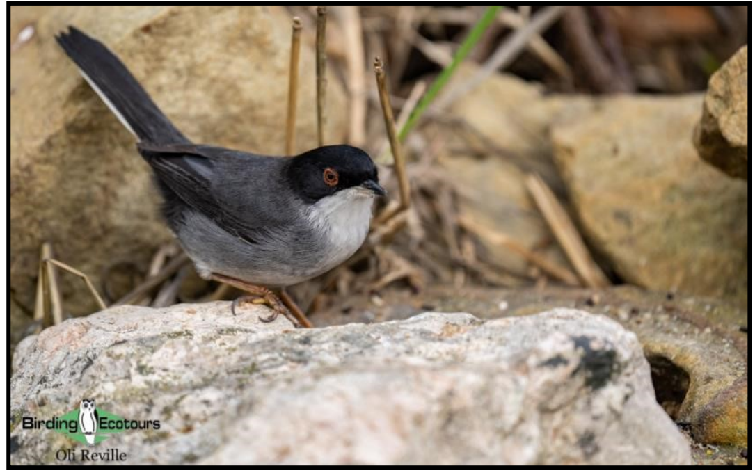
The limestone mountains around Ronda are home to the striking Sardinian Warbler.

The mountains here are also dotted with "Pueblos Blancos" (classically white-painted villages of the local Spanish style) such as Casares, Gaucin, and Algatocin. These beautiful villages are tucked into mountain valleys and the whole area is as atmospheric as it is productive for wildlife. We will explore the habitats around these villages and enjoy species such as European Stonechat , Sardinian Warbler , Corn Bunting , Rock Bunting , Cirl Bunting , Coal Tit , Eurasian Crag Martin , Blue Rock Thrush , Griffon Vulture , and Bonelli's Eagle .