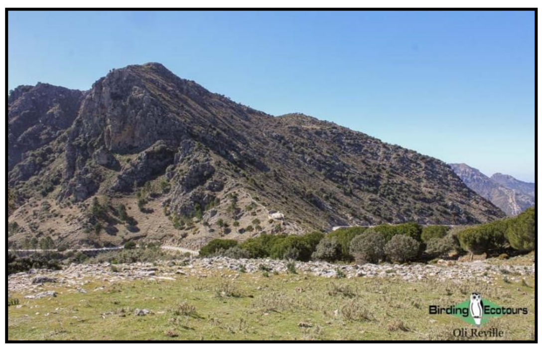
Our tour will see us visit the beautiful mountains of the Sierra Grazalema National Park.

Returning to the main straits for some seawatching, with the Riff Mountains of Northern <u>Africa</u> as a backdrop, offers the chance of observing migrating seabirds while overhead the raptor migration will continue. Another pelagic trip here will give us the opportunity to search for the many cetaceans that occur in the straits during fall, including the Critically Endangered (<u>International Union for Conservation of Nature and Natural Resources - IUCN</u>) Straits of Gibraltar subpopulation of Killer Whale (Orca).