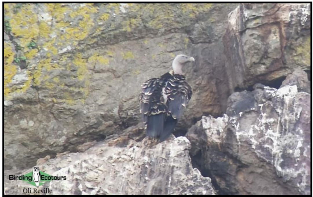
The Straits of Gibraltar has become home to the Critically Endangered Rüppell's Vulture in recent years. This is still an incredibly rare bird in Europe, and worth searching for.

The mountain behind the village, known as <u>Sierra de la Plata</u>, is home to a Griffon Vulture colony and, with luck, we may also find Common Kestrel , Egyptian Vulture , and the Critically Endangered (<u>BirdLife International</u>) Rüppell's Vulture .