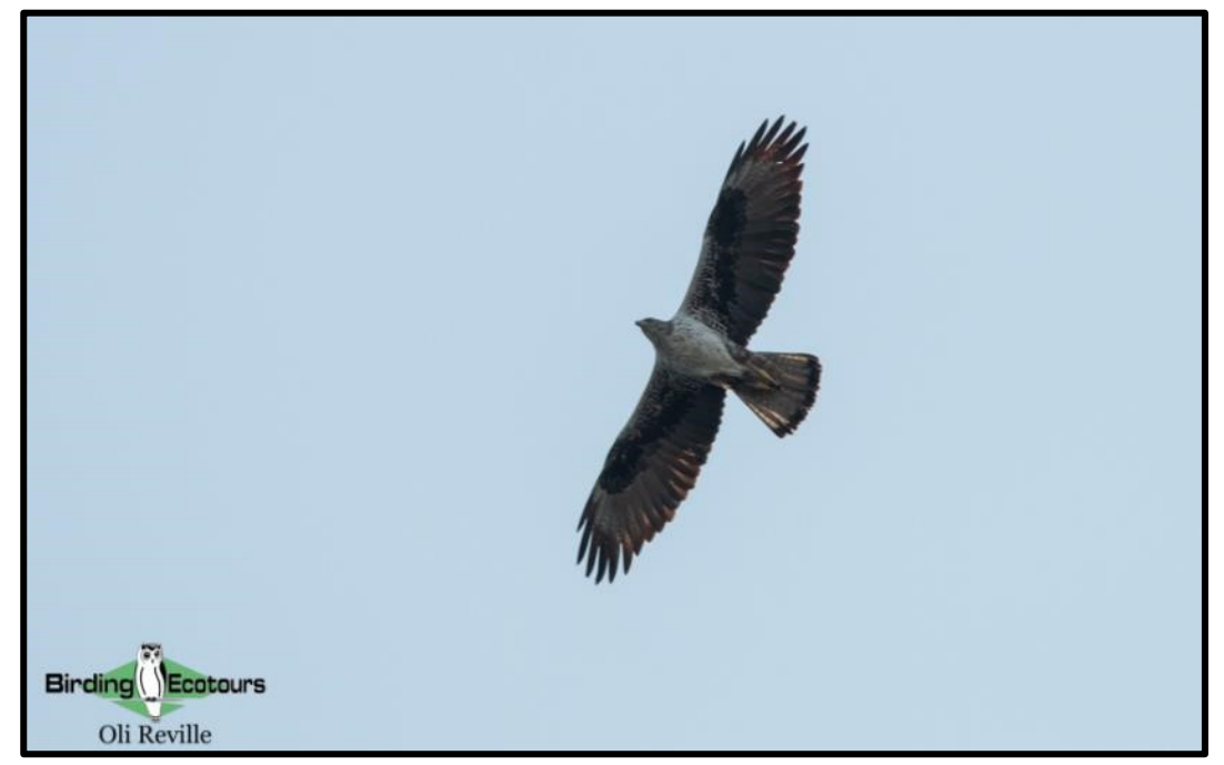
The prey rich farmlands of La Janda attract the powerful Bonelli's Eagle from its nearby mountain home. Fall is an excellent time to see juveniles learning their hunting craft here.

Bonelli's Eagle and the Iberian endemic Spanish Imperial Eagle , a species that numbers under 1,000 individuals, but is slowly increasing.