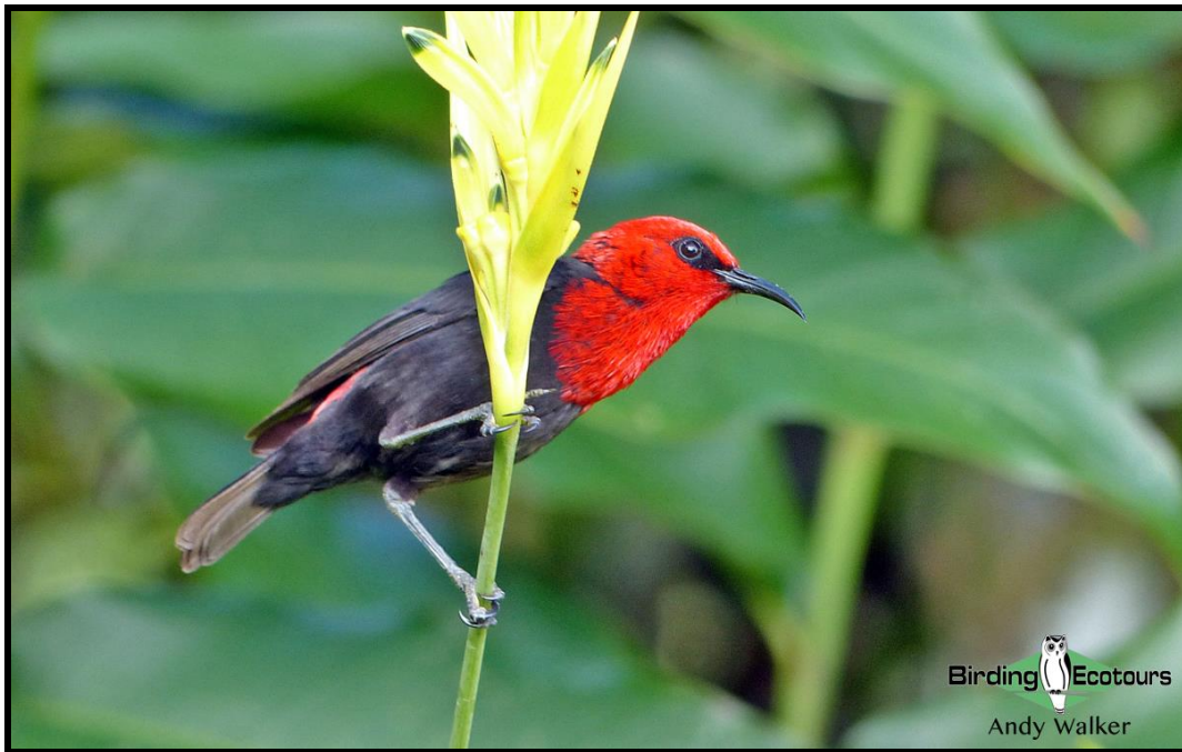
The striking Cardinal Myzomela can be found on the smaller islands of Lifou and Ouvea.

In 2023 this short tour can be combined with either of the following two tours, Eastern Australia: From the Outback to the Wet Tropics (before) and/or New Zealand: Birding Extravaganza (after).