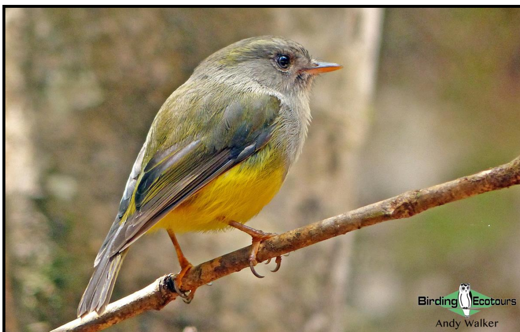
One of the smaller endemic species to be found in Parc de la Rivière Bleue is the Yellow-bellied Flyrobin . They can often be found around the picnic sites, giving good views!