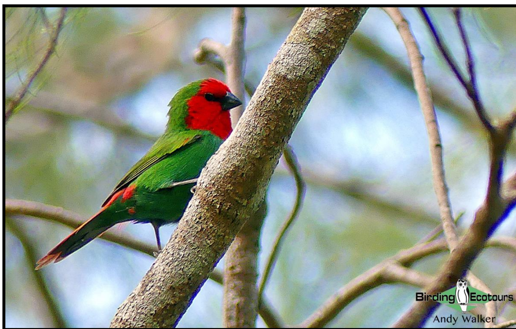
The endemic Red-throated Parrotfinch is one stunning bird and it can be seen in the Sarraméa area.