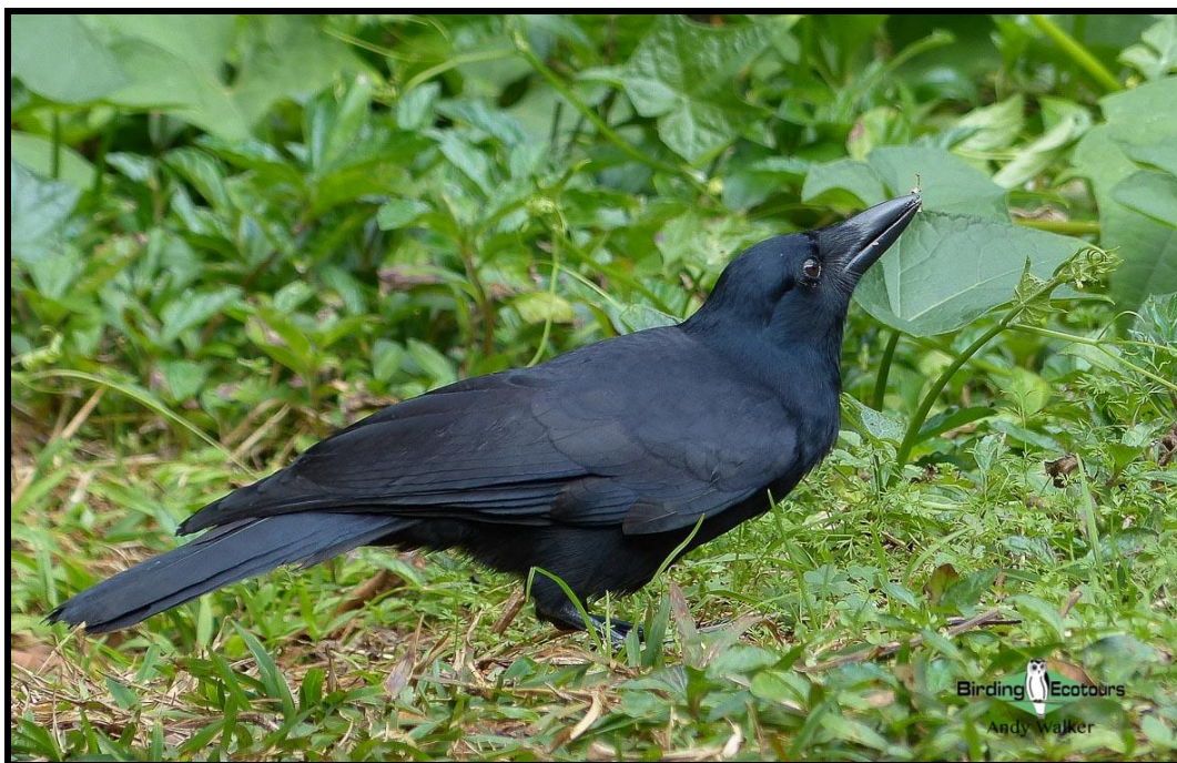
New Caledonian Crow is a fascinating species because it uses tools to forage.

Most endemics found on Grande Terre should be encountered during our time here, and these include White-bellied Goshawk , Kagu , Cloven-feathered Dove , Goliath Imperial Pigeon , Horned Parakeet , New Caledonian Parakeet , New Caledonian Myzomela , Barred Honeyeater , New Caledonian Friarbird , New Caledonian Whistler , the tool-using New Caledonian Crow , New Caledonian Cuckooshrike , Yellow-bellied Flyrobin , Green-backed White-eye , Striated Starling , and Red-throated Parrotfinch . Two species, the Critically Endangered (IUCN) Crow Honeyeater and the increasingly rare New Caledonian Thicketbird , are becoming more difficult year on year but we will still try to find them in suitable areas where they may still be hanging on. Unfortunately, four endemic species are now considered likely to be extinct with no recent sightings, these include New Caledonian Nightjar , New Caledonian Owlet-nightjar , New Caledonian Rail , and New Caledonian Lorikeet .