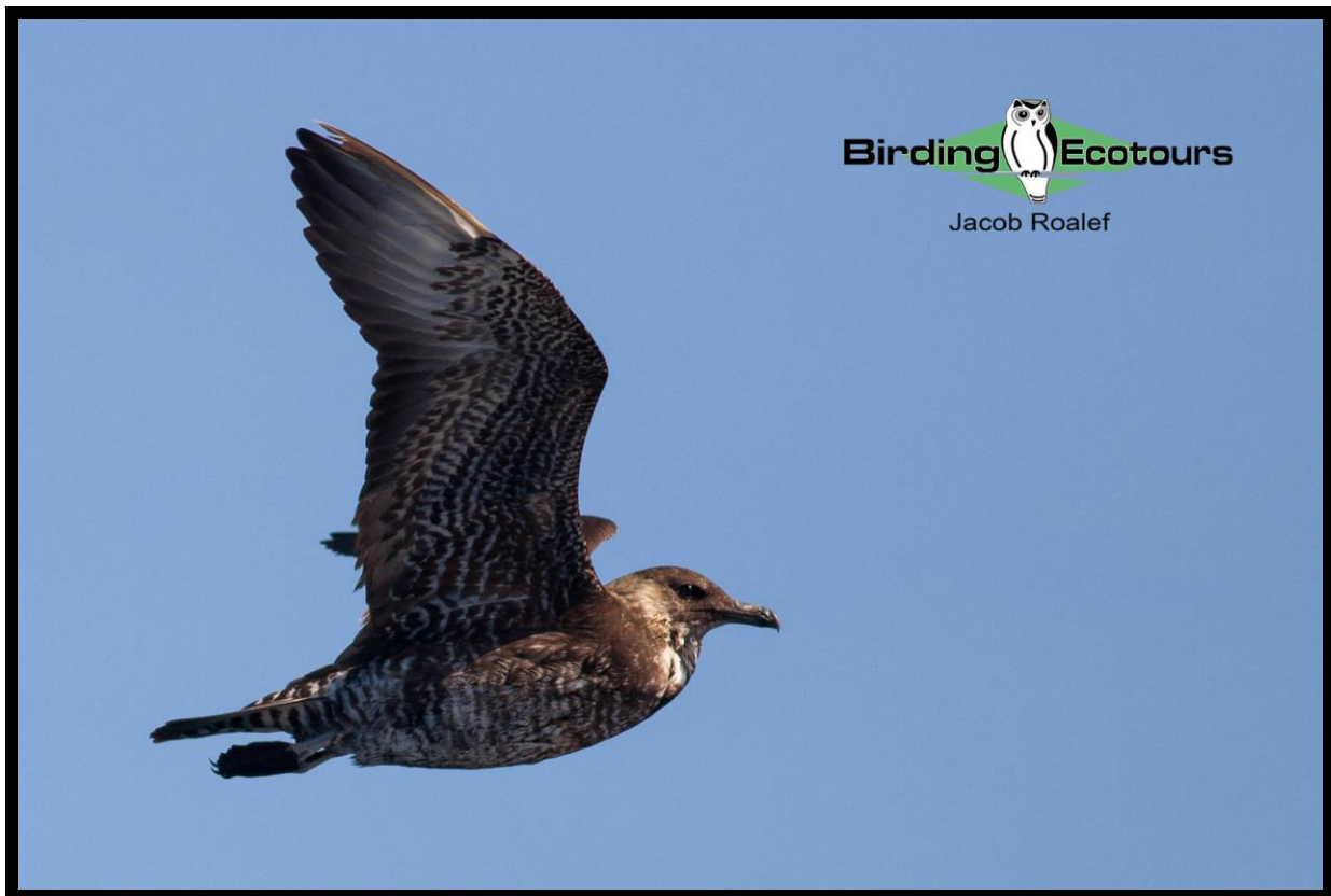
The powerful Pomarine Jaeger patrols the waters of Utqiagvik.