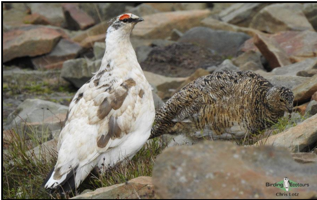
Rock Ptarmigan can be quite common and confiding.

You arrive in the world's northernmost town, historic Longyearbyen (previously known as "Long Year City"), deep within the Arctic Circle, and we have time to explore this small city of about 2000 human inhabitants. We then depart on our cruise for the northern parts of the beautiful, remote Svalbard Archipelago (previously known as Spitsbergen). While one of our main targets will be Polar Bear (and other Arctic mammals), our guide is first and foremost a birding guide, so he'll certainly be constantly watching for all the special birds. We plan to visit a breeding colony of Ivory Gulls , we should see Rock Ptarmigan , and we'll also of course try for all the sea ducks and all other desirables. The scenery is truly spectacular, with all the glaciers, fjords, jagged peaks, and myriads of small islands.