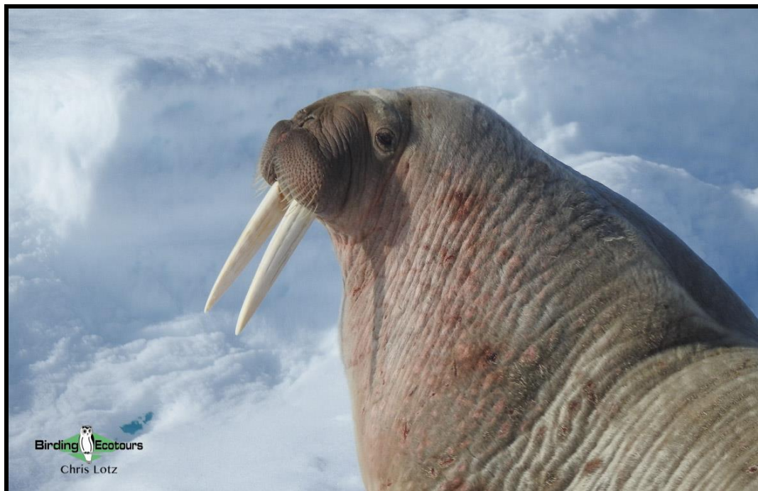
Walrus are usually encountered on this cruise.

Weather dependent, we will either sail into Forlandsundet, where we might encounter Walrus , or alternatively into St. Johns Fjord or to Isfjorden and possibly landing on Alkhornet, where along the cliffs we will look for nesting seabirds and along the base of the cliffs Arctic Fox may be seen foraging for fallen chicks or eggs. We may see Svalbard Reindeer grazing before making a nighttime arrival back in Longyearbyen.