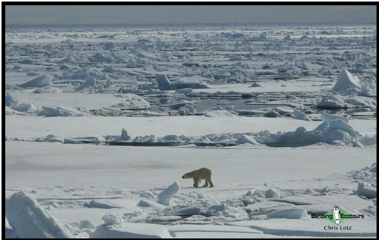
Polar Bear is one of our targets on this trip.