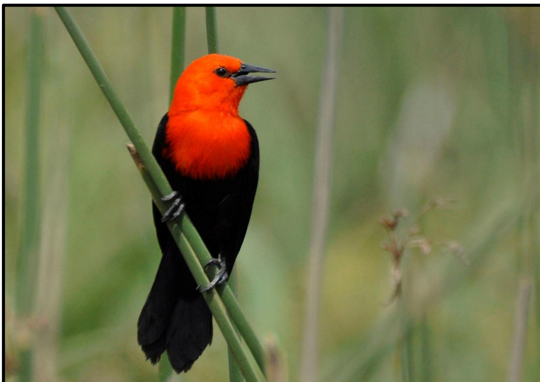
Birding the Iberá Marshlands may produce sightings of the beautiful Scarlet-headed Blackbird.

Overnight: Estancia San Juan Poriahú, Ituzaingó