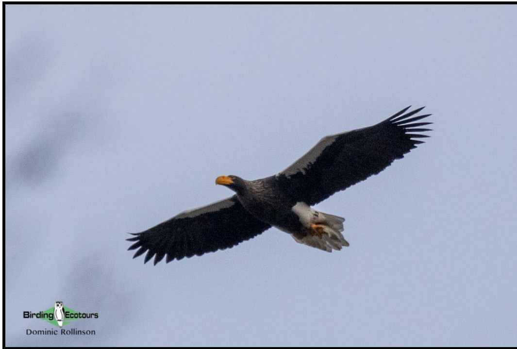
One of the biggest targets of the trip — Steller's Sea Eagle .