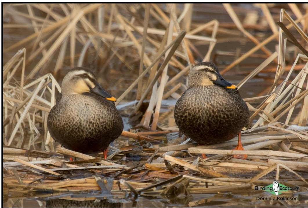
A pair of Eastern Spot-billed Ducks.