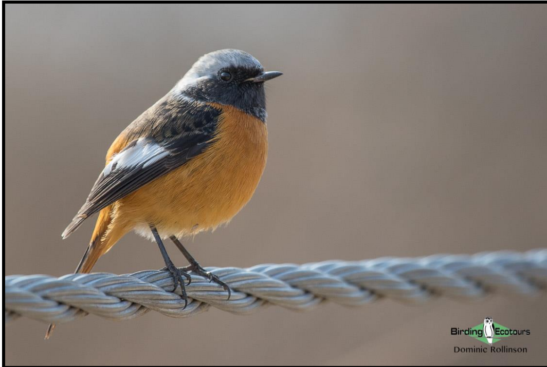
Daurian Redstart adds a splash of color to the Japanese woodlands.