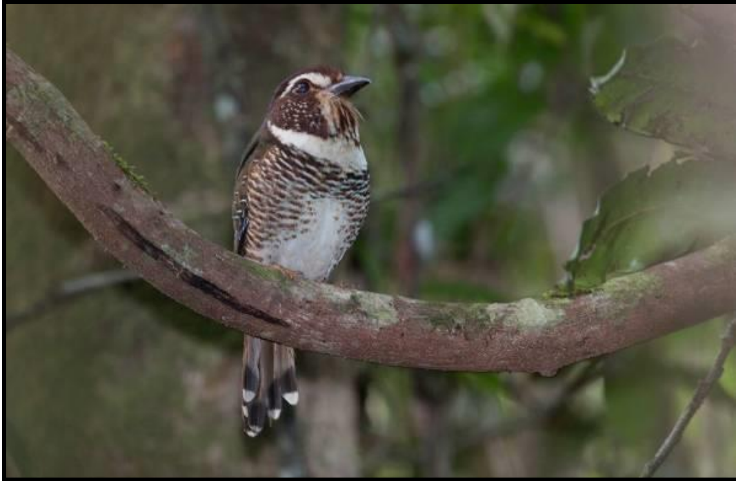
Short-legged Ground Roller - Brachypteracias leptosomus