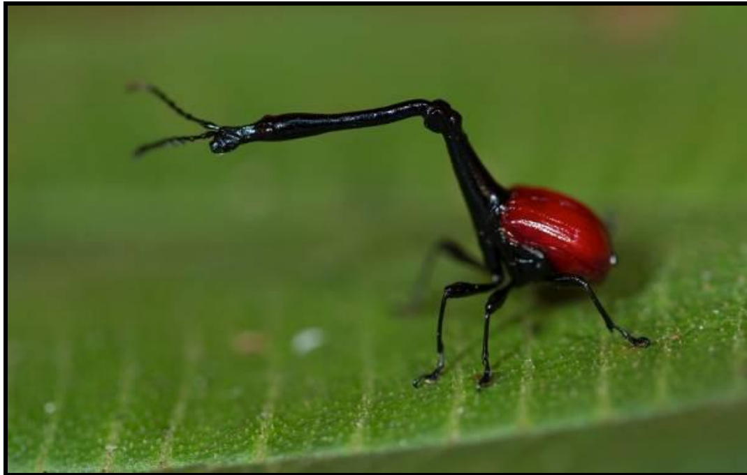
Giraffe weevil - Trachelophorus giraffa

In the late afternoon, once the heat had settled, we visited the local lemur rehabilitation center. Here we had close encounters with eastern bamboo lemur, black-and-white ruffed lemur, and brown and red-fronted brown lemurs. This was a hands-on experience that I am sure no one will forget in a hurry, the smiles still etched into everyone's faces hours after the visit. Birding was not the focus as this time, but we did get Chabert Vanga mobbing a Frances's Sparrowhawk and beautiful views of a pair of skulking Madagascan Rails . A short night walk was conducted, where Geoffroy's dwarf lemur and Goodman's mouse lemur were enjoyed, as well as Glaw's short-nosed and nose-horned chameleons, of which we managed to locate a small number before heading back for dinner.