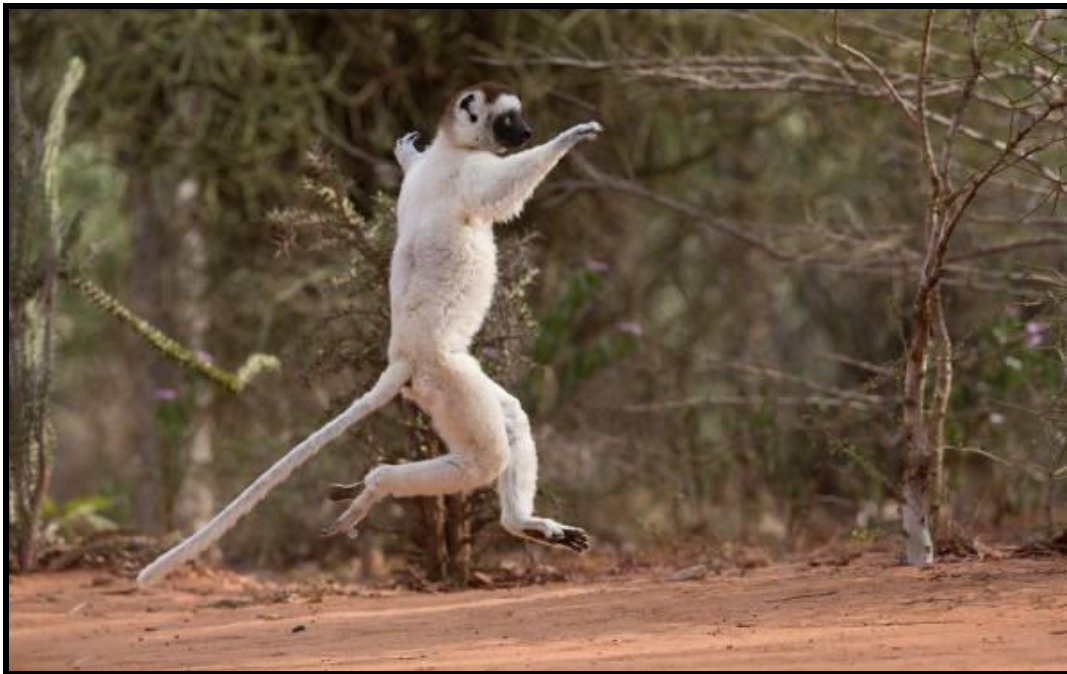
Verreaux's sifaka - Propithecus verreauxi

In the afternoon a sortie into the sisal fields took place, where we after some time connected with a pair of fine-looking Madagascan Sandgrouse as well as a handful of Madagascan Buttonquails , two of our main targets. Running Coua and flocks of Grey-headed Lovebird also entertained. A night walk produced a trio of warty chameleons and a brilliant Madagascan tree boa hunting up in the canopy.