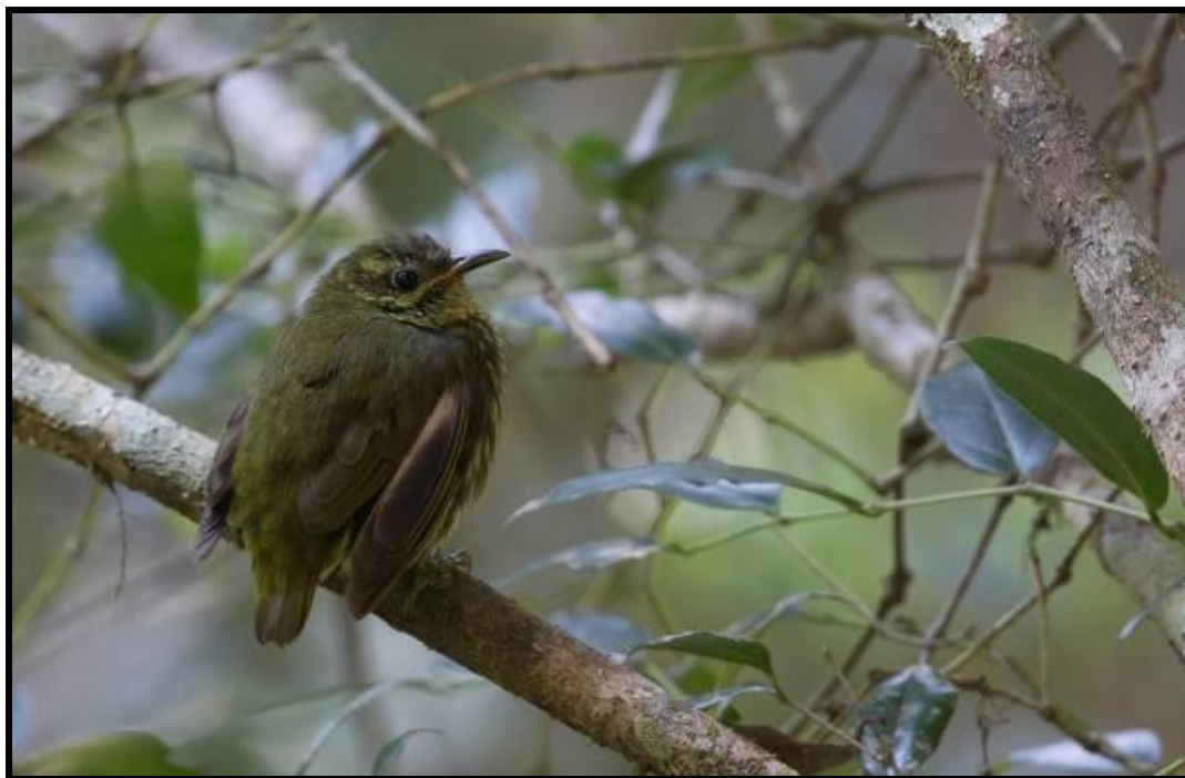
Velvet Asity - Philepitta castanea

We then settled down for lunch at a small lake, which produced great views of Stripe-throated Jery , Madagascan Buzzard , Malagasy Starling , Madagascan Blue Pigeon , Madagascan Spinetail , Madagascan Stonechat , Madagascan Wagtail , Common Moorhen , a pair of Meller's Ducks , Madagascan Swamp Warbler , and a flock of the tiny Madagascan Mannikins , among others. Returning to our hotel we added Olive Bee-eater and heard a number of Madagascan Flufftails , with some of us getting brief views of the little skulkers.