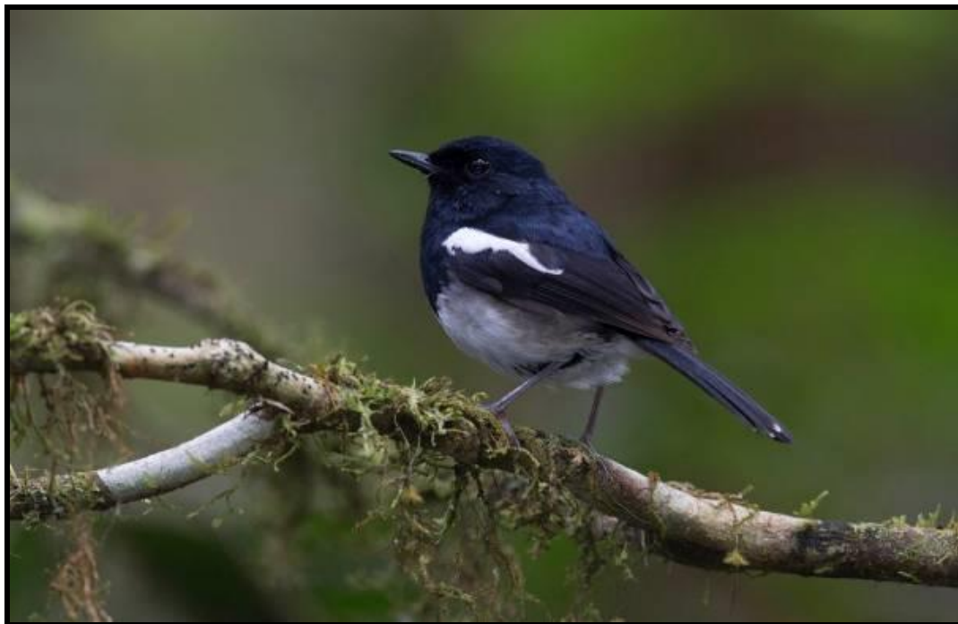
Madagascan Magpie-Robin - Copsychus albospecularis

After finally having arrived at Berenty Reserve, situated among the sisal plantations of the southwest, we picked up ring-tailed lemur and the famous dancing Verreaux's sifaka, which put on a wonderful cameo for us in late golden light. The walk itself added a beautiful jeweled chameleon, Giant Coua , Helmeted Guineafowl , White-browed Hawk-Owl , Malagasy Paradise Flycatcher , Crested Drongo , Madagascan Magpie-Robin , Crested Coua , Malagasy White-eye , Malagasy Turtle Dove , Malagasy Coucal , Frances's Sparrowhawk , and a really obscured view of Madagascan Cuckoo-Hawk sitting up high on top of its nest. White-footed sportive lemur eventually put in an appearance on the trip, and a night walk later in the evening yielded a few treats in the form of warty chameleon, more white-footed sportive lemur, grey-brown mouse lemur, and Madagascan Nightjar .