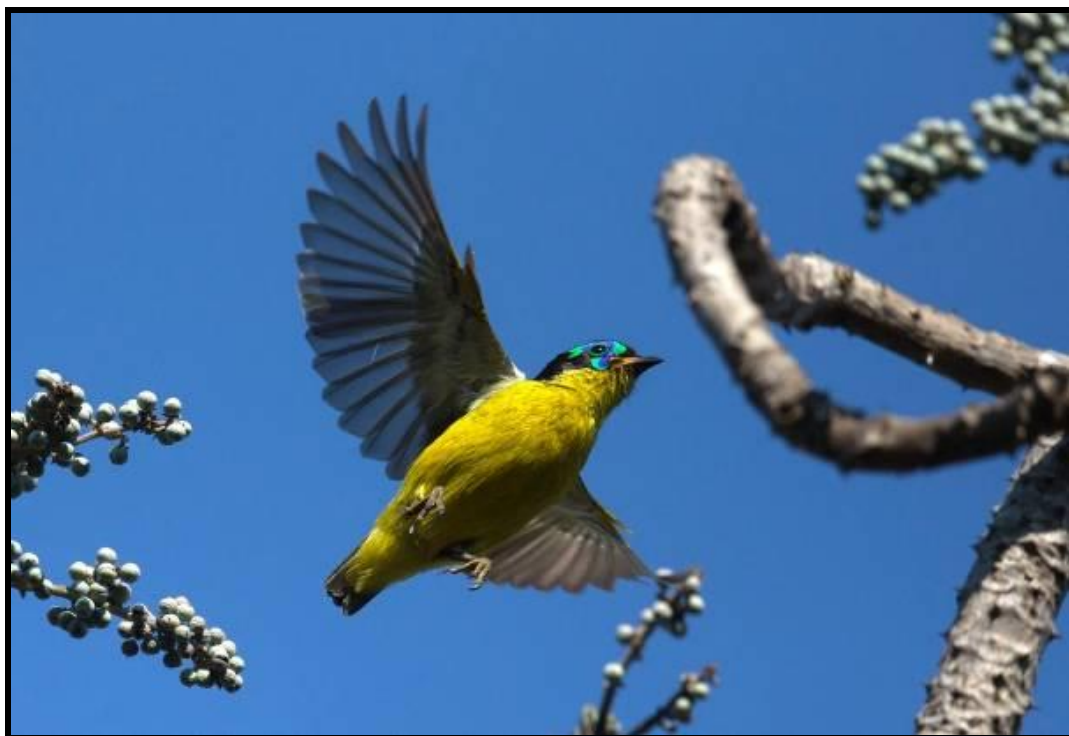
Schlegel's Asity - Philepitta schlegeli

Caffeinated and lightly fed we headed for the primary forest of the northwest. It was heating up rapidly, but the birds were certainly active. Coquerel's Coua called incessantly, and we found Malagasy Bulbul , Common Newtonia , Madagascan Buzzard , Lesser Vasa Parrot , Madagascan Magpie-Robin , Long-billed Bernieria , a variety of color variations of Malagasy Paradise Flycatcher , Hook-billed Vanga , Blue Vanga , and Madagascan Cuckooshrike and had great views of a few male Schlegel's Asities , whose colorful caruncles were glowing brilliantly in the morning light. While returning for a full breakfast Grey-headed Lovebird and Broad-billed Roller were added, and a drive out of town to a nearby lake produced Black-winged Stilt , Glossy Ibis , Yellow-billed Kite , Striated Heron , African Palm Swift , Pied Crow , and a handful of Madagascan Jacana .