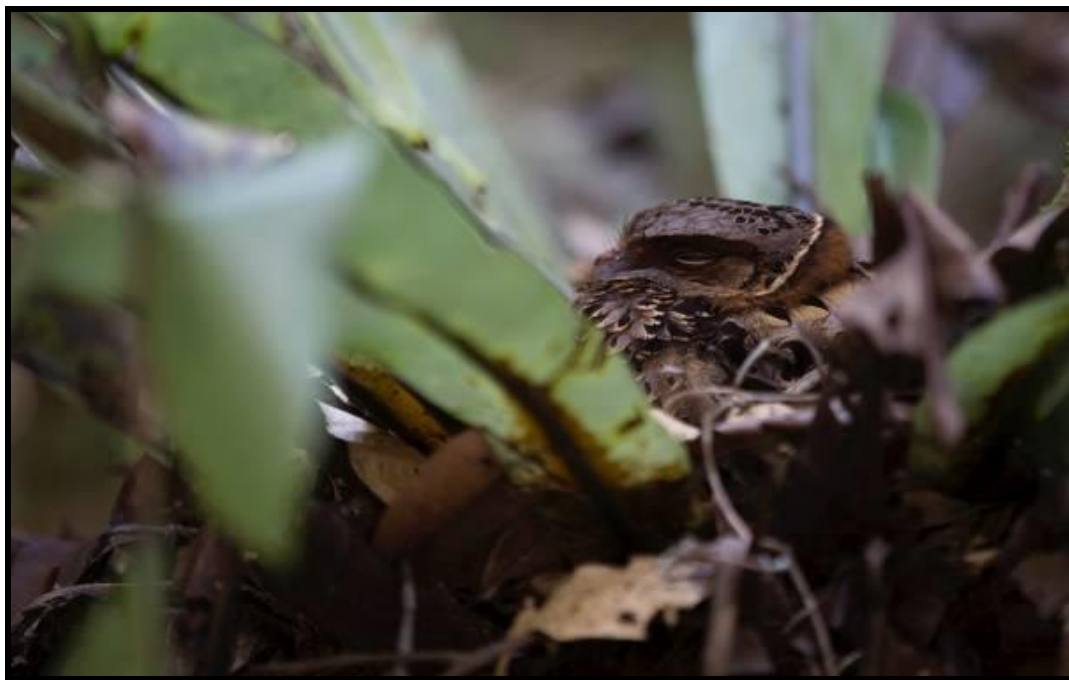
Collared Nightjar - Gactornis enarratus

A brief night walk turned up the diminutive nose-horned chameleon, Glaw's short-nosed chameleon, green bright-eyed frog, Geoffroy's dwarf lemur, and Goodman's mouse lemur, as well as a number of interesting arachnids and insects.