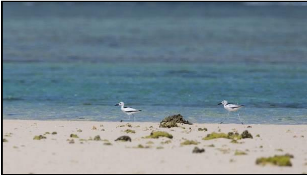
Crab-plover - Dromas ardeola