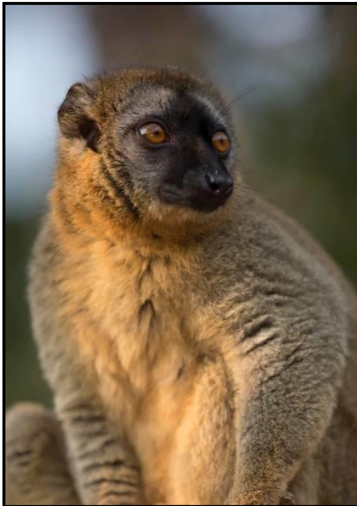
Red-fronted brown lemur - Eulemur rufifrons

A brief breakfast followed by a quick drive had us in the secondary forest not long after sunrise. Golden bamboo lemur, one of this national park's main drawing cards, was first on our list, and red-fronted brown lemur was added not long afterwards. The birding was also great, and we had brilliant views of Pitta-like and Scaly Ground Rollers , Velvet Asity , Rufous Vanga , and Crossley's Vanga , while White-throated Oxylabes played hide-and-seek with us and we picked up many other common forest species. Pollen's Vanga showed early in the morning, and Malagasy Green Sunbird and Grey-crowned Tetraka showed nicely. A lookout point produced a pair of the elusive ring-tailed vontsira (mongoose), while a little while later a pair of Brown Mesite was located and enjoyed by all before we headed for lunch.