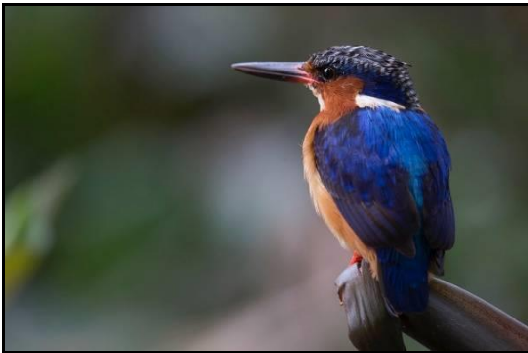
Malagasy Kingfisher - Corythornis vintsioides

After lunch back in the center of town we had a brief break before making our way to the local zoo. Here we had repeat views of many of the herons and egrets as well as Malagasy Kingfisher and an addition in the form of Malagasy Turtle Dove , while a variety of unique lemurs and birds were on show in the zoo grounds, including a small number of the interesting fossa.