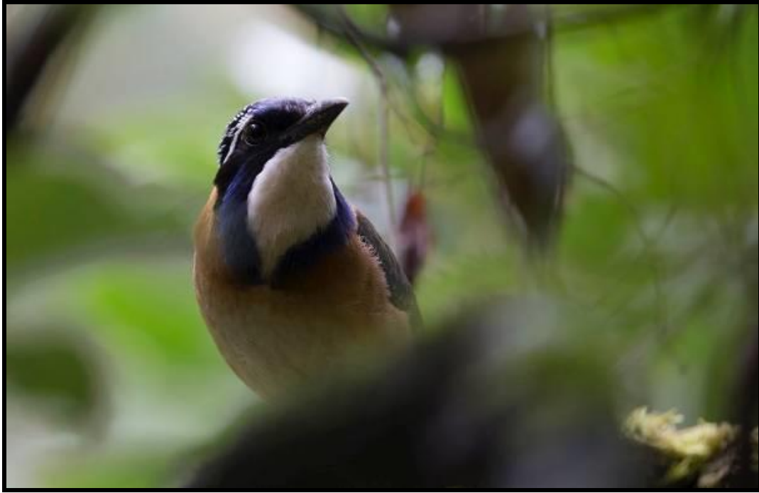
Pitta-like Ground Roller - Atelornis pittoides

In the afternoon we visited some nearby rice paddies, where we enjoyed a flock of tiny Madagascan Mannikins , Mascarene Martin , Malagasy Coucal , Madagascan Harrier-Hawk , Madagascan Flufftail , Malagasy Brush Warbler , Madagascan Cisticola , Madagascan Stonechat , Hamerkop , Purple Heron , and two avian treats in the form of Madagascan Snipe and Greater Painted-snipe . We then commenced a night walk in the area, which produced wonderful rufous mouse lemurs, combating male red brook snakes, and Geoffroy's dwarf lemur among other herpetofauna before we had to leave to meet dinner reservations.