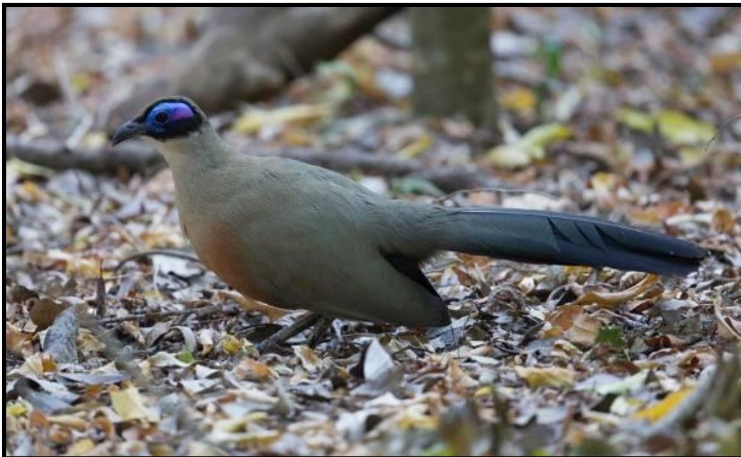
Giant Coua - Coua gigas

A sunrise stroll around the sandstone formations prior to breakfast produced Madagascan Mannikin , Pied Crow , countless Yellow-billed Kites , Namaqua Dove , Olive Bee-eater , Malagasy Coucal , Common Jery , Madagascan Hoopoe , an obliging White-throated Rail in a nearby stream, and a very vocal southern and interior subspecies of Forest Rock Thrush (occasionally split as Benson's Rock Thrush). We then hit the road and traveled south, but not for long, as an overheating engine had us temporarily on the roadside.