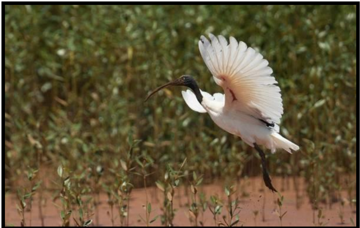
The Endangered (IUCN) Malagasy Sacred Ibis - Threskiornis bernieri