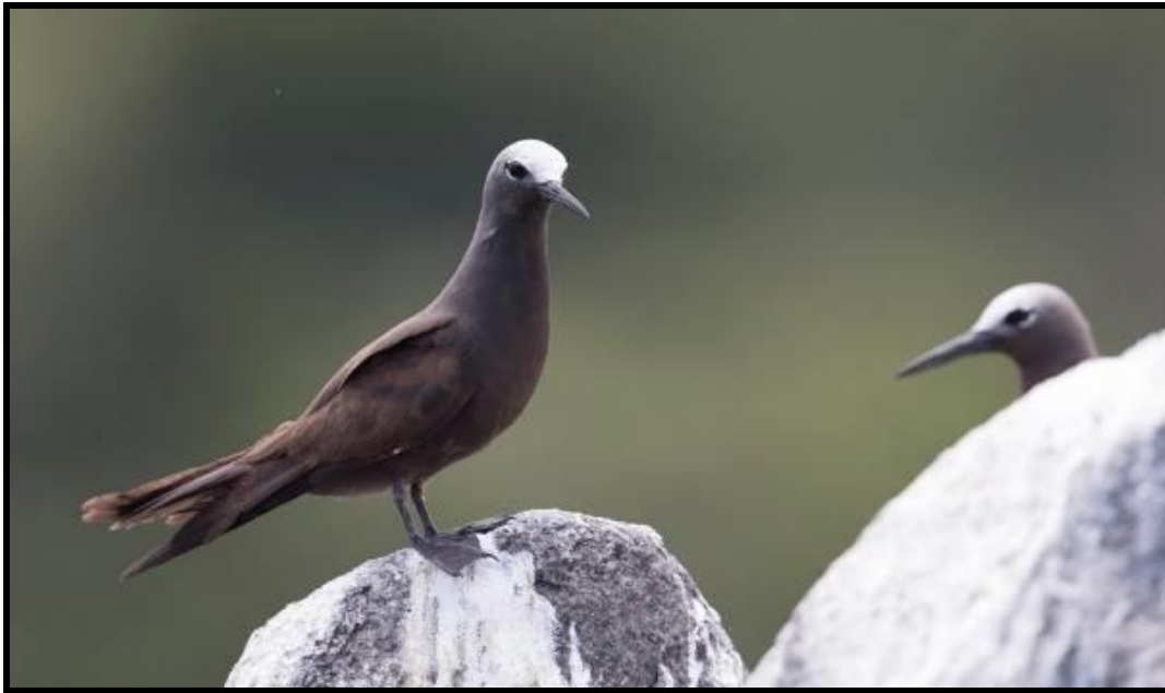
Lesser Noddy - Anous tenuirostris