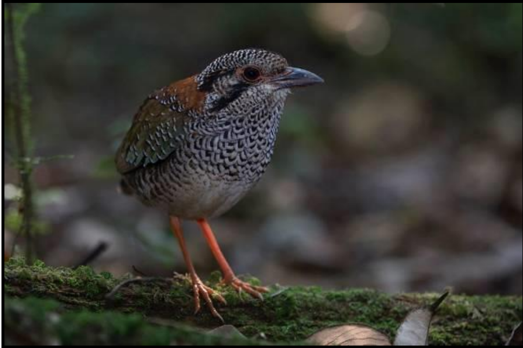
Scaly-ground Roller - Geobiastes squamiger