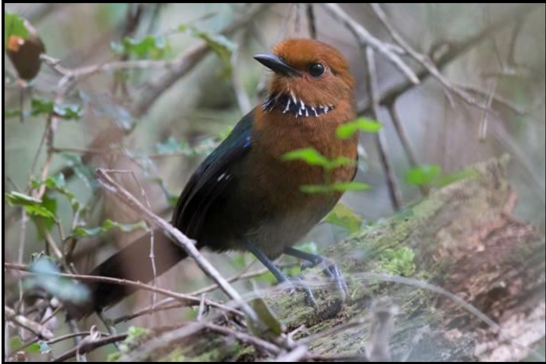
Rufous-headed Ground Roller - Atelornis crossleyi