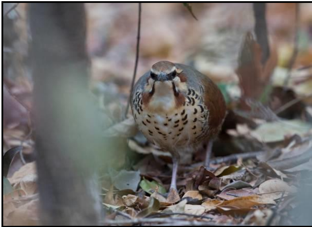
White-breasted Mesite - Mesitornis variegatus

Bright and early we headed for the beach, where we hopped on board of a boat and made our way into the nearby Betsiboka Delta. Here we worked the muddy banks as the tide started to recede. Species came in slowly, such as Malagasy Kingfisher , African Palm Swift , Dimorphic Egret , Lesser Flamingo , and the localized Bernier's Teal . A large roosting flock of shorebirds, made up of Common Ringed Plover , Greater Sand Plover , Common Sandpiper , Curlew Sandpiper , Whimbrel , Terek Sandpiper , and at least four Malagasy Sacred Ibis put in an appearance not long thereafter. Madagascan Harrier-Hawk and Madagascan Buzzard joined Yellow-billed Kite overhead as we headed back.