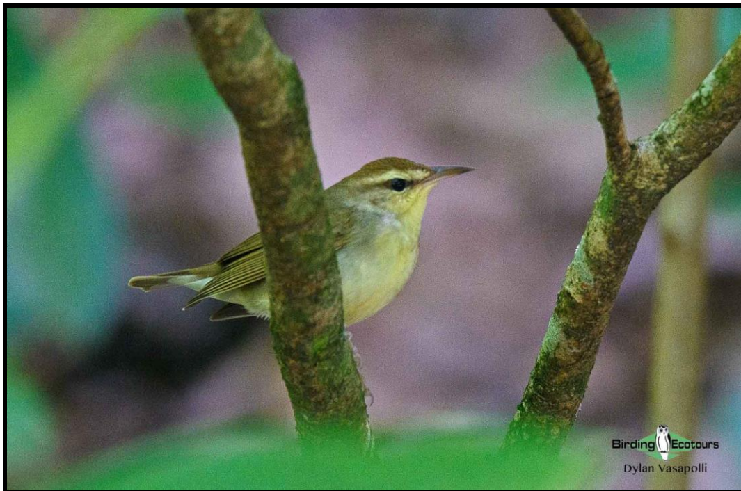
Swainson's Warbler can be often be tough to locate.

As an aside (as this text is about our 1-day trips in Ohio), our new Ohio full-length birding tour, which includes brief forays into Michigan (to near-guarantee Kirtland's Warbler ) and West Virginia (for Swainson's Warbler ) is something you might consider, as we have a realistic chance of seeing all the eastern warblers (and stacks of other birds) on this tour.