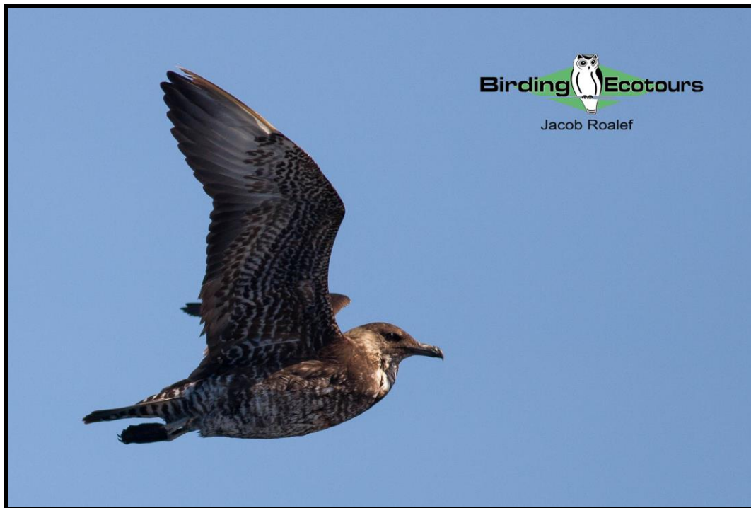
The powerful Pomarine Jaeger patrols the waters of Utqiagvik.