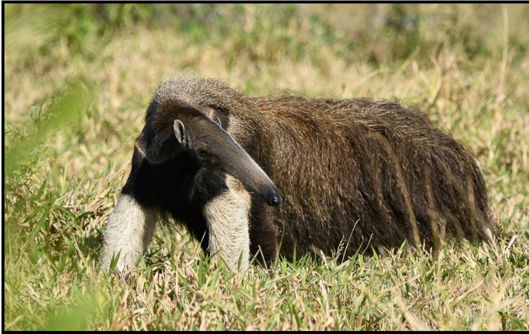
The bizarre Giant Anteater.

Our last port of call is Serra do Cipó National Park , a location renowned for its spectacular gorges and waterfalls. The rocky grasslands found in the higher elevations of this park are home to a highly localized set of Brazilian endemics: the spectacular Hyacinth Visorbearer , the demure Cinereous Warbling Finch , and the recently described Cipo Canastero . Our trip ends back in Belo Horizonte.