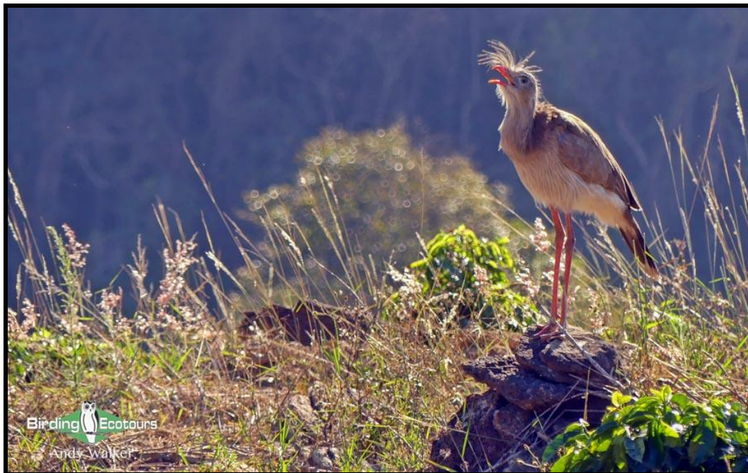
Red-legged Seriema can be seen in the grasslands of Serra da Canastra National Park.

These grasslands support a rich and diverse set of specialized birds, many of which can only be found in Brazil. The skulky Brasilia Tapaculo creeps around in the low, gnarled forest found along streams. Patches of brush and scrub hold the cute and endemic Grey-backed Tachuri. Red-legged Seriema , South America's answer to Africa's Secretarybird, often patrols the grasslands in pairs. The endearing Cock-tailed Tyrant flutters over areas of tall grass with a flight profile reminiscent of a toy airplane. Campo Miner prefers recently burned areas, while tall, wet grass can harbor Tawny-bellied Seedeater and Black-bellied Seedeater . The tops of termite mounds will always be worth a check, as birds like the vulnerable Black-masked Finch and the unique Firewood-gatherer often perch on them to curiously survey their surroundings.