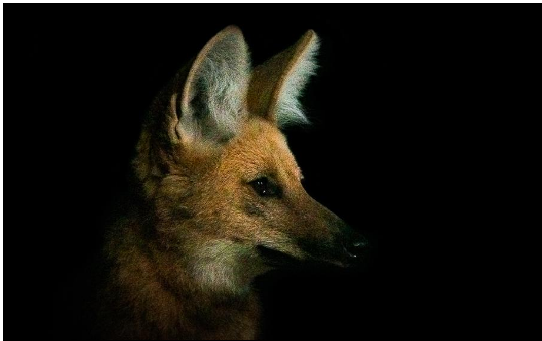
Maned Wolf photographic opportunities are often good at Monasterio do Caraça.