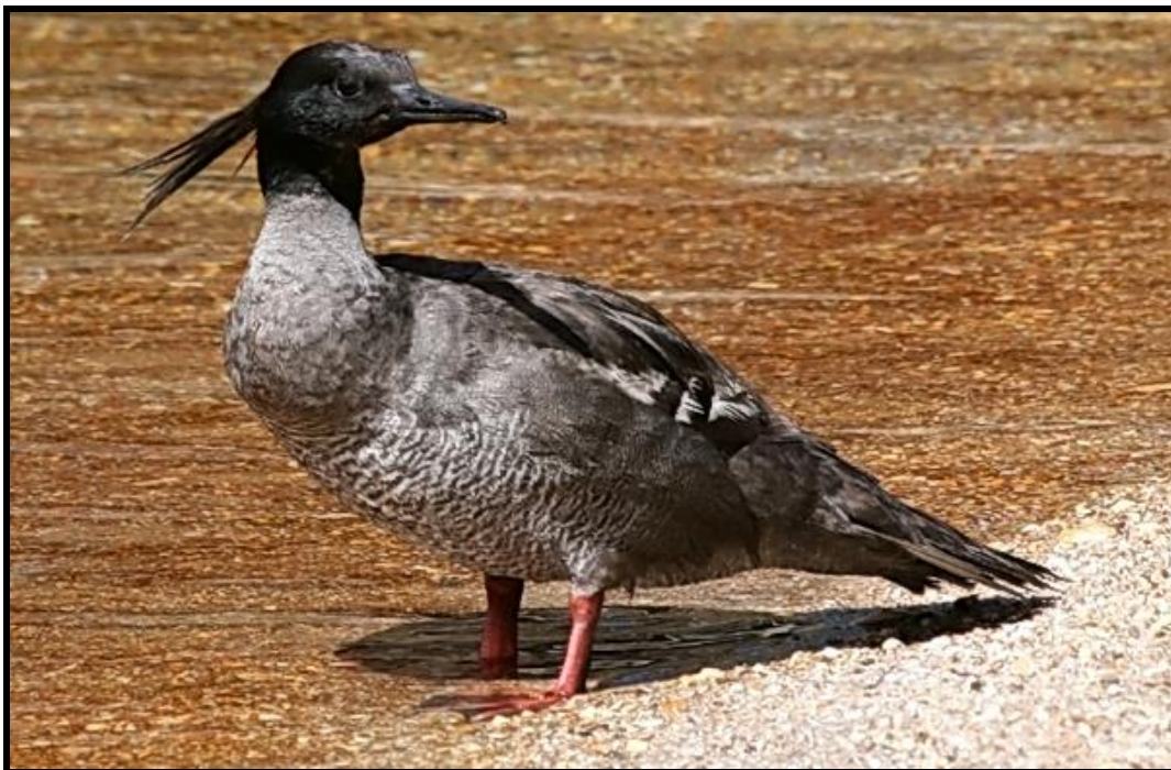
Brazilian Merganser is one of our targets on this trip.

Many people know of the immense Brazilian Amazon with its astonishing biodiversity. Some people might know about the highly endangered Atlantic Forest that once stretched across much larger sections of the Brazilian coast than it does today. However, even within Brazil , very few people are aware of the cerrado: a fascinating biome of vast grasslands, lightly wooded savannas, and ribbons of gallery forest growing along winding rivers. As one of the world's most biodiverse tropical savannas, there are approximately 10,000 plant species in the cerrado. It also supports the greatest variety of large mammals in all of South America, including such iconic species as the stilt-legged Maned Wolf and tube-nosed Giant Anteater . By birding the spectacular landscapes of the inland state of Minas Gerais we hope to encounter a large selection of this special avifauna as well as these two mammals and our main target, the Critically Endangered (IUCN) Brazilian Merganser .