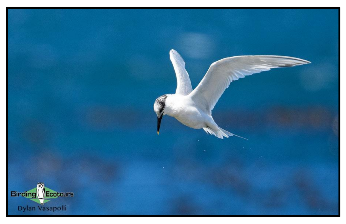
While exploring the Ria Formosa we had close views of Sandwich Tern .

The islets around the site were dotted with waterbirds like White Stork , Great Cormorant , Grey Heron , Little Egret , and Eurasian Spoonbill . We also enjoyed the wonderful sight of a large group of Greater Flamingos flying along the coast. Despite the distance their pink sheen was still clear to see. A Western Osprey also put on a fantastic show towards the end of our boat tour.