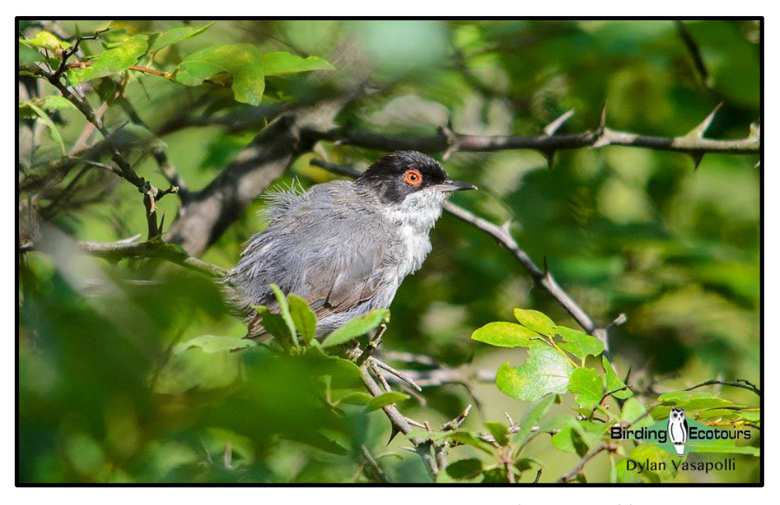
We came across plenty of the beautiful Sardinian Warbler!

Today we took the mountain roads east to the border with <u>Spain</u> as we explored the Douro Valley. However, the day started with thick and unseasonal fog. In this early gloom some of the group heard the distant song of a Eurasian Golden Oriole in the valley below. This was a very unexpected but welcome surprise, given the time of the year. Around the hotel we were able to record Sardinian Warbler , Spotless Starling , Common Blackbird , European Robin , Black Redstart , Eurasian Tree Sparrow , House Sparrow , White Wagtail , and European Goldfinch .