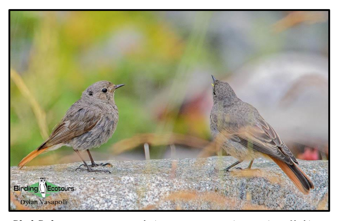
Black Redstart was ever present during our tour, occupying a variety of habitats.

Our short walk around this urban green space gave us Egyptian Goose , Mallard , Common Wood Pigeon , Common Moorhen , Eurasian Coot , Little Grebe , around 35 Yellow-legged Gulls of various ages, Great Cormorant , Eurasian Jay , Eurasian Magpie , Coal Tit , Great Tit , Common Firecrest , Goldcrest , Eurasian Wren , a briefly heard Short-toed Treecreeper , Common Blackbird , Spotted Flycatcher , European Robin , and European Pied Flycatcher .