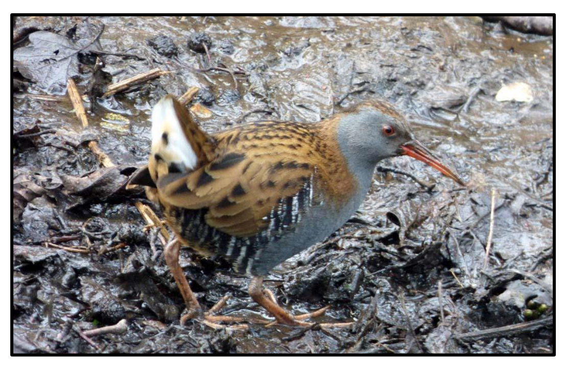
The group enjoyed fantastic views of the often-secretive Water Rail

With the sun getting lower in the sky, we retreated towards our hotel. A brief stop at the saltpans near the hotel gave a wonderful spectacle of around 200 Greater Flamingos feeding on one of the pans. These were joined by Sanderling , Mediterranean Gull , Yellow-legged Gull , Eurasian Magpie , European Stonechat , and our first Spanish Sparrow of the tour.