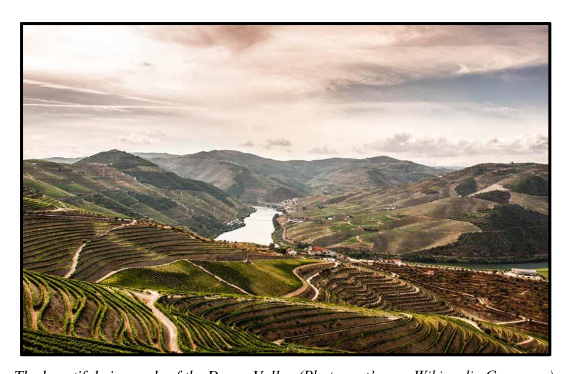
The beautiful vineyards of the Douro Valley.

A total of 145 bird species were recorded during the tour (three of these were "heard only"), along with a few other interesting animals, including European Pond Turtle , Granada (Iberian) Hare , European Rabbit , Red Fox , and European Fiddler Crab . Species lists are at the end of this report. We enjoyed wine tasting at five gorgeous vineyards, visited numerous impressive cultural sites, and soaked in some staggering landscapes.