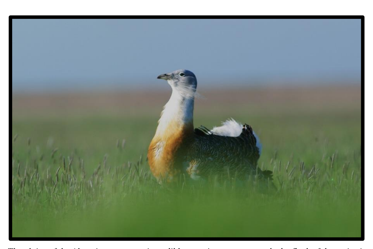
The plains of the Alentejo gave us an incredible experience as we watched a flock of the majestic Great Bustard, one of many highlight birds on this fun tour.