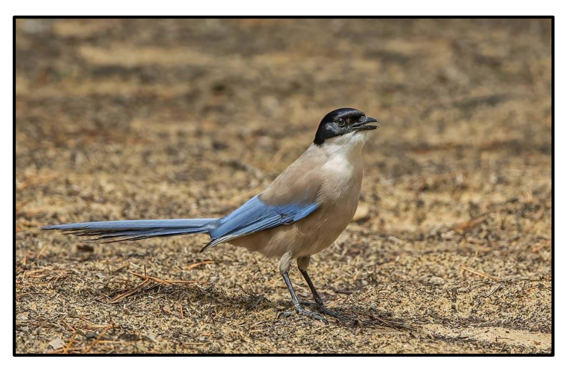
Iberian Magpie finally gave us fantastic views after teasing us throughout the early part of the tour (photo Charles J. Sharp, Wikimedia Commons).

A short stop at Rio Mondego-Ratoeira, a gorgeous section of river, gave us White Wagtail, Grey Wagtail, Common Waxbill, great views of three Common Buzzards, Little Grebe, Mallard, Grey Heron, Eurasian Magpie, Western Jackdaw, and Carrion Crow. Shortly before the river we again enjoyed wonderful views of Woodlark, this time in flight above the road, their beautiful song a joy for all to hear. While we watched these birds a Eurasian Sparrowhawk was seen briefly among the olive groves but disappeared quickly.