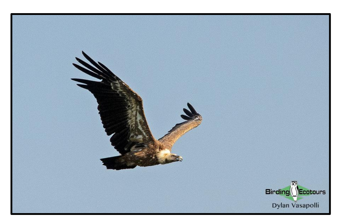
Our viewpoint allowed for excellent views of Griffon Vulture , a truly unique experience as we marveled at this giant bird.

Continuing our drive east we passed through the small village of Maçores. Here we found a colony of Eurasian Crag Martin , which gave excellent views. Continuing east we reached the border with Spain again and stopped for lunch at Miradouro de Penedo Durão. This incredible viewpoint enabled us to get close views of Griffon Vultures , with flight views from below and above achieved along with fantastic views of them perched on rocks in the valley below. Our only Peregrine Falcon of the tour gave a wonderful flyby while we were having lunch too, a nice bonus during our stop here.