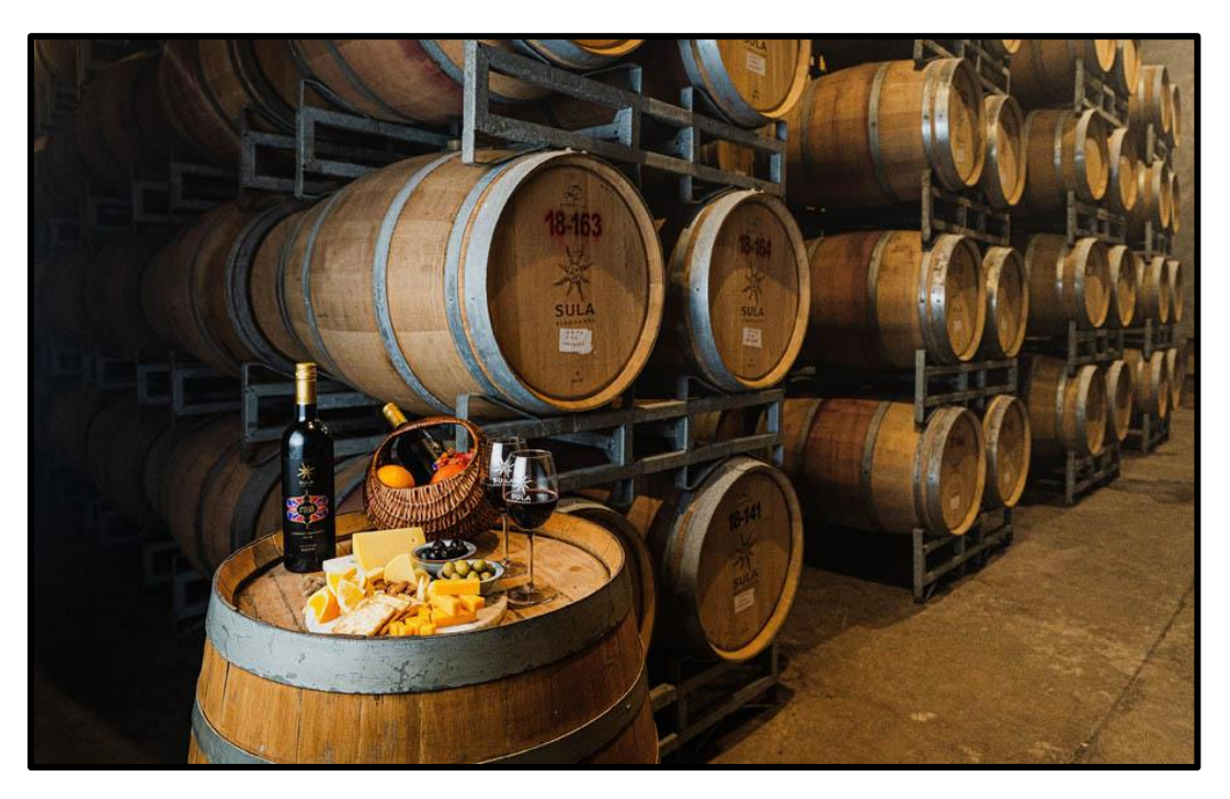
Our visit to Monte da Casteleja was enjoyed by the whole group, who got to sample some tasty wines (photo Puneets26, Wikimedia Commons).

After a quick scan of the nearby fields and trees, which gave us Meadow Pipit , European Stonechat , European Robin , Sardinian Warbler , and a flyover Iberian Magpie , we left the site to head to our next wine tasting experience at <u>Monte da Casteleja</u>.